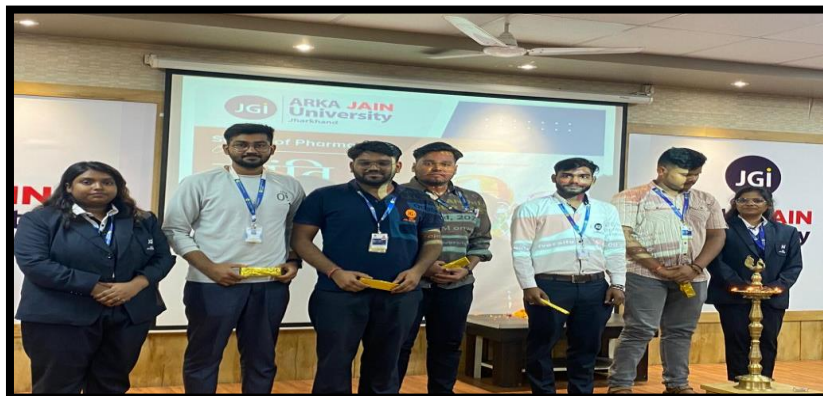
Figure 6: The prize winner of QUIZ competition