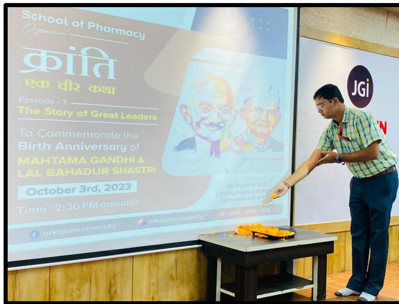
Figure 5: Floral tribute to the Great Souls