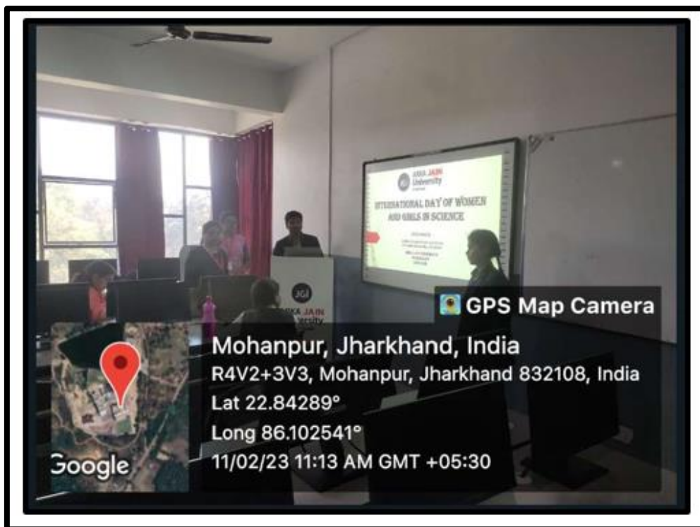
Figure 3: Photo of the International Day of Women and Girls in Science