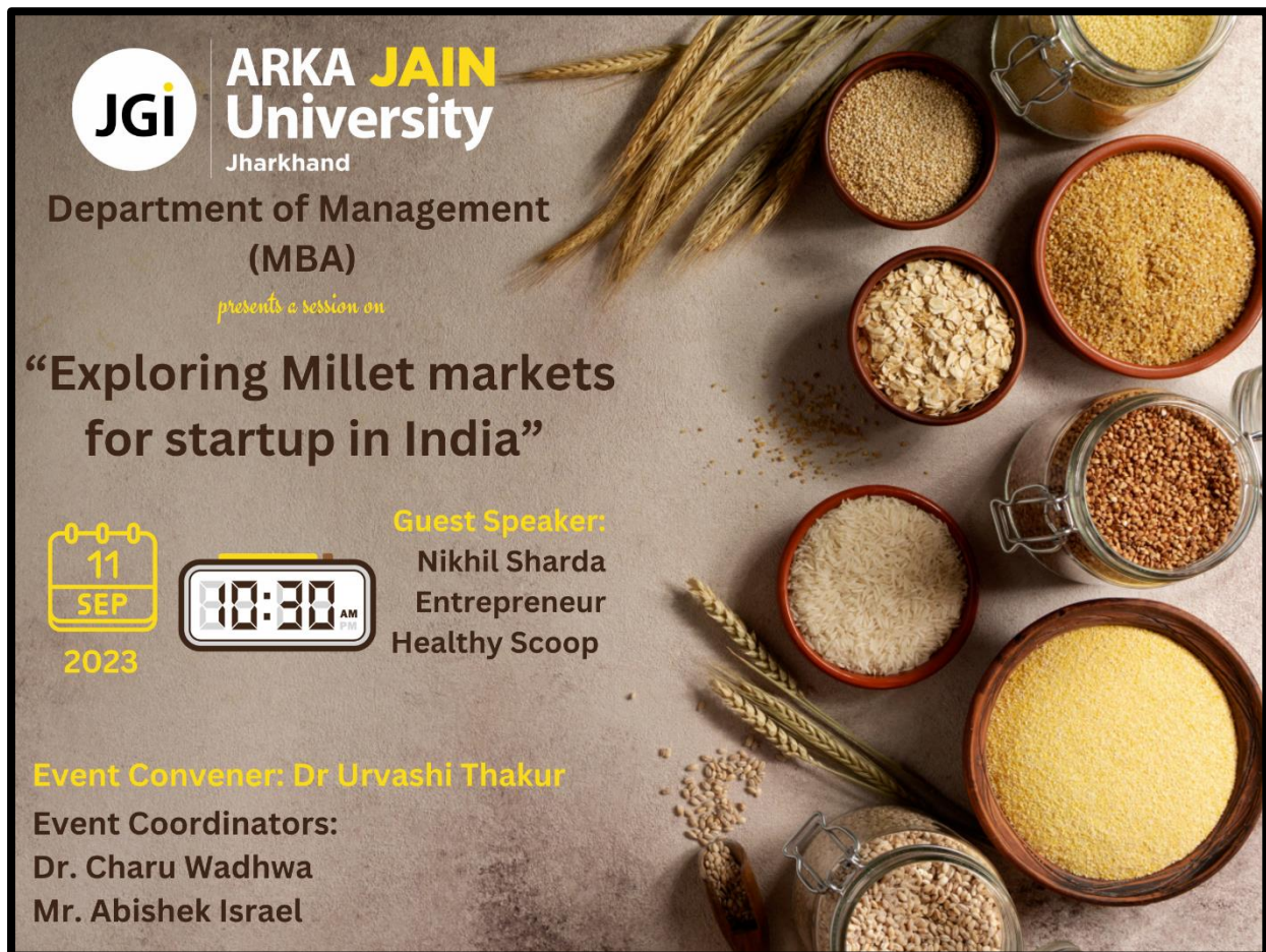
Figure 1: Poster of Exploring Millet Markets for Start-up in India