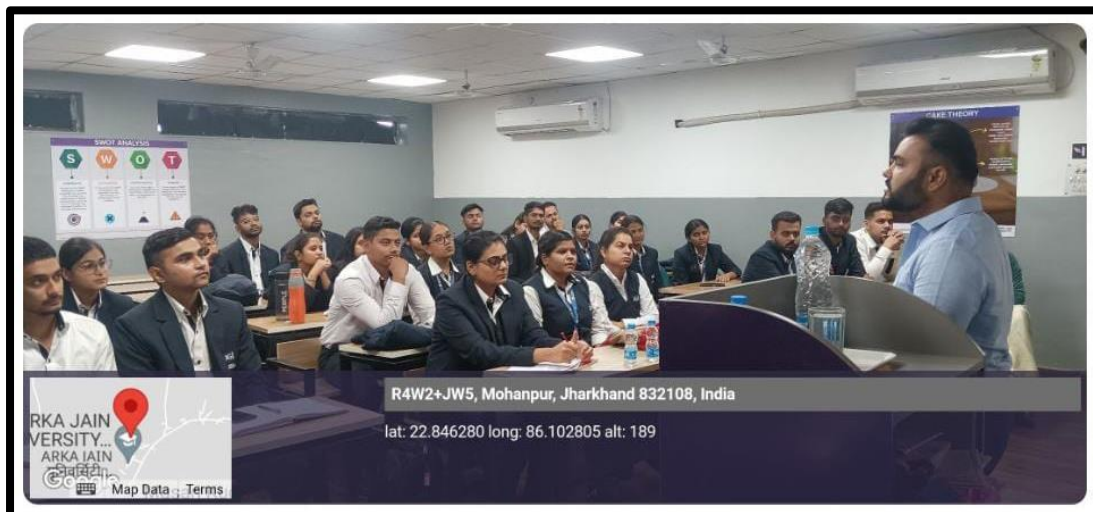
Figure 3: Geo Tag Photo of the Session