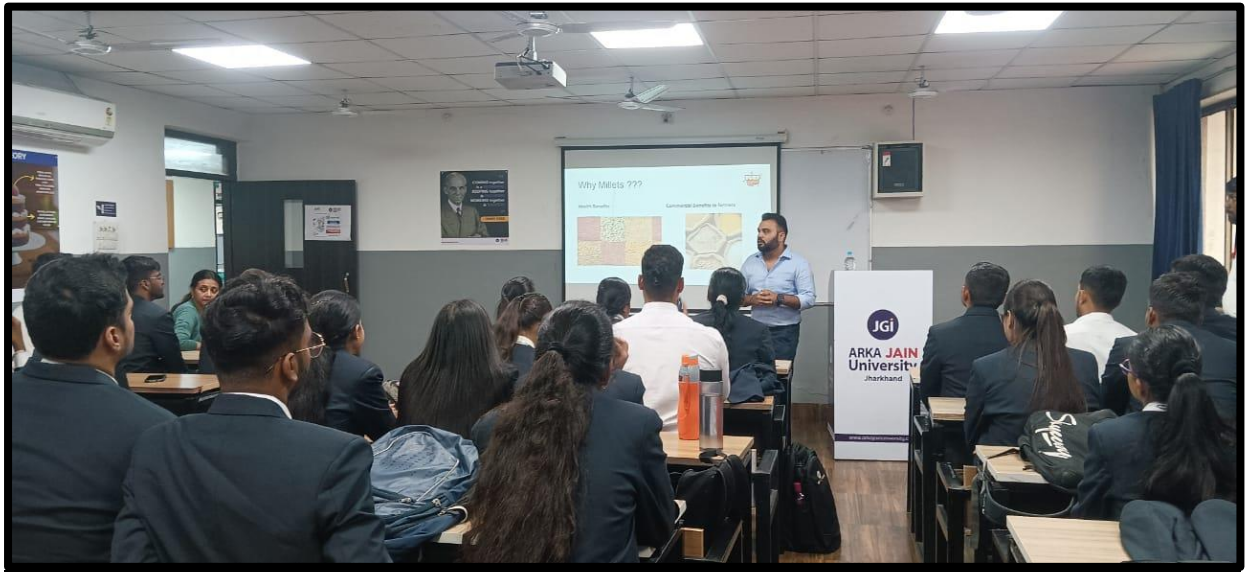
Figure 4: Guest Speaker Exploring Millet Markets for Start-up in India