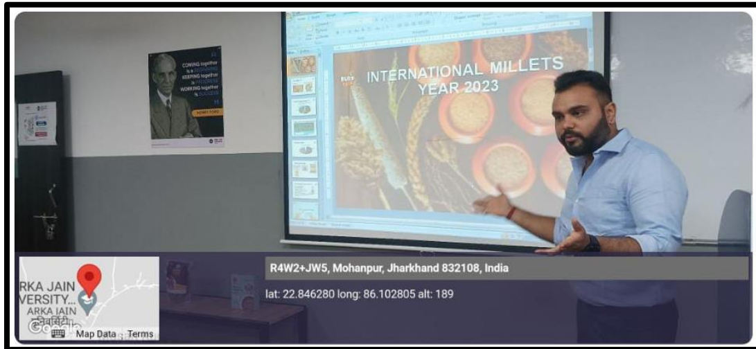
Figure 2: Guest Speaker Explaining about Millet Year