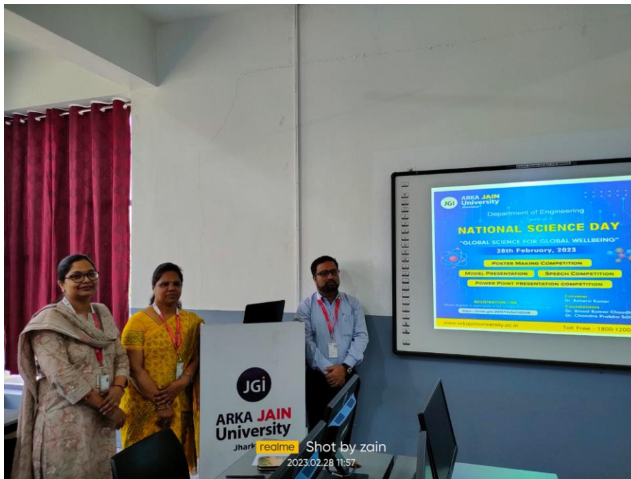
Figure 5: Photo during Competition