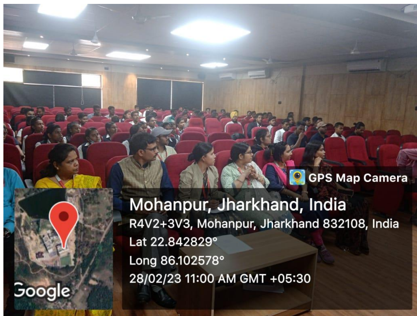
Figure 7: Geo Tag Photo