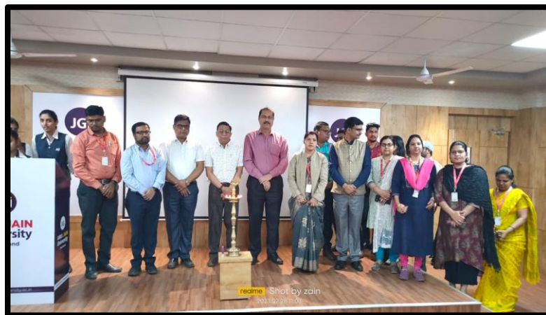
Figure 2: Group Photo