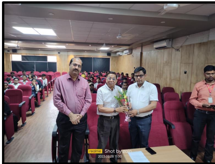
Figure 1: Inaugural Session