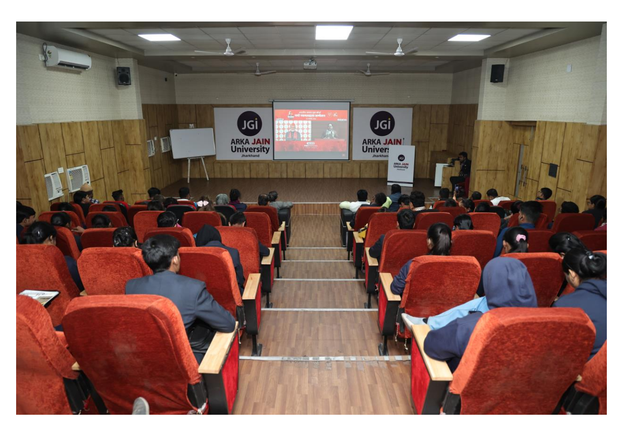
Figure 8: Live Streaming of PM's address to the First time Voters on National Voters' Day