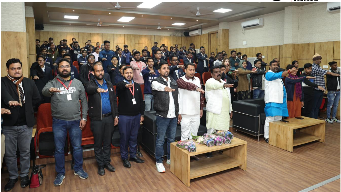
Figure 7: Students and Faculty members taking Voters' Pledge on National Voters' Day