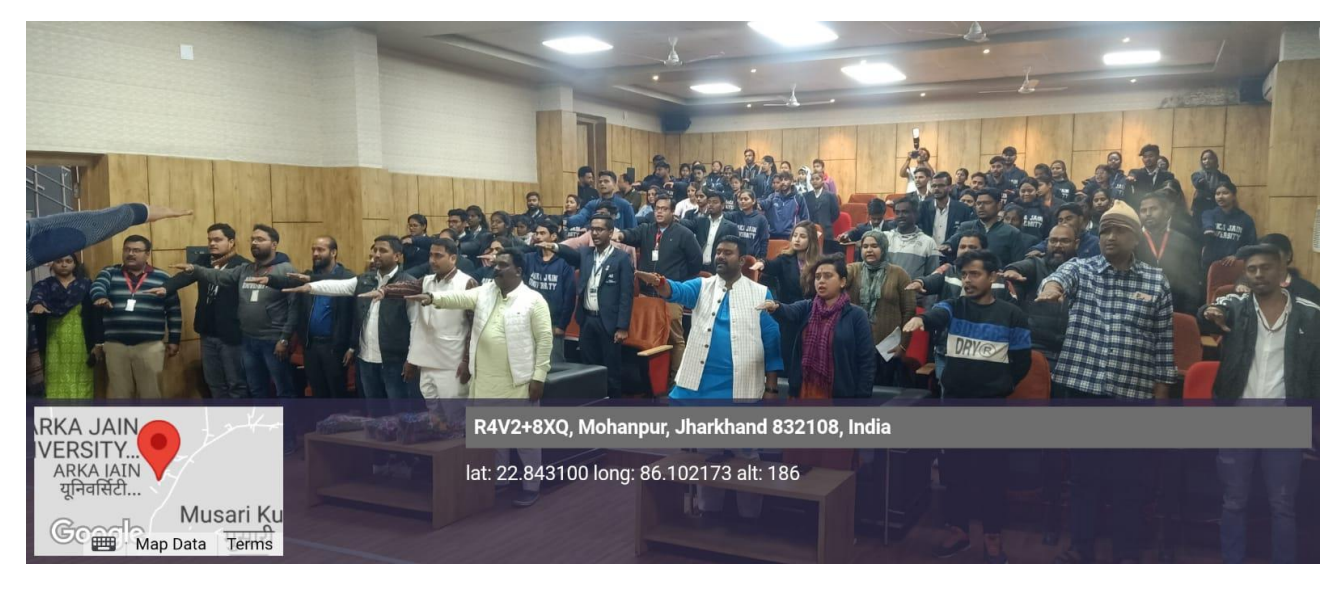
Figure 4: Students and Faculty members taking Voters' Pledge on National Voters' Day