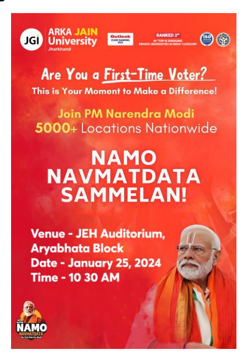
Figure 2: Poster of the National Voter's Day