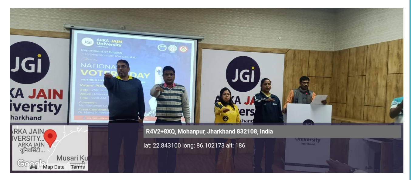
Figure 3: Voters' Pledge being announced by the faculty members on National Voters' Day