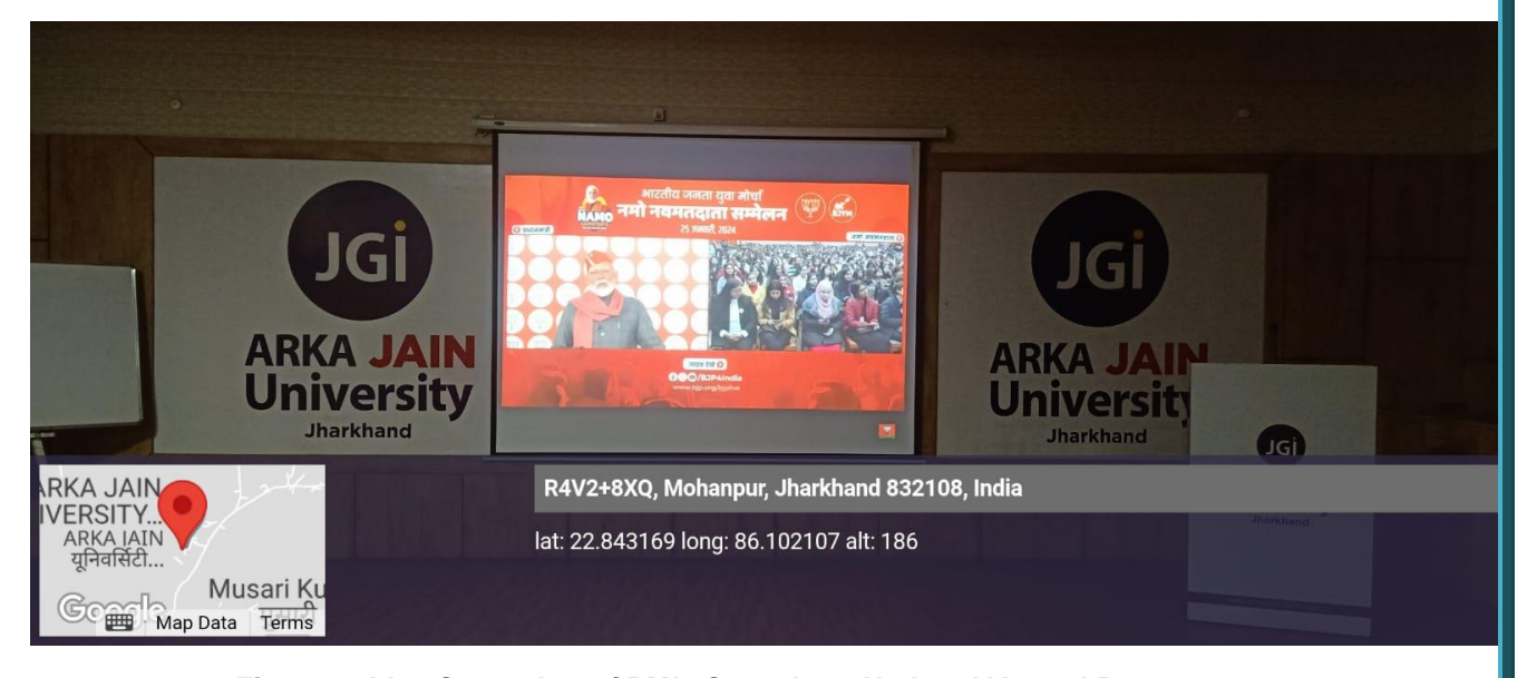
Figure 6: Live Streaming of PM's Speech on National Voters' Day