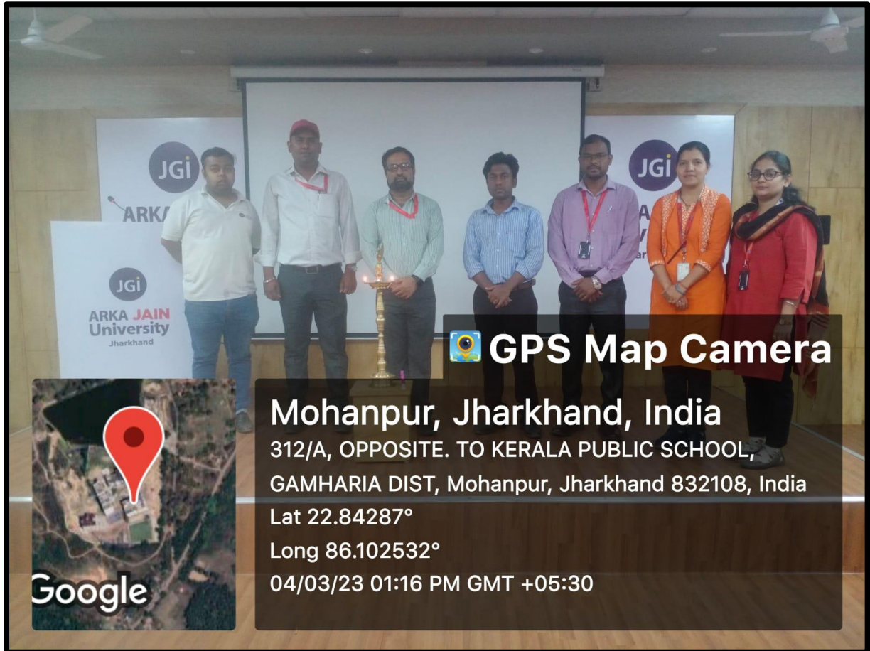
Figure 2: Lamp Lighting on National Safety Day