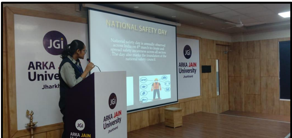
Figure 7: Student presenting on topic of National Safety Day