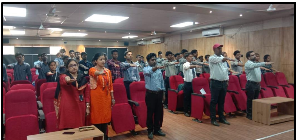
Figure 3: Pledge on National Safety Day