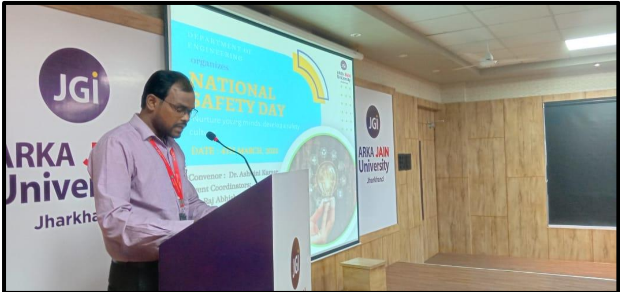
Figure 6: Speaker Lecture on National Safety Day