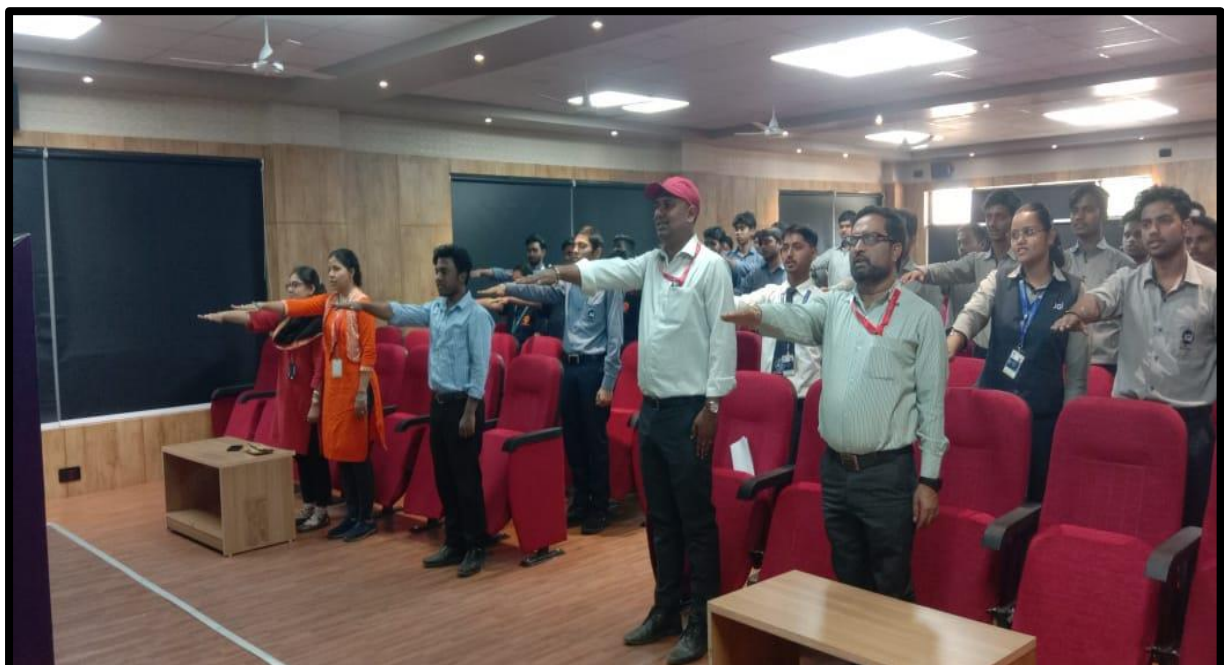
Figure 5: Pledge on National Safety Day