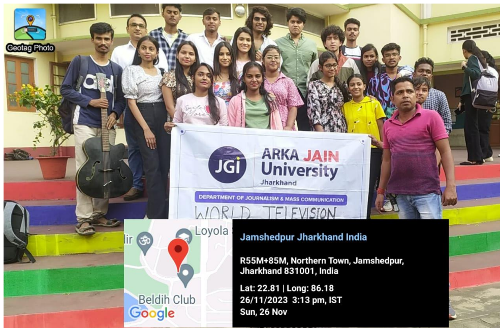
Figure 4: Students with actors of web series and professionals of BBC Studios India banner (Mumbai).