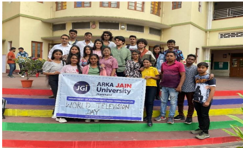
Figure 1: Students during the shooting of web series under BBC Studios India banner (Mumbai).