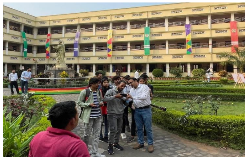
Figure 3: Students getting brief on different phases of television production