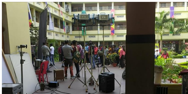
Figure 2: Students getting hands-on experience on Television Production