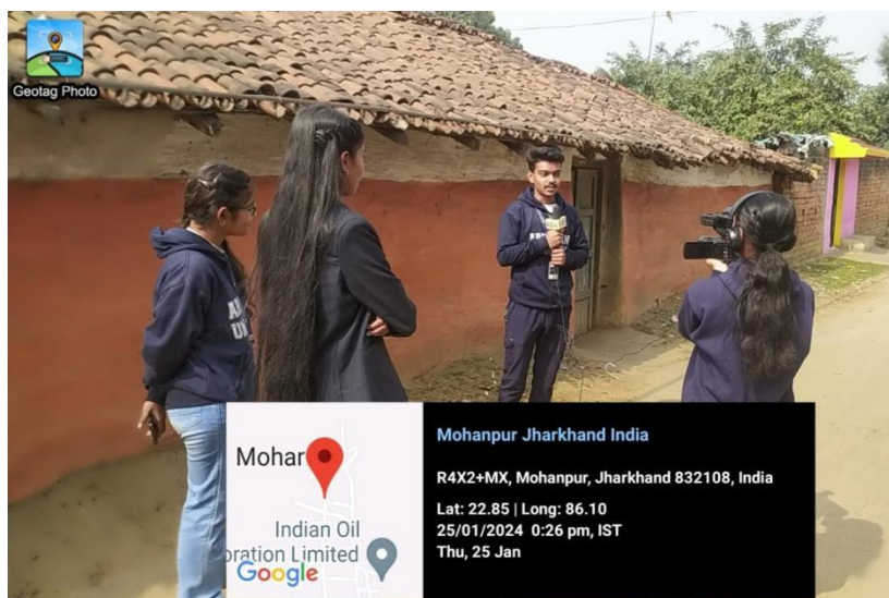
Figure 6: Students while doing reporting at Mohanpur village on National Voters day