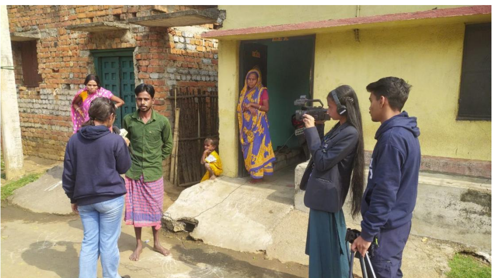
Figure 4: Students while making rural people aware about National Voters Day