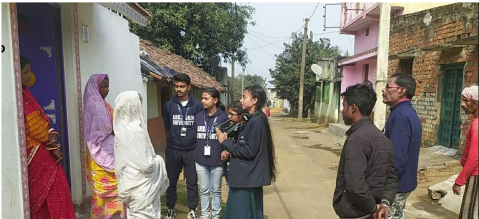
Figure 3: Student while spreading awareness among rural people on voting