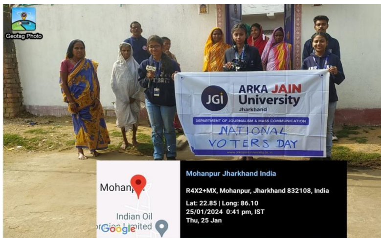
Figure 5: Students at Mohanpur village while observing National Voters Day