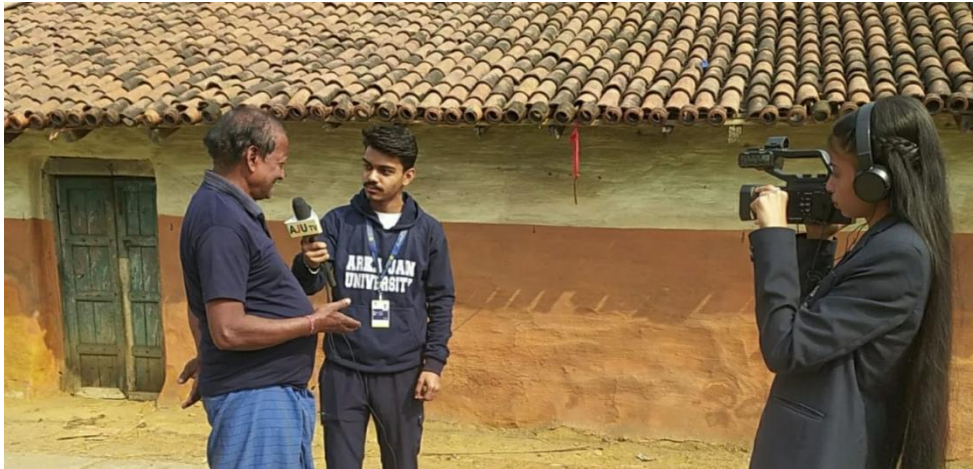
Figure 2: Student taking views of a rural people on the right to vote