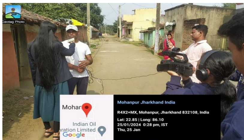
Figure 7: Students during National Voters Day awareness campaign at Mohanpur village.