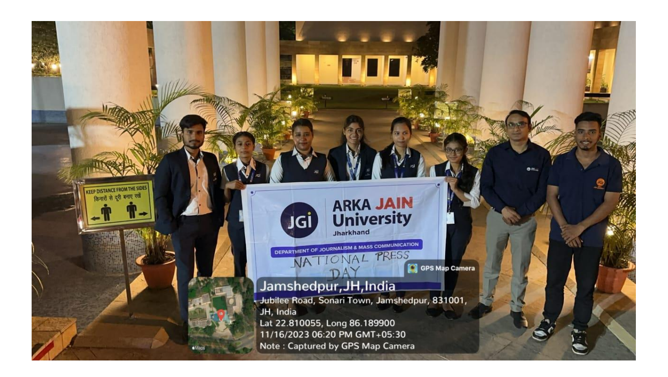
Figure 3: Students at Centre for Excellence, Jamshedpur for attending Seminar on National Press Day