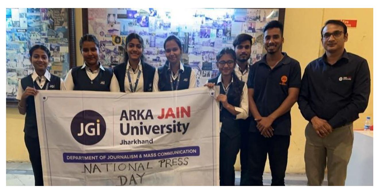
Figure 1: Students during seminar on National Press Day