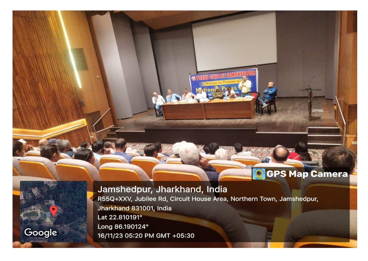
Figure 4: Students attentively listening to the expert speakers during the seminar on National Press Day