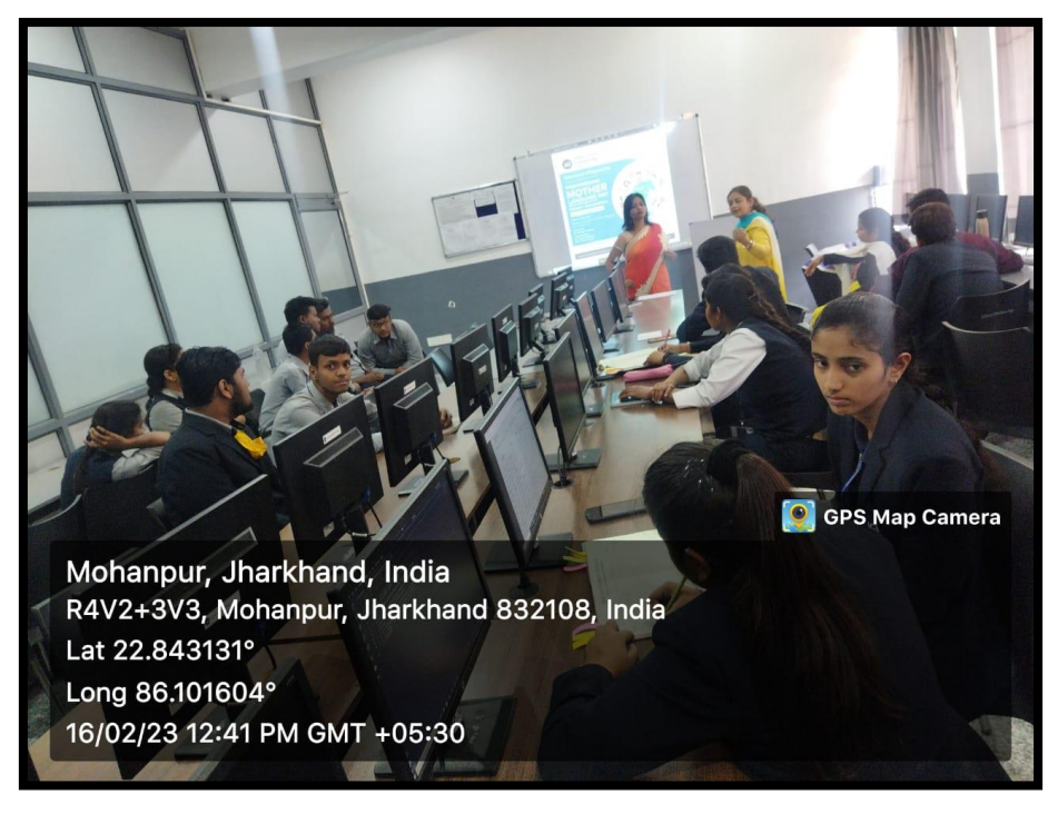
Figure 2: Geo Tag Photo of the Debate Competition