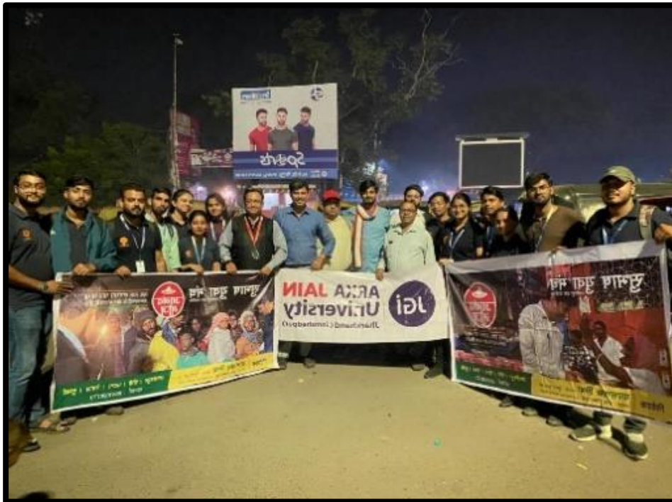
Figure 4: Group Photo