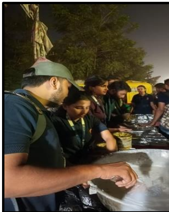
Figure 5: Giving food to the needy