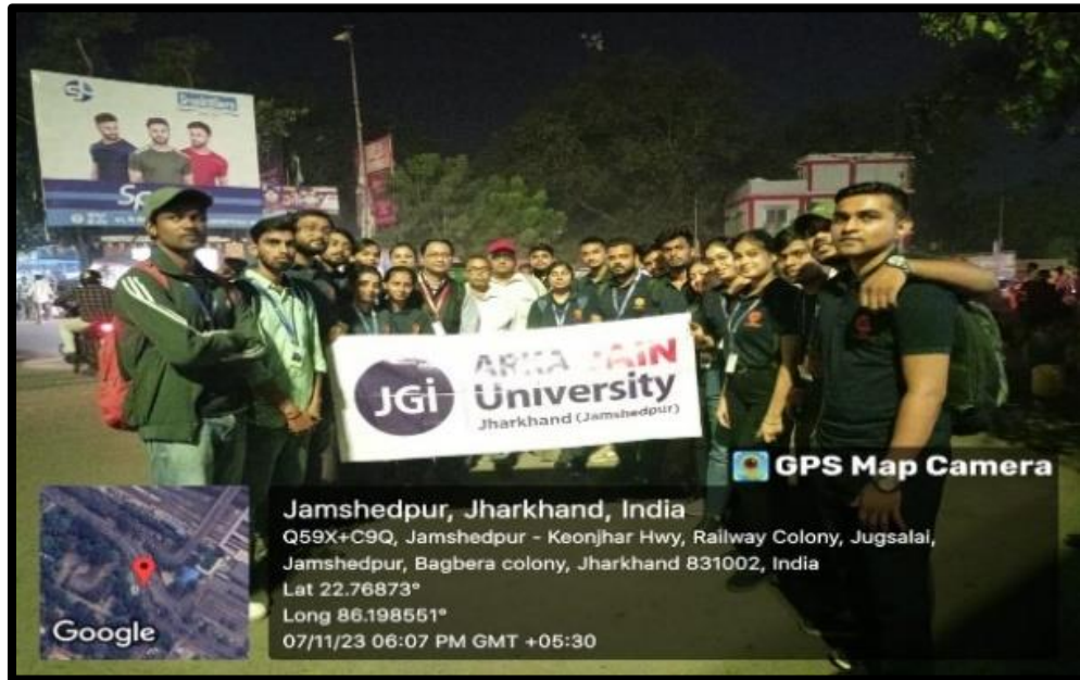
Figure 2: Geo Tag Photo