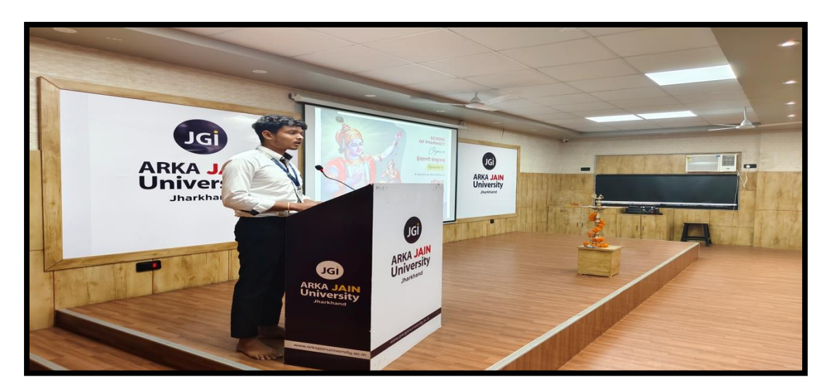
Figure 4: Students recite the verses of the Bhagawat Geeta, Episode 3, illuminating the path of Karma Yoga