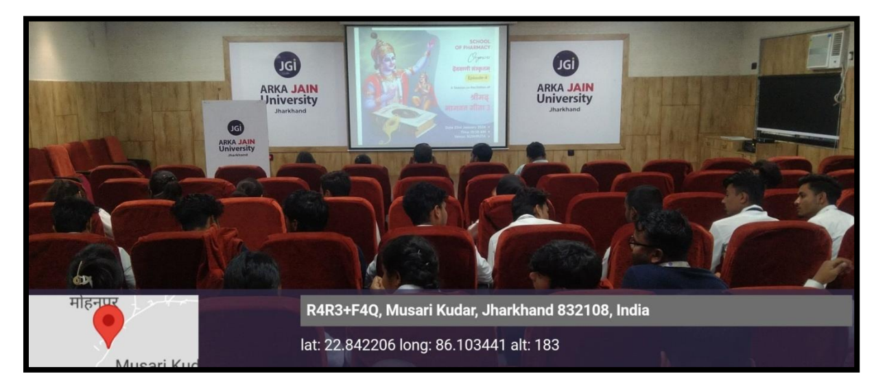
Figure 3: As the echoes of their recitations fill the air, students immerse themselves in the profound wisdom of the Bhagawat Geeta