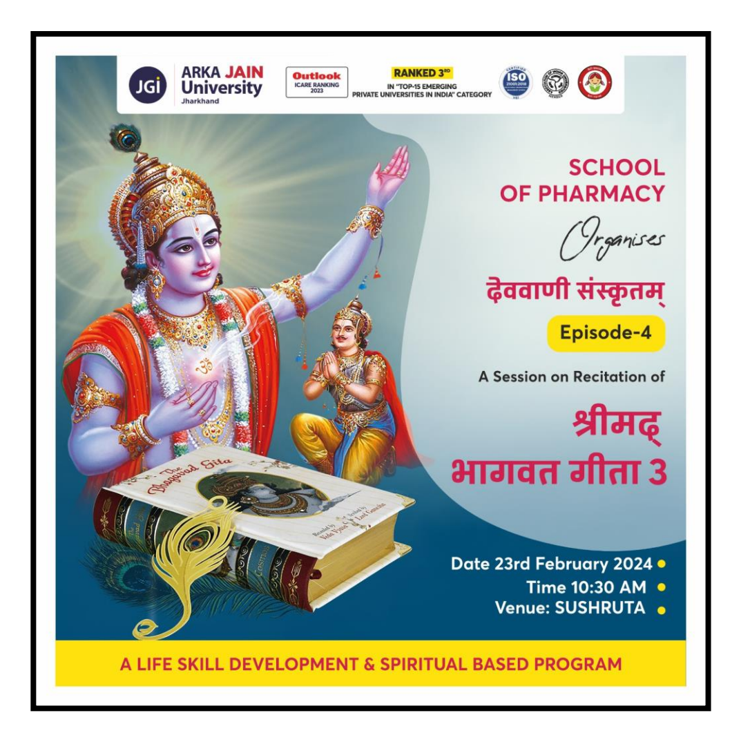
Figure 1: Poster of the Dev Vani Sanskritam Episode 4