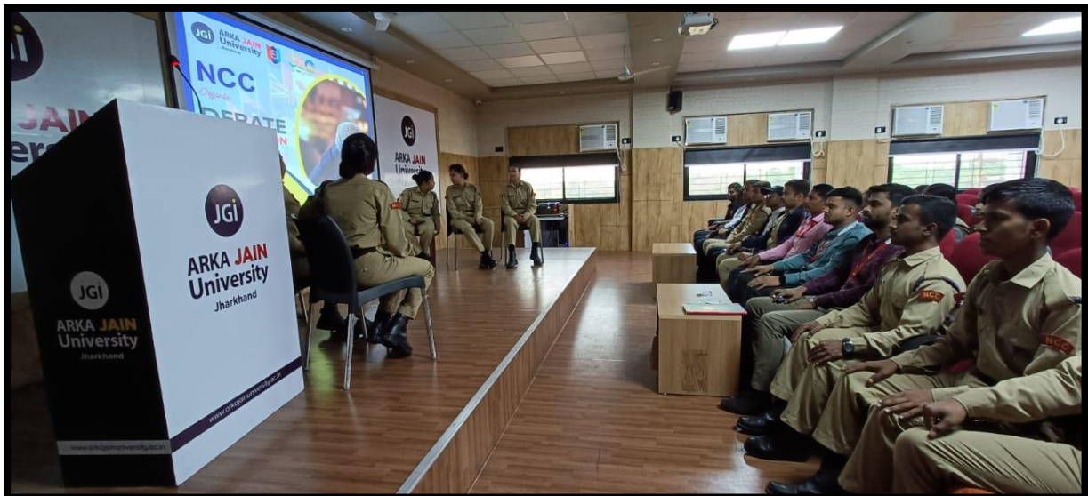
Figure 3: NCC cadets and all dignitaries enjoying debate competition.