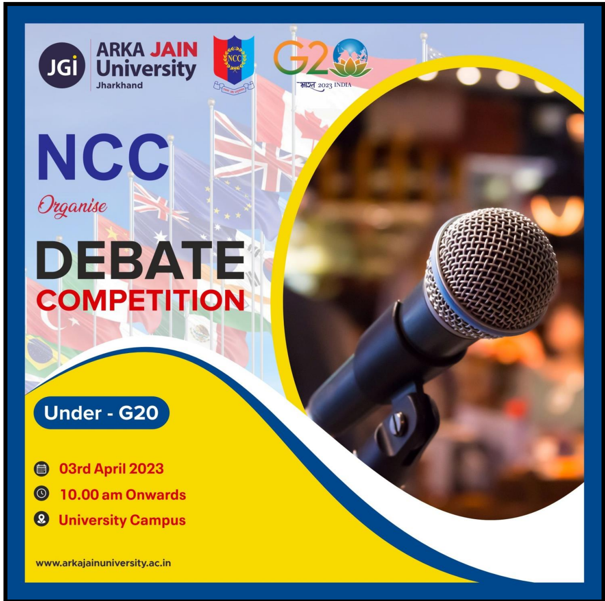
Figure 1: Poster of Debate Competition