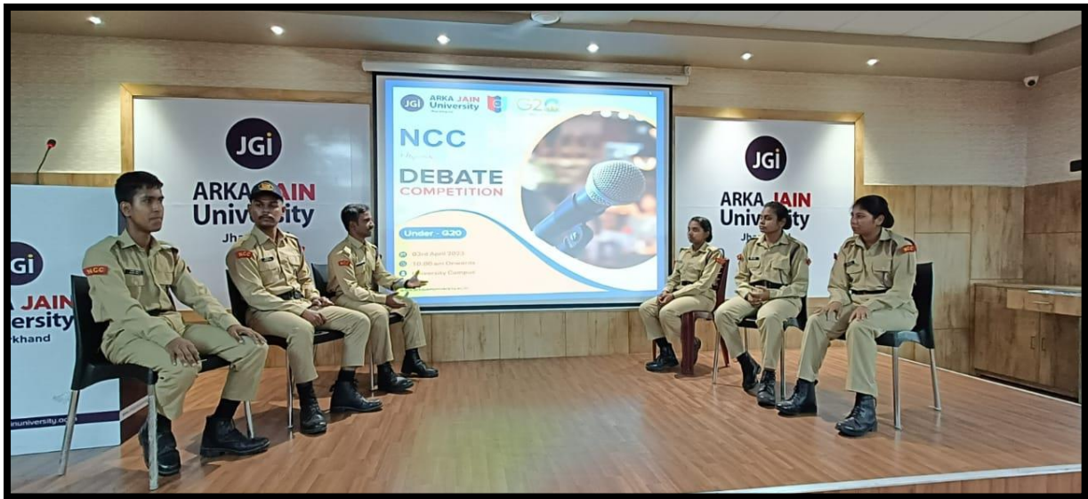
Figure 2: Debate Competition going on