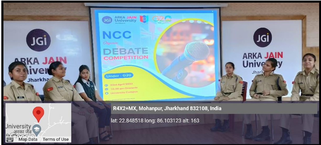
Figure 4: Geo Tag Photo