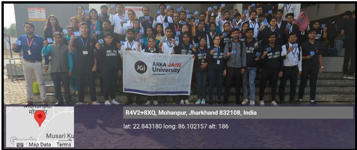
Figure 2: Students and faculty assemble to celebrate Constitution Day with the powerful message:" राह दिखाना बेशक महत्वपूर्ण है। इससे भी महत्वपूर्ण है नियमों का पालन करना। आईये इस संविधान दिवस पर हम सब मिलकर शपथ लें "रास्ते के नियमों का अवश्य पालन करें" "