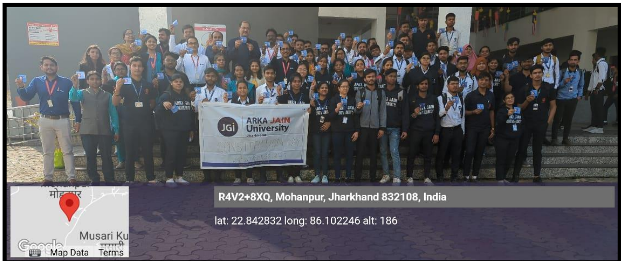
Figure 3: United in purpose, students and faculty come together to commemorate Constitution Day