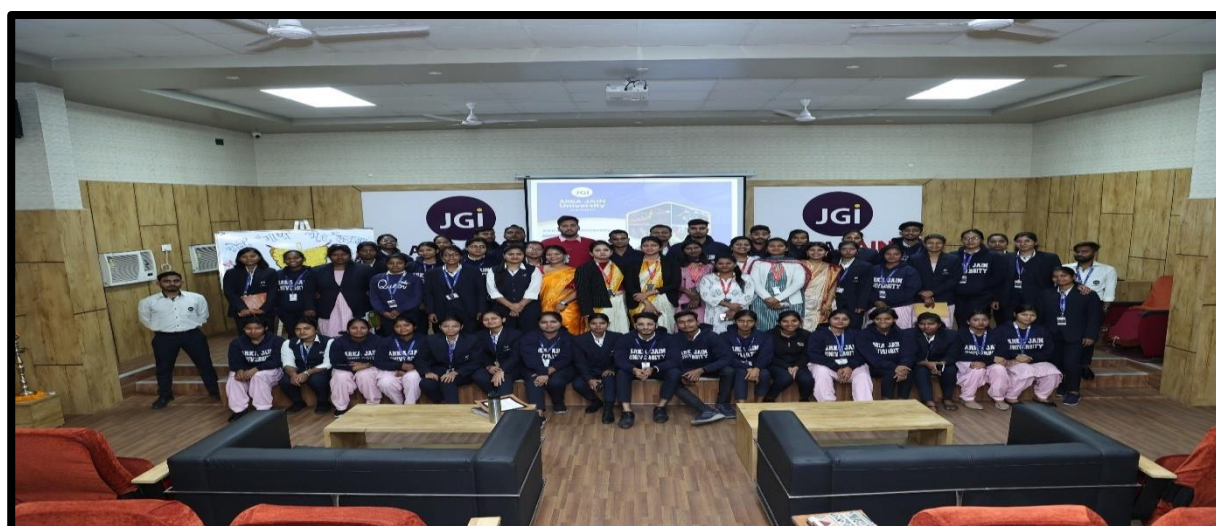
Figure 7: Group snap of BHARATIYA BHASA UTSAV