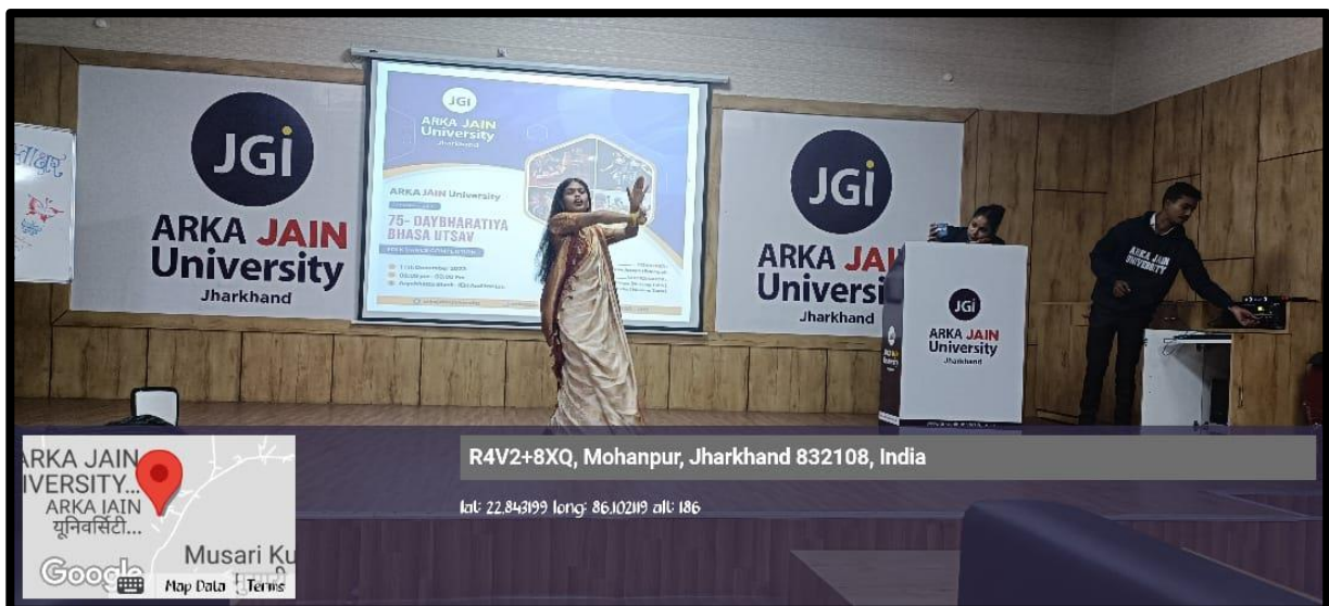
Figure 3: Folk Dance performed by Nursing Student