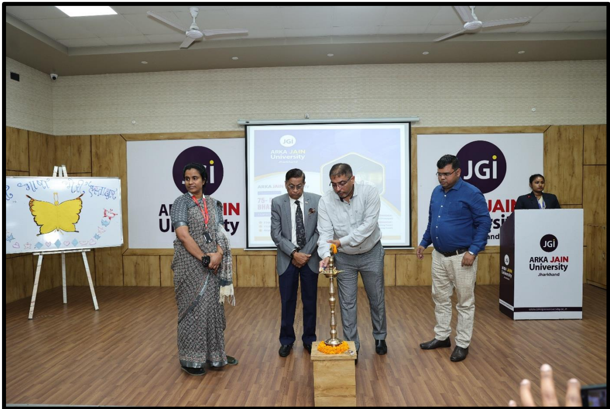
Figure 2: Inaugural of Bharatiya Bhasa Utsav