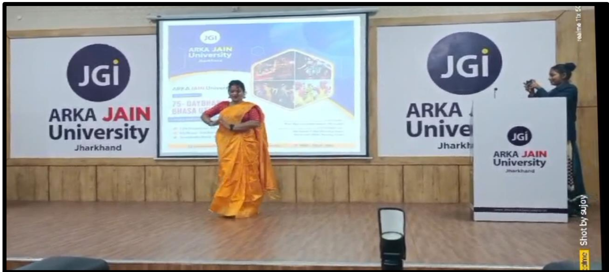
Figure 4: Folk Dance performed by Nursing Student