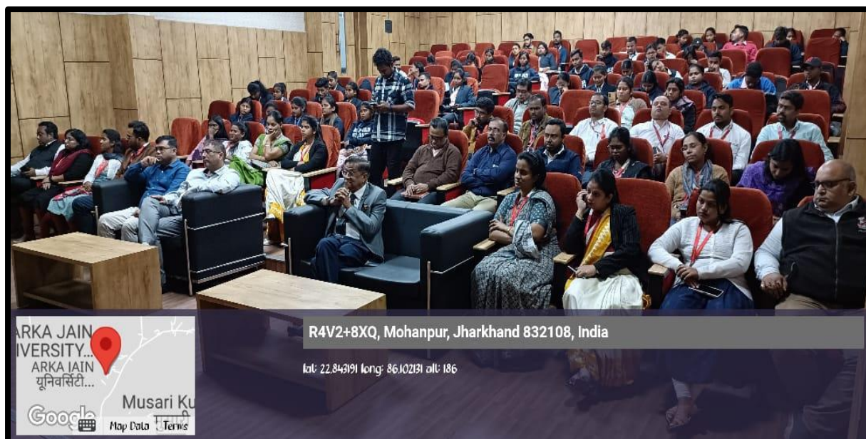
Figure 6: Group snap of BHARATIYA BHASA UTSAV