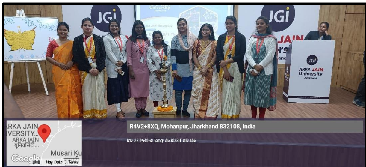
Figure 5: Group Snap of BHARATIYA BHASA UTSAV