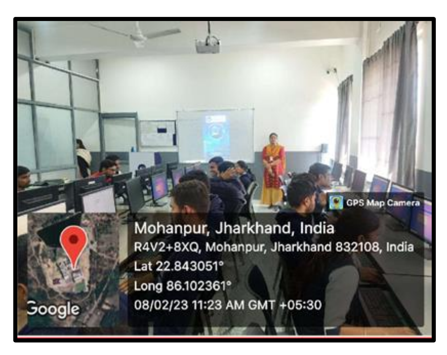
Figure 2: Students during the Event with co-ordinator