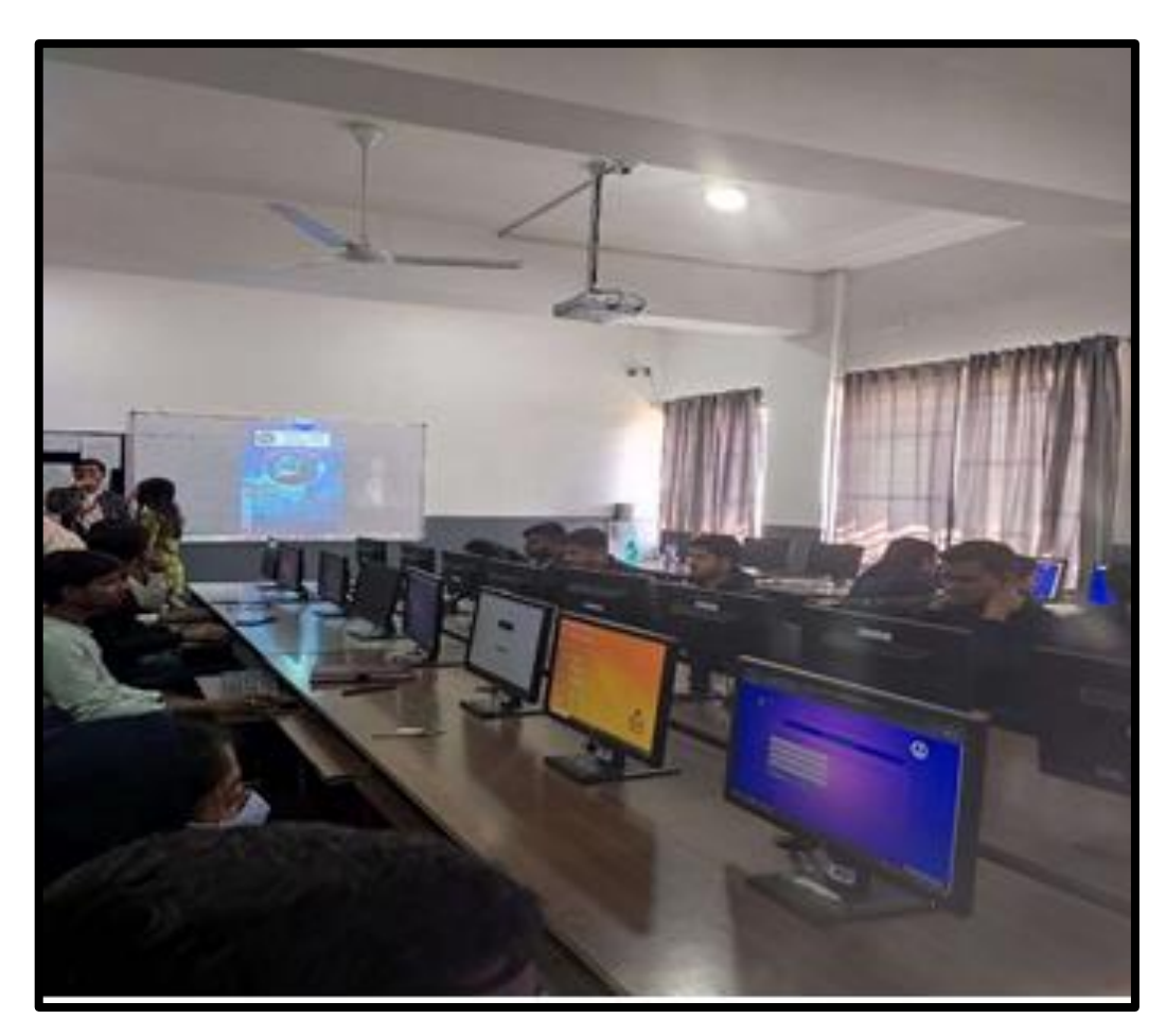
Figure 4: Participant with student's co-ordinators