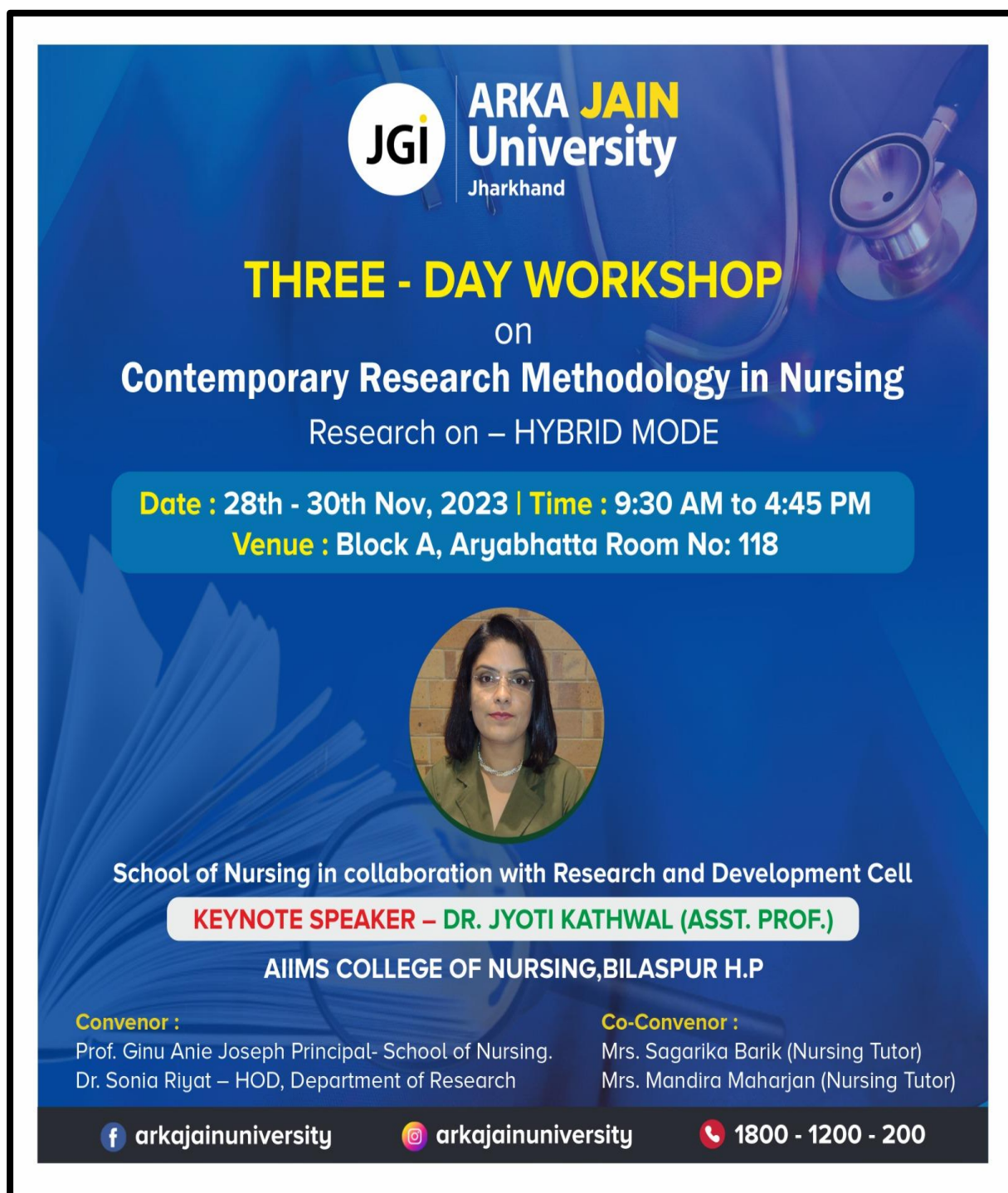
Figure 1: Poster of the Contemporary Research Methodology in Nursing Research