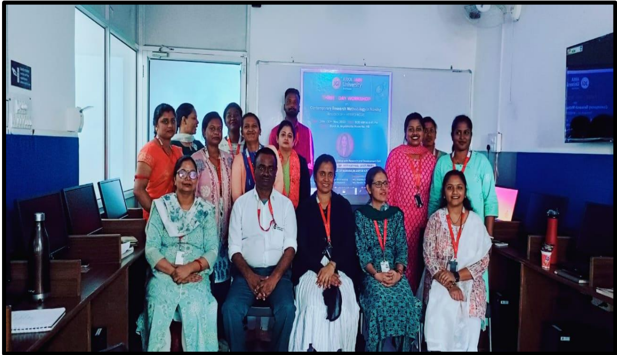
Figure 8: group photo of the workshop