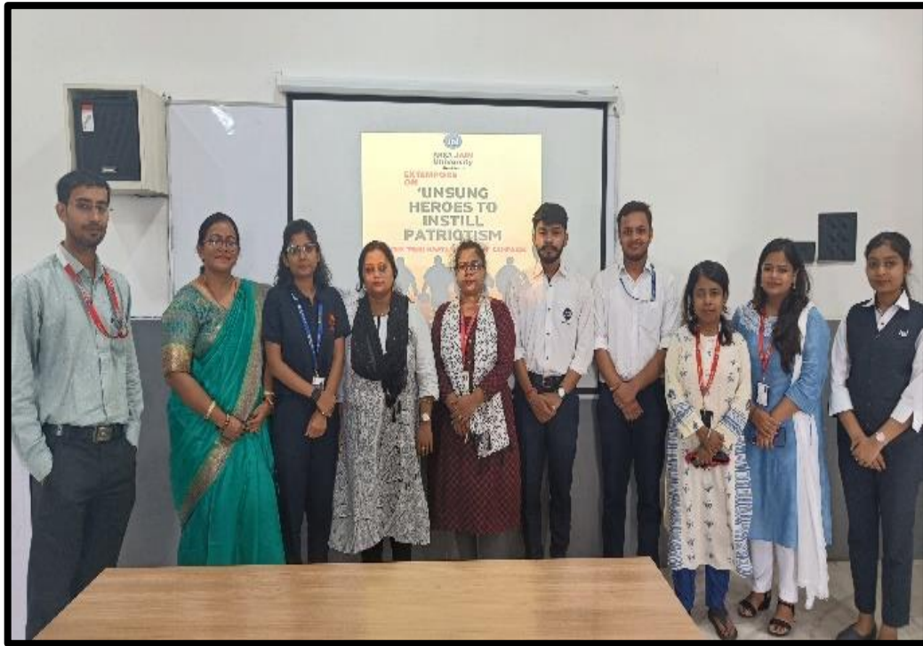
Figure 2: Judges along with the participants