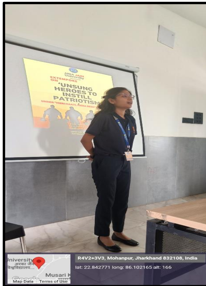
Figure 4: Patriotism from the perspective of young minds