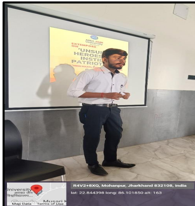
Figure 3: The student conveying his thought of patriotism