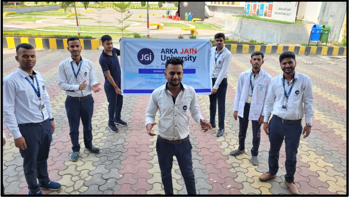
Dharti Kare pukar