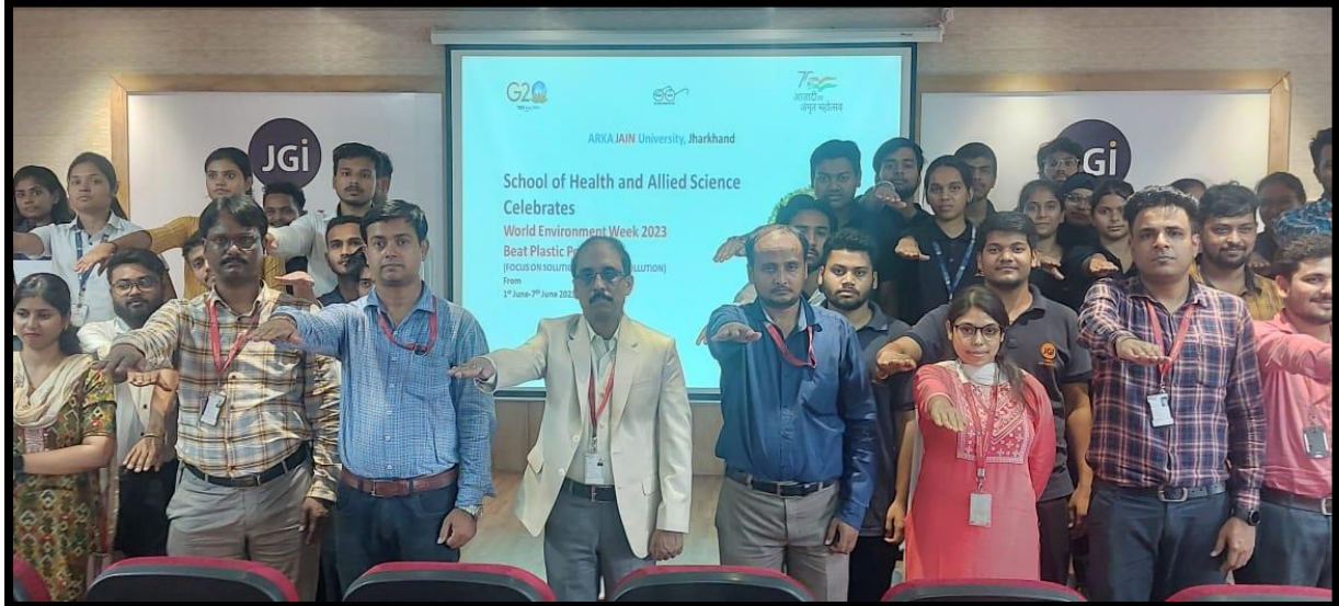
LiFE Pledge by the students and employees of the University