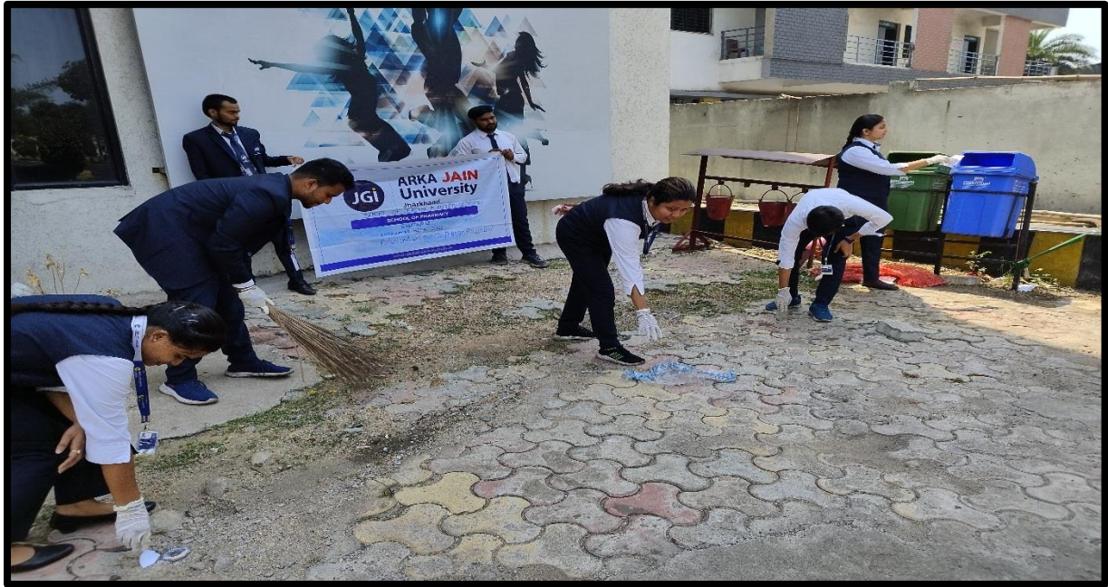
Plastic free campus an effort by the students