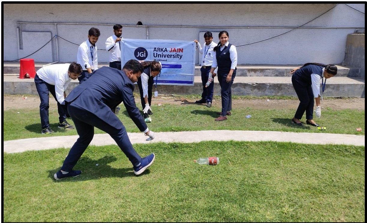
Against mindless and destructive consumption