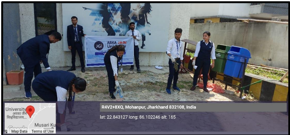
Jio Tag Photo