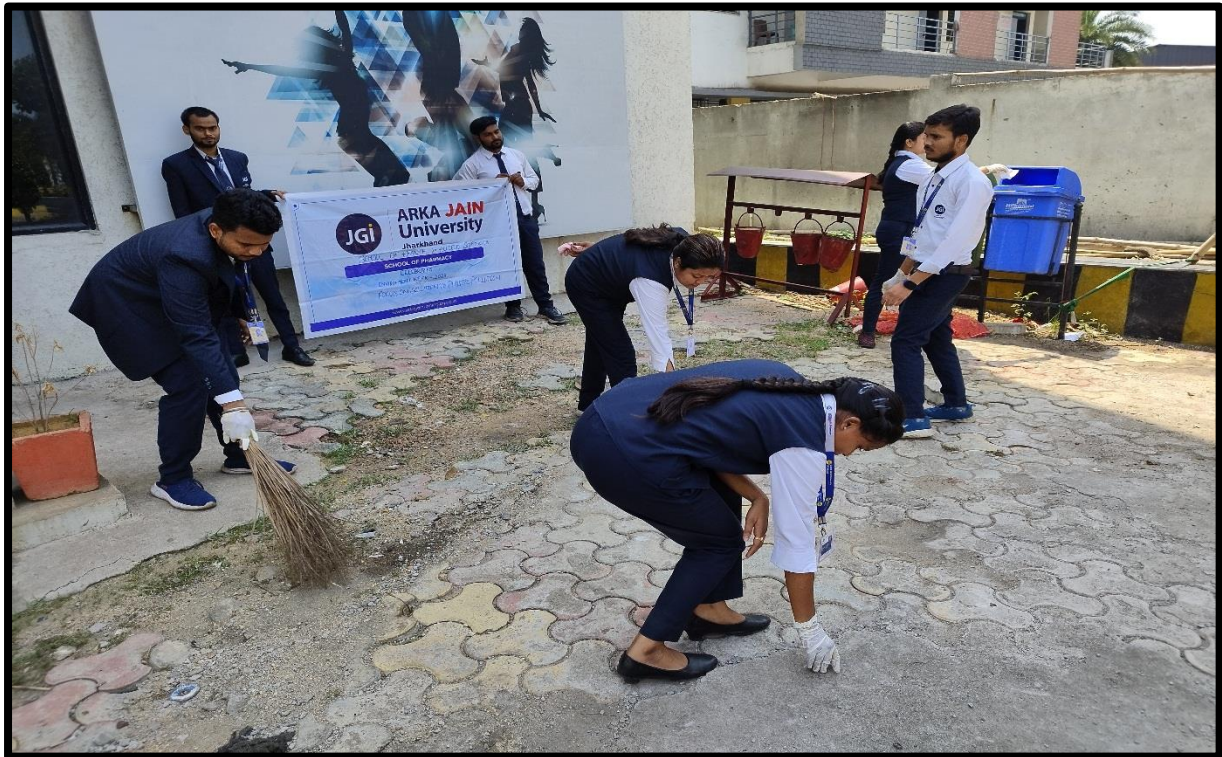
Campus cleaning: Beat Plastic Pollution