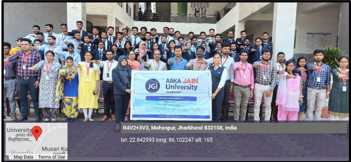
Jio Tag Photo