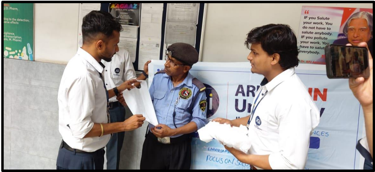
Distributing cotton bags