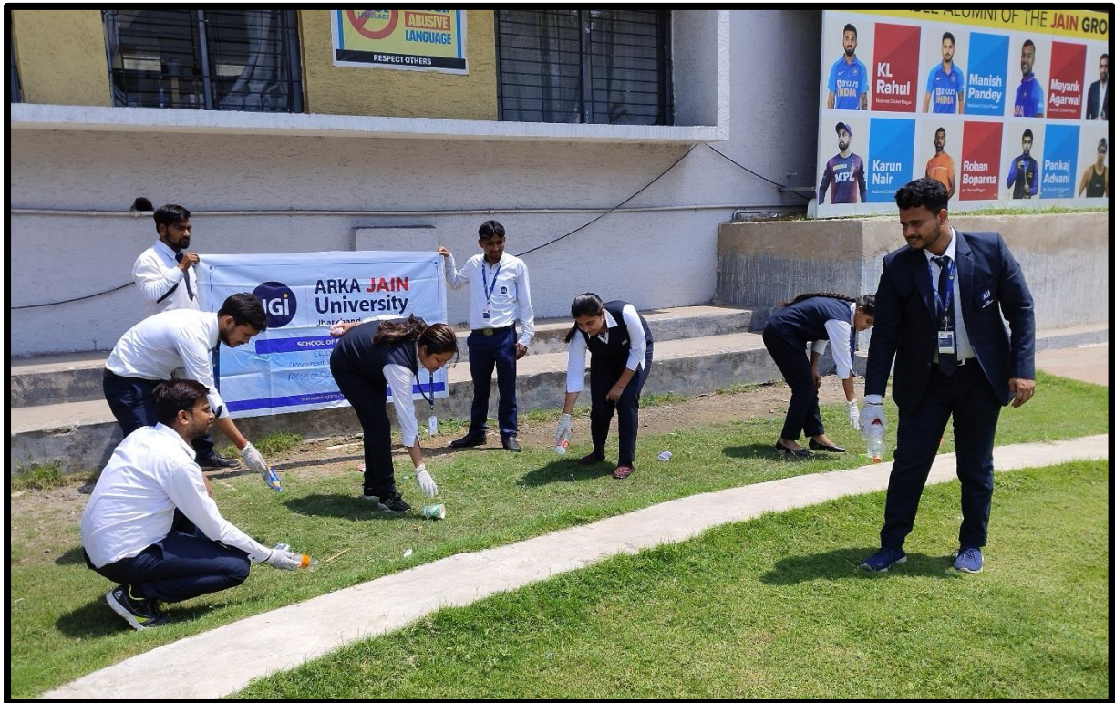
We need a plastic free campus