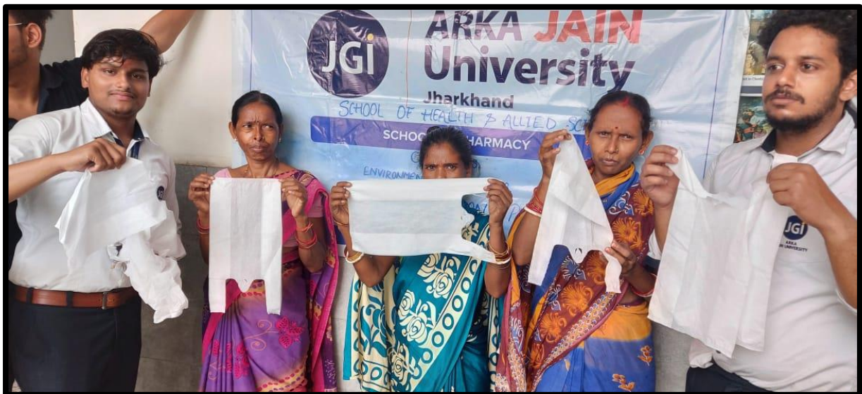
Try to avoid plastic use cotton bags