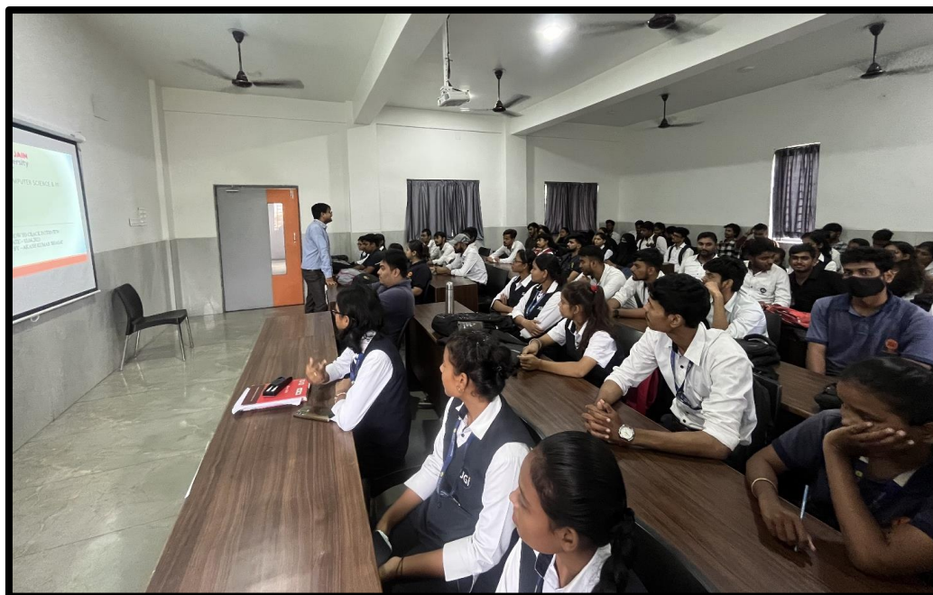
Figure 4: Photo of the Webinar on how to Crack an Interview