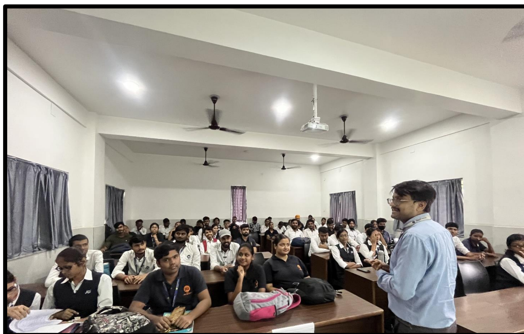
Figure 3: Photo of the Webinar on how to Crack an Interview