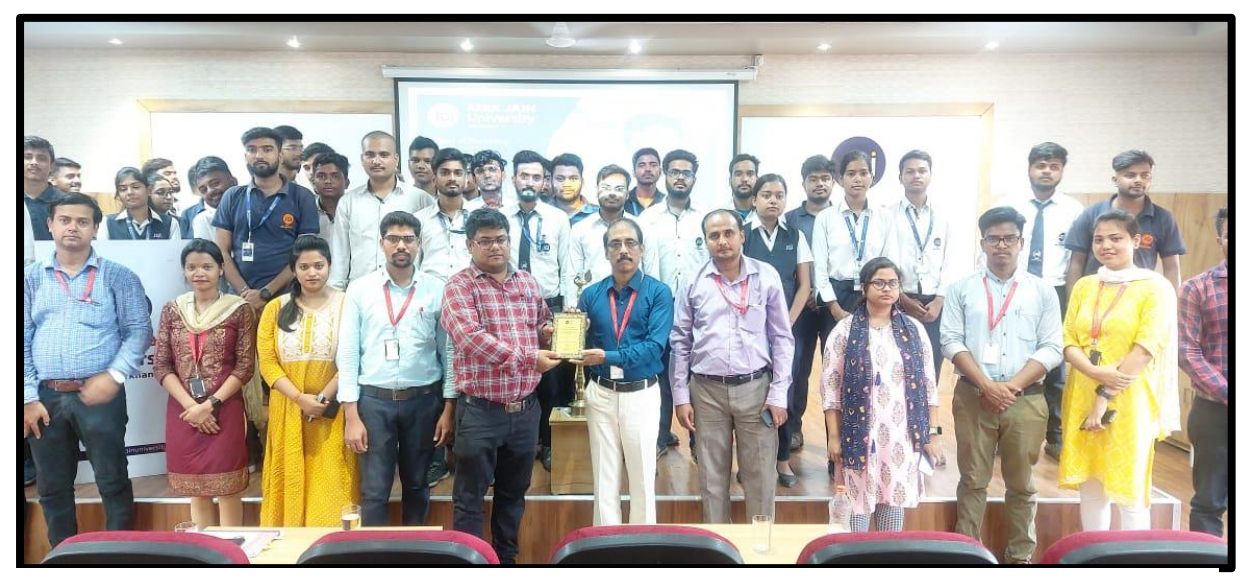
All united at the end of the seminar to witness their presence