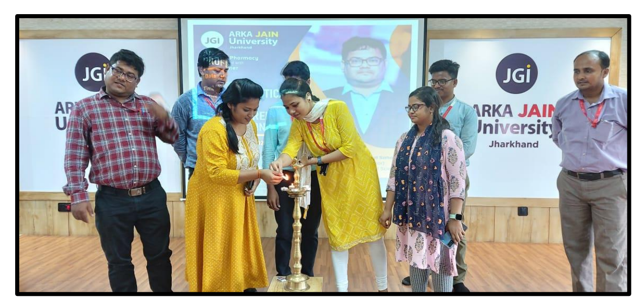
Spiritual inauguration of the seminar