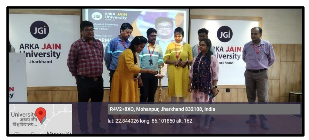
Geo Tag photos of seminar 3Rs in animal testing