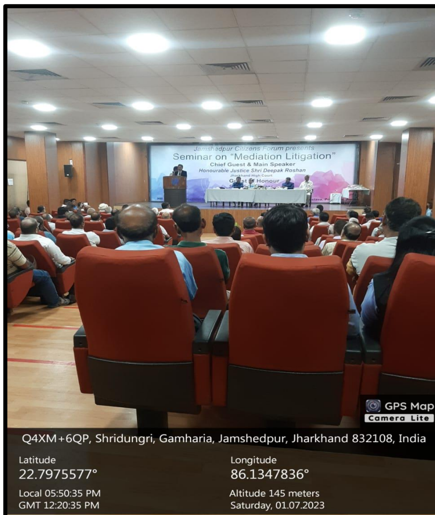
Figure 2: The Speaker enlightening his knowledge among others