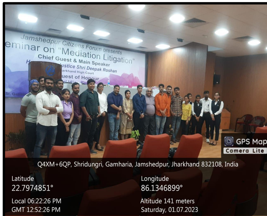
Figure 4: The whole team of MBA students and Faculty