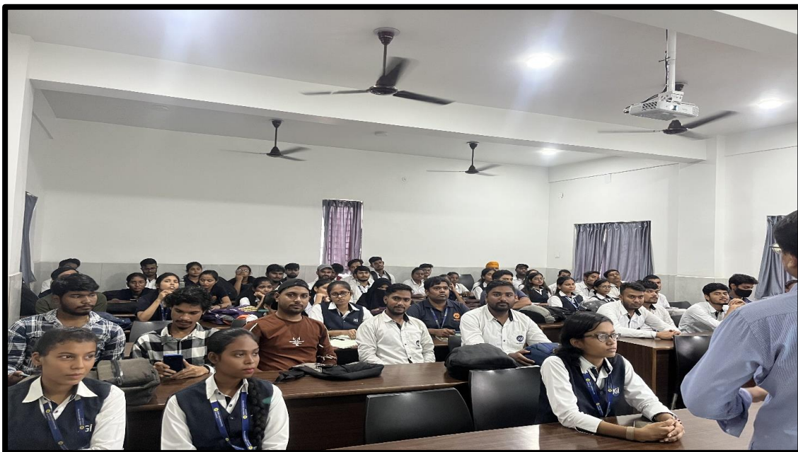
Figure 3: Students paying attention towards speaker