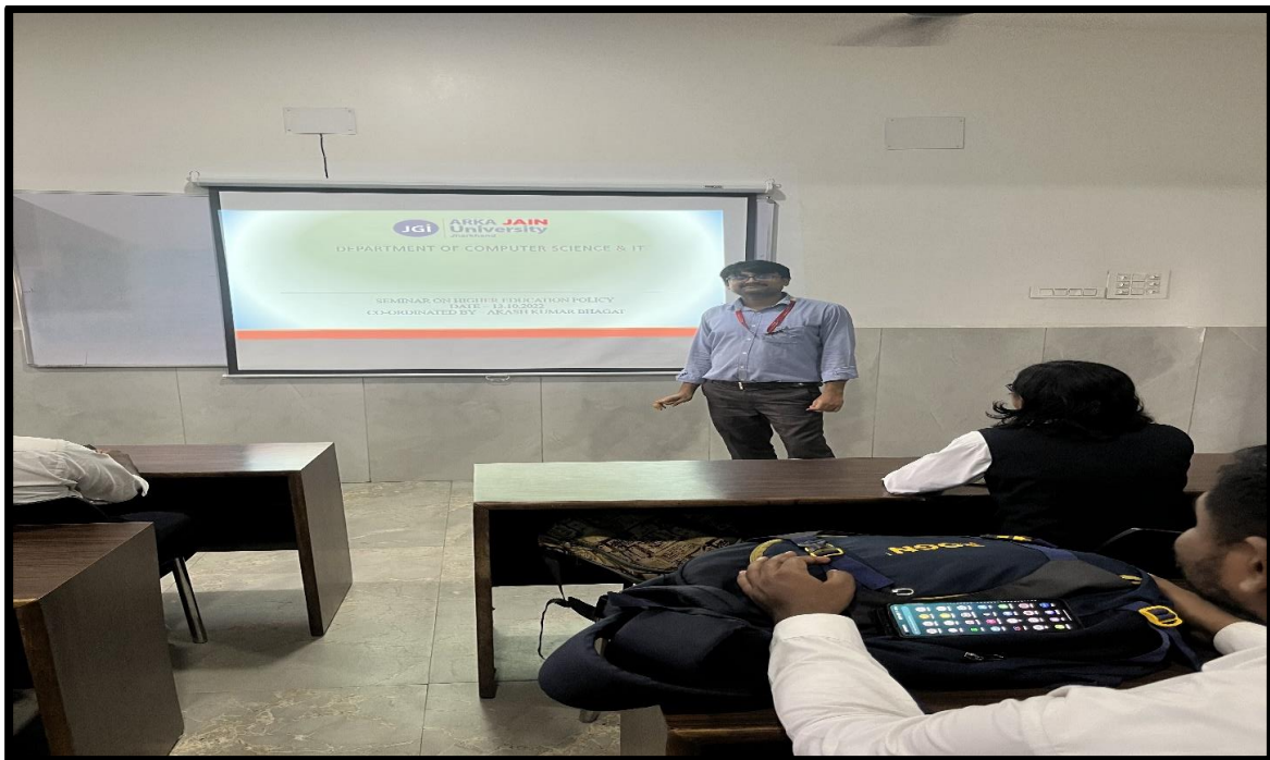
Figure 2: Photo of the Seminar on Higher Education Policy