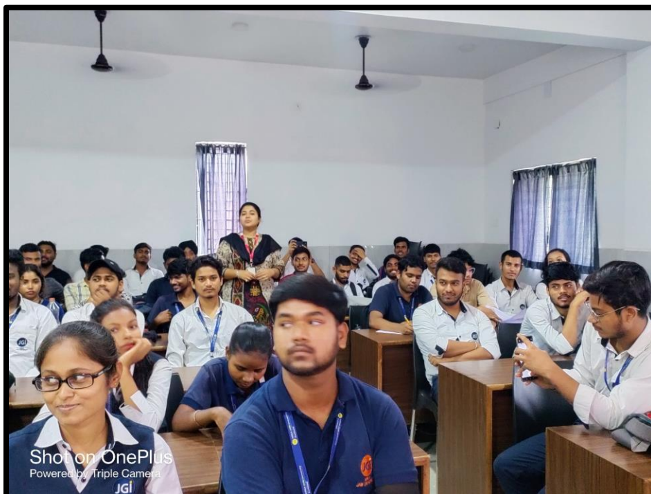
Figure 3: Students paying attention towards the speaker