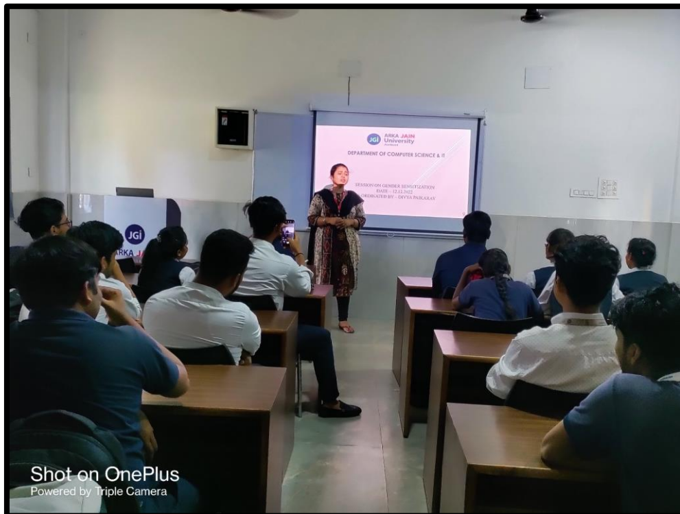
Figure 2: Photo of the Seminar on Gender Sensitization