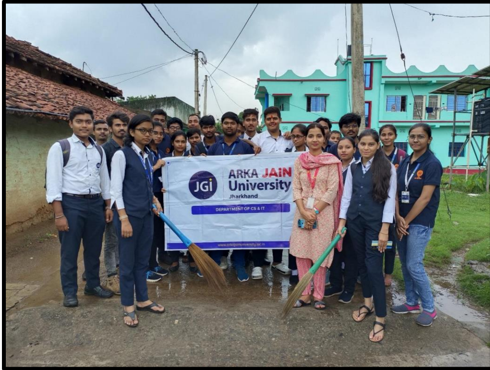
Figure 4: All Participants in one frame