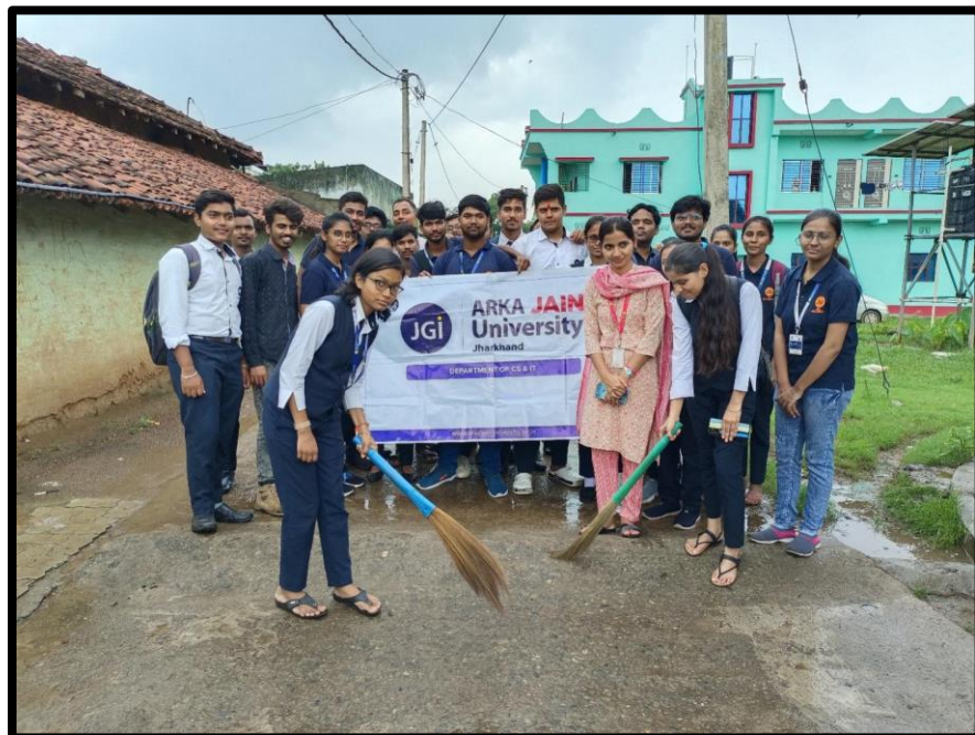
Figure 3: Photo of the Extension activity on Swachta Abhiyan