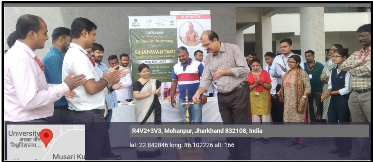
Inauguration of Expo Dhanwantari