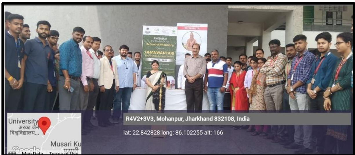
Dhanwantari an Expo of Herbal Aushadhis