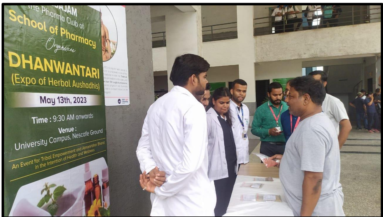
Interaction with students