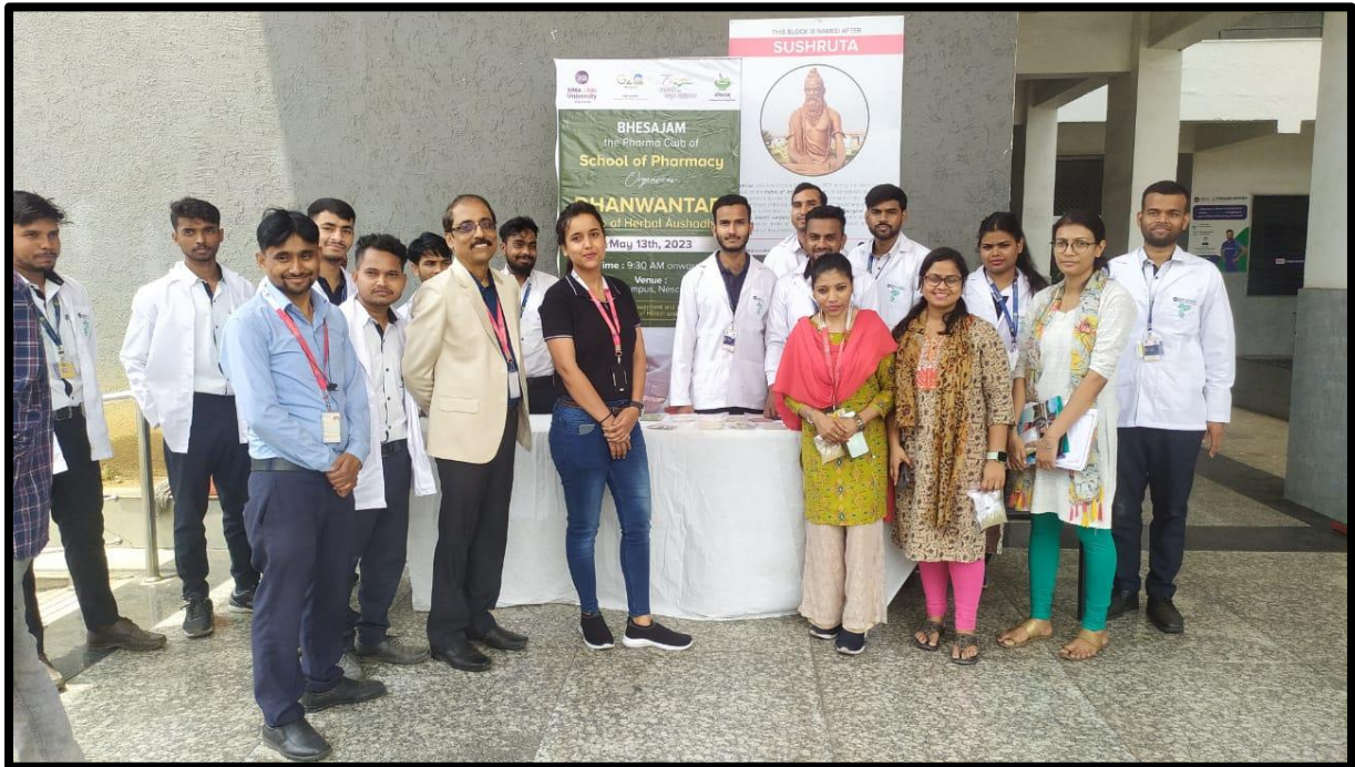
A friendly environment