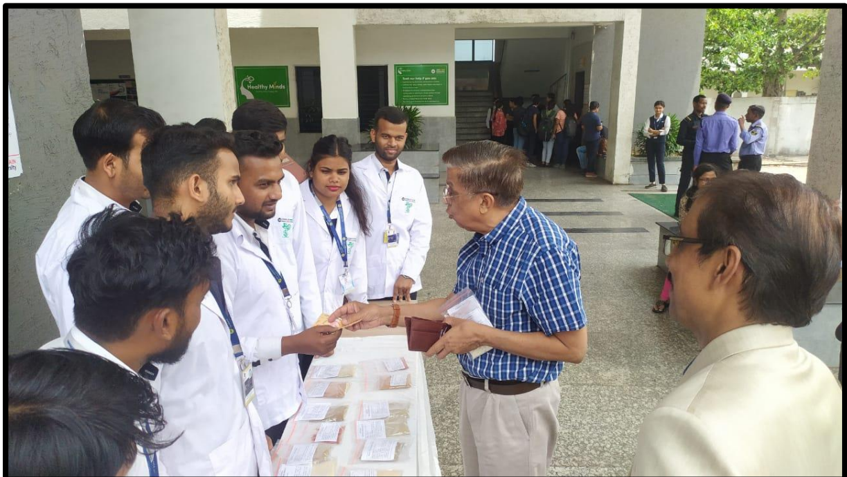
Sir! We always need your blessings