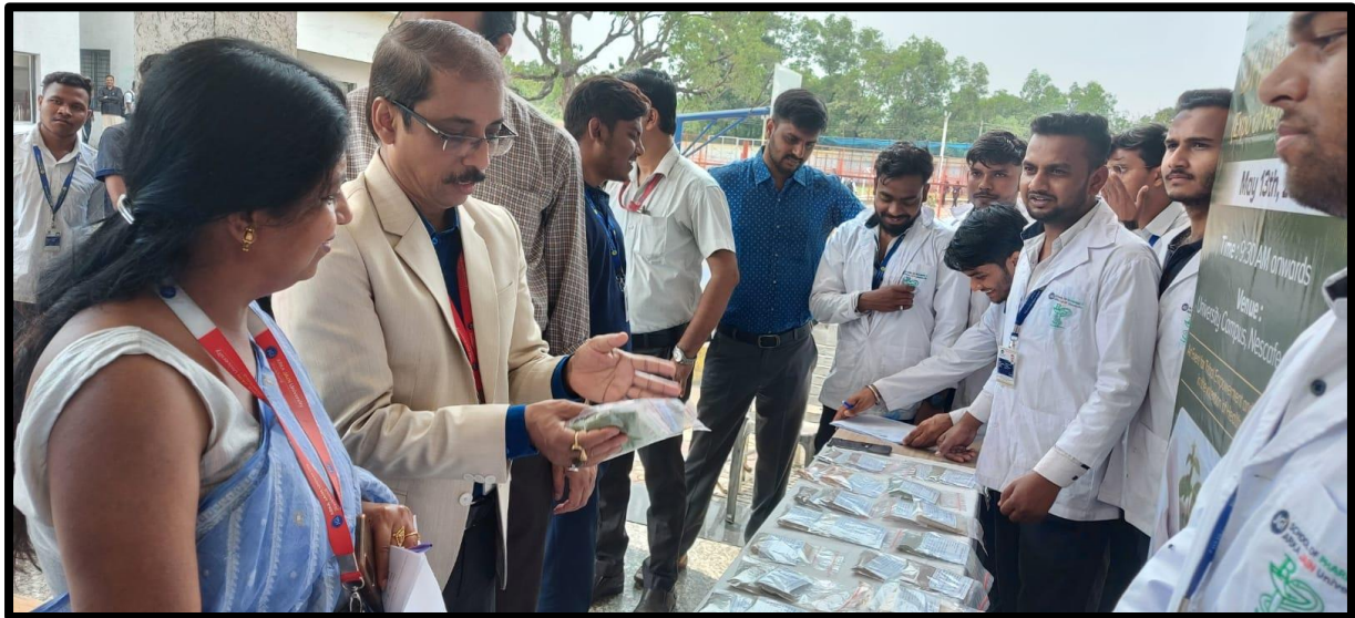
Educating students how to detailing a product