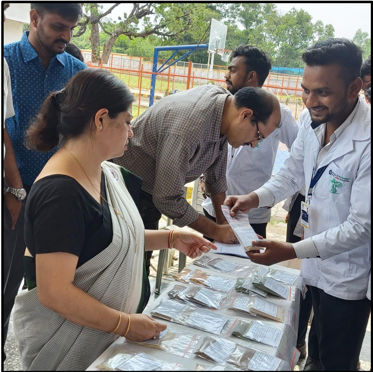
Student detailing about the product