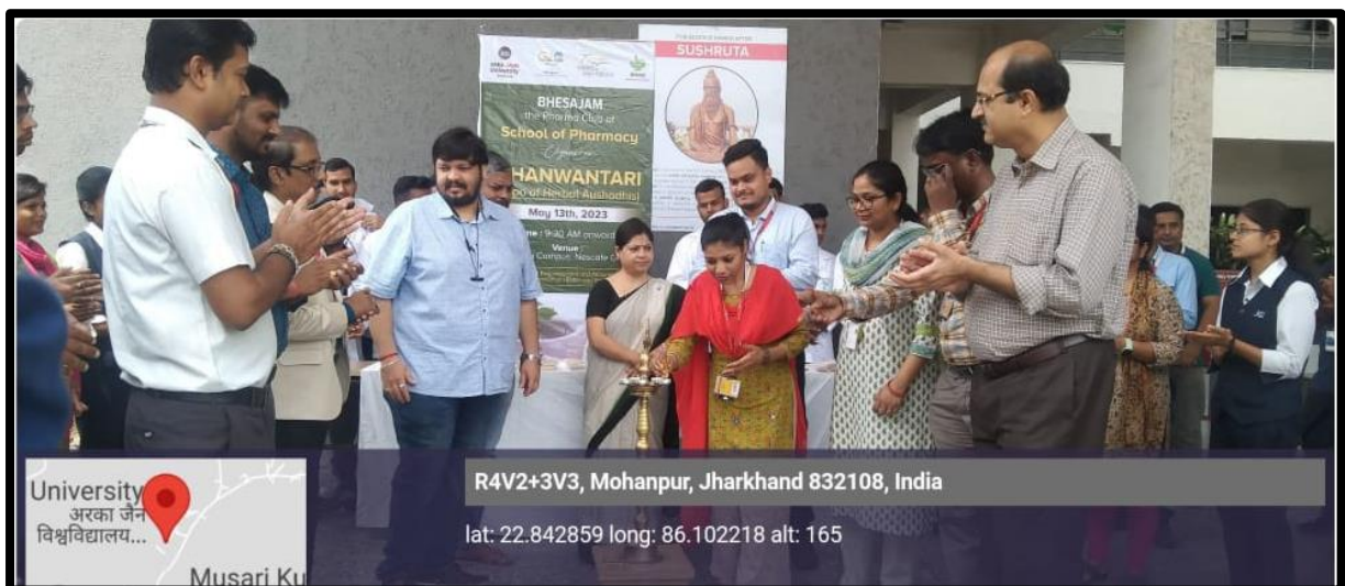
Rush at Expo Dhanwantari