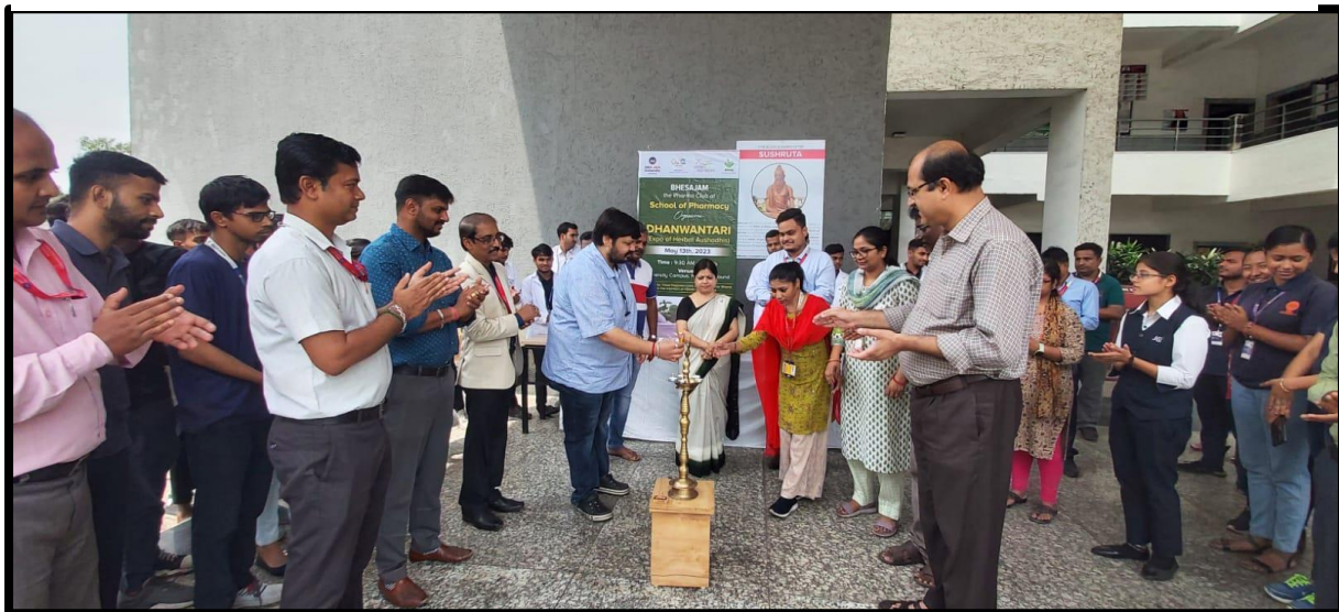
Atithi Devo Bhaba