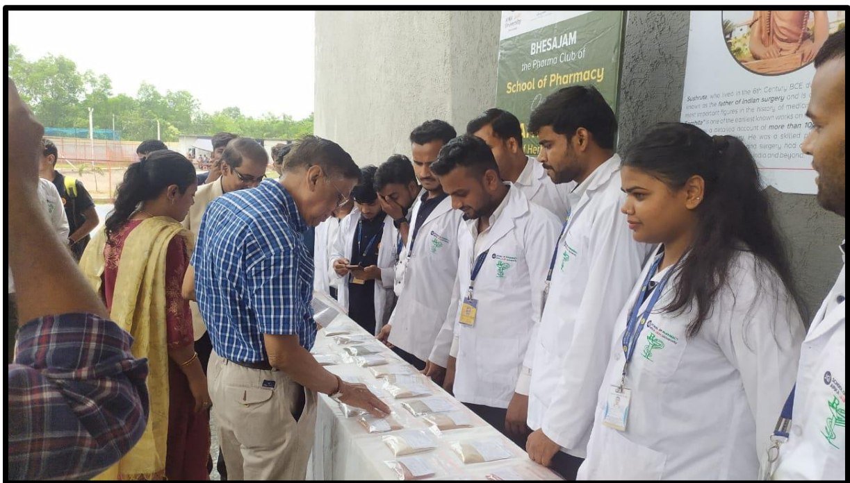
Keen observation by Honorable Vice Chancellor Sir