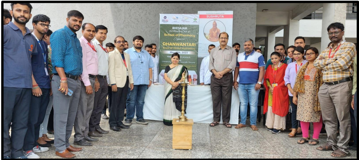
Preparing for the inauguration of Expo Dhanwantari