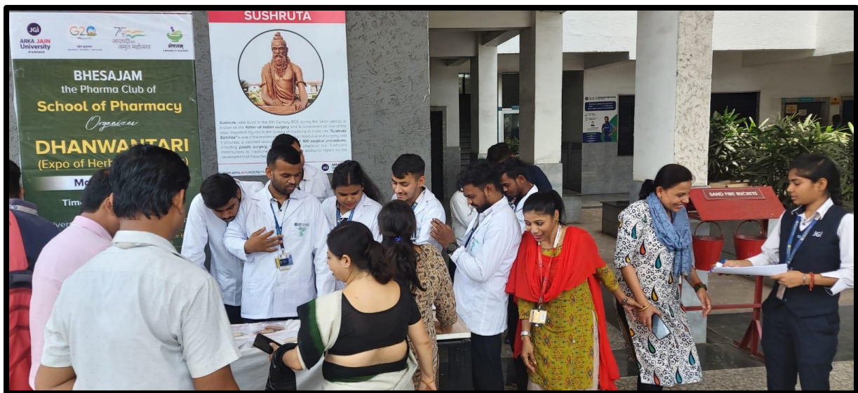
Small but a real environment of expo