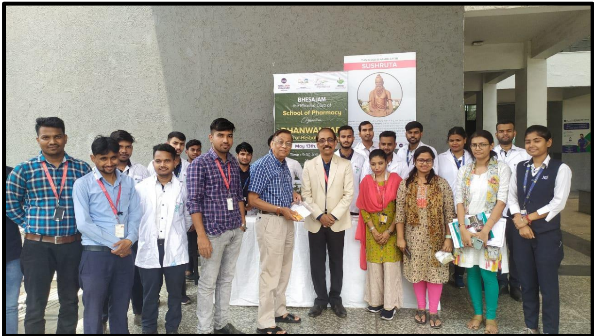
Encouragement by Honorable Vice Chancellor Sir