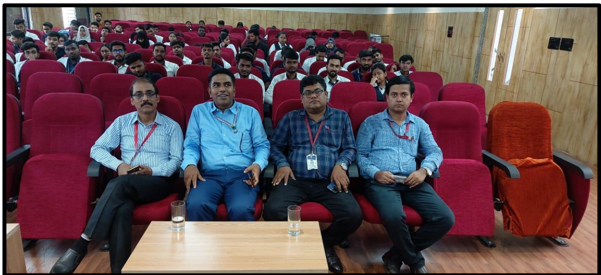
Participants gathering before seminar starts