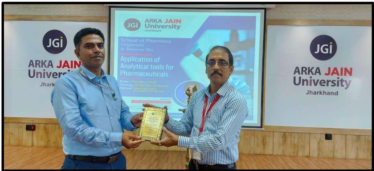
Felicitating to the speaker of the seminar