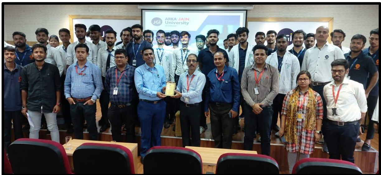
All under one frame