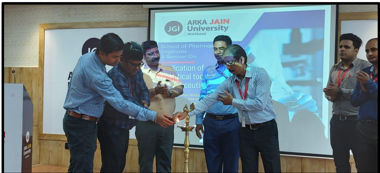
Kindling of light to inaugurate the seminar