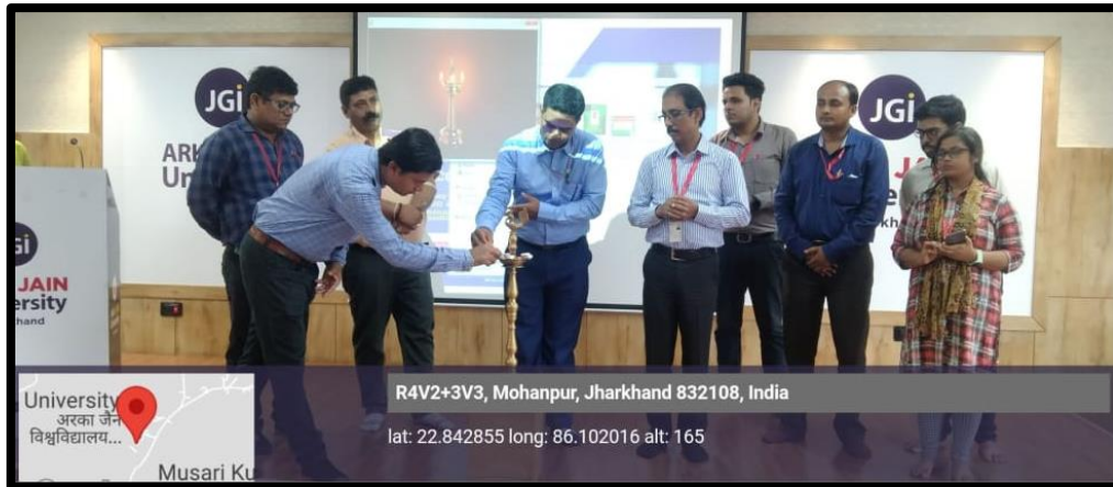
Geo Tag photos of seminar Application of Analytical tools for Pharmaceuticals