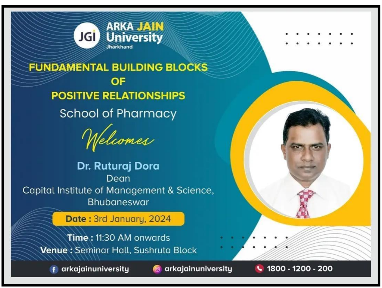
Figure 1: Poster of Fundamental Building Blocks of Positive Relationships