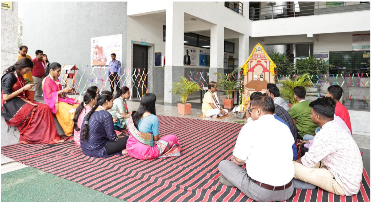
Praying "Tera tujhko arpan kya lage mera"