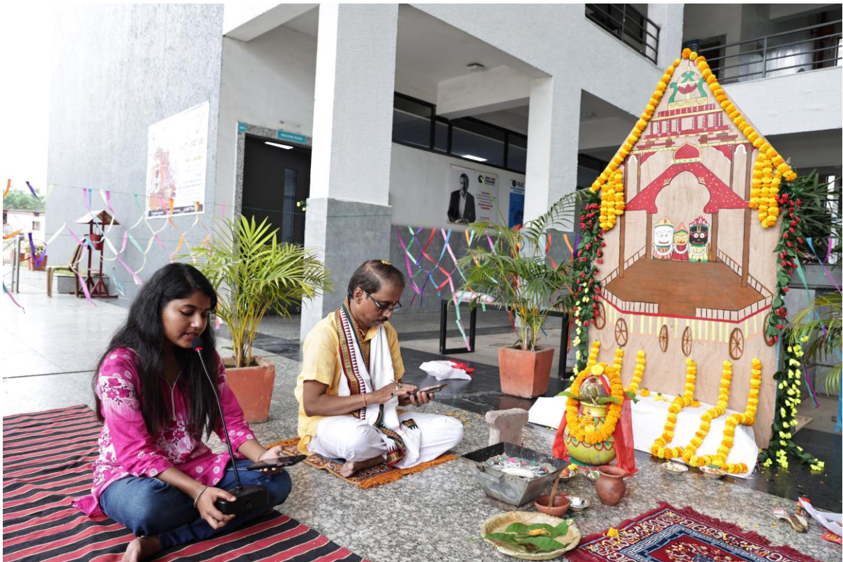
Bhajan Suprabhatam presented before Lord Jagannath