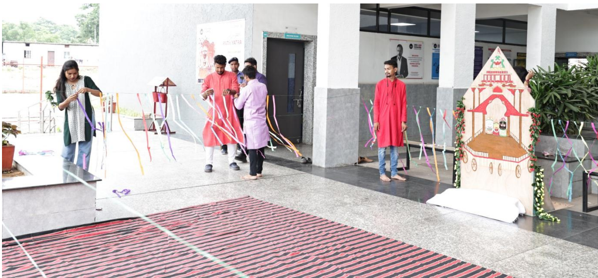
Students engaged in decoration of the puja pandal