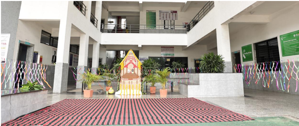
The God of the Universe Lord Jagannath on the Chariot ready for Holy Yatra