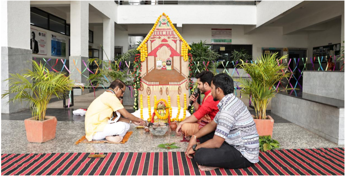
Awahan na janami naiba janmi pujan