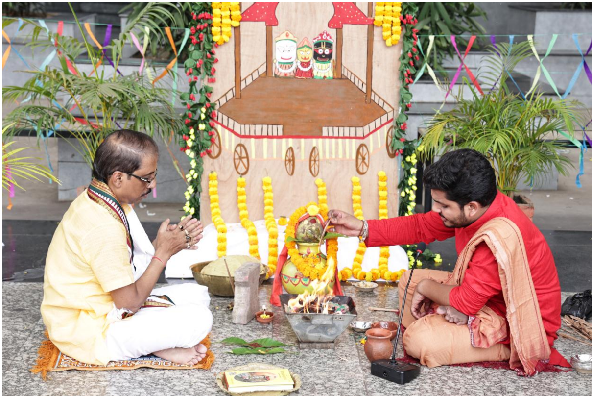
Hawan before Lord of the Universe