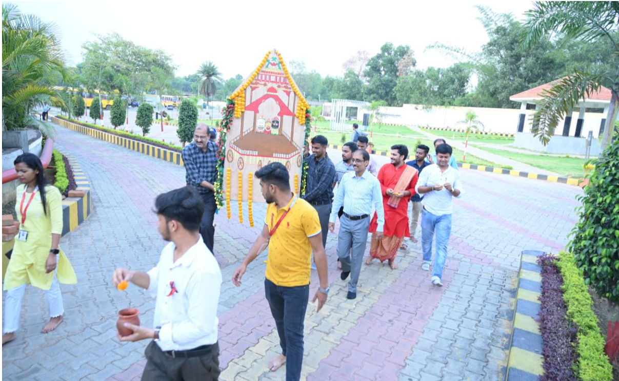
Lord of Universe in a mood for around the Universe