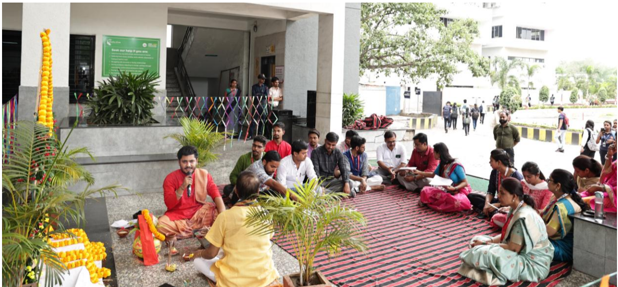
Samuhik Gita Path