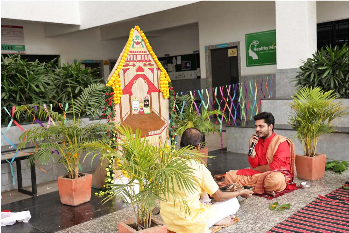
Priest chanting Jagnath astakam