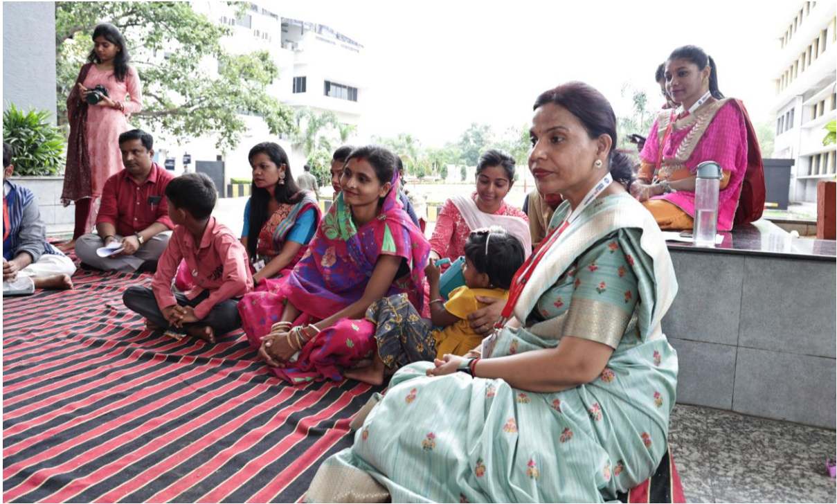
Devotees before lord Jagannath