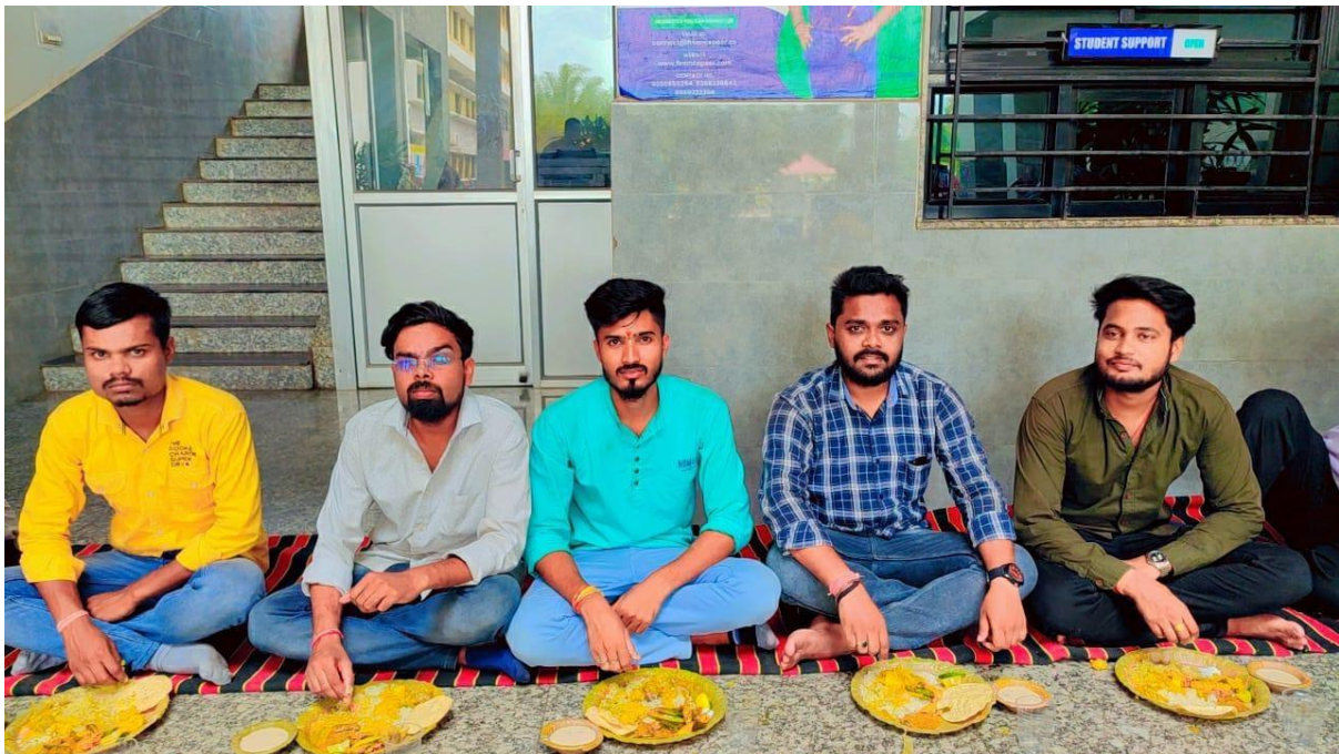
Alumni of B. Pharm 2019 admission batch witnessed the Rath Yatra celebrated by School of Pharmacy