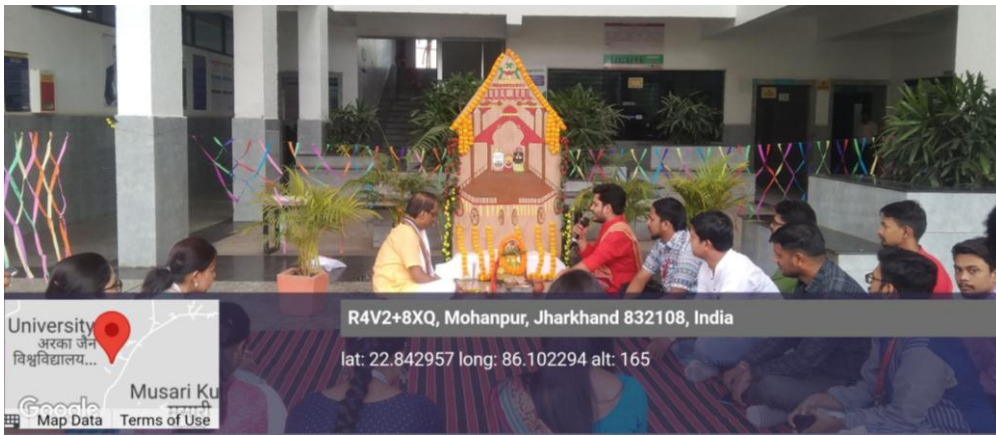
Jagannath Rath Yatra celebrated by School of Pharmacy