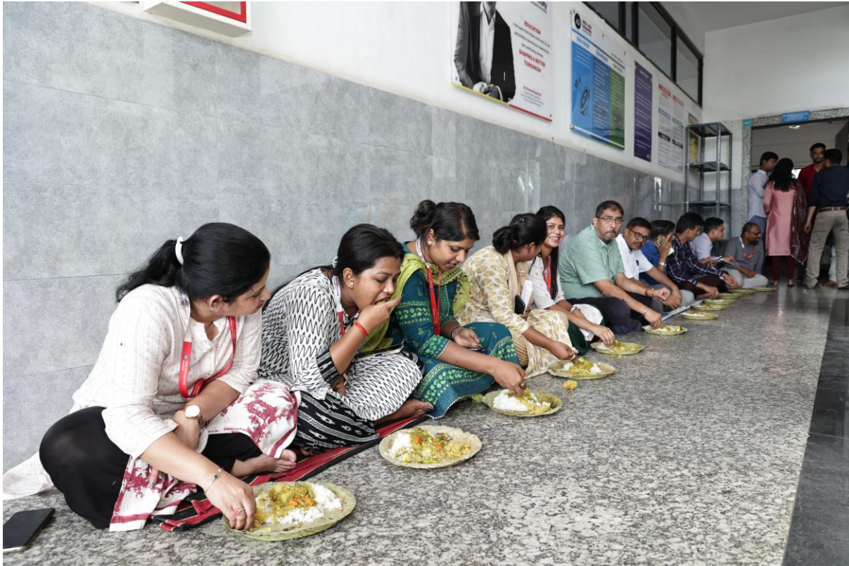
Everyone Enjoying Maha Prasad Seva