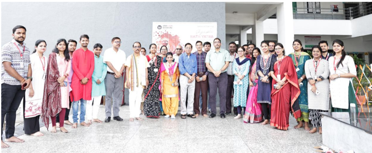
Celebration of the festival Rath Yatra by University family members