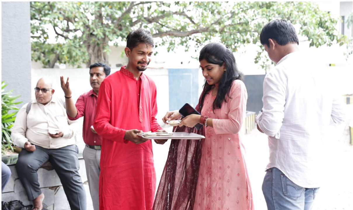
Distribution of Divine Prasadam