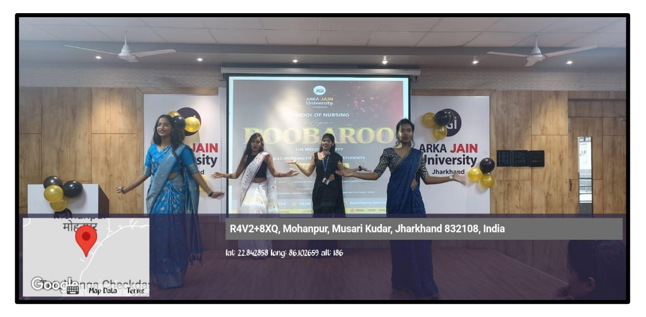
Figure 5: Dance by 3<sup>rd</sup> Semester Nursing Students