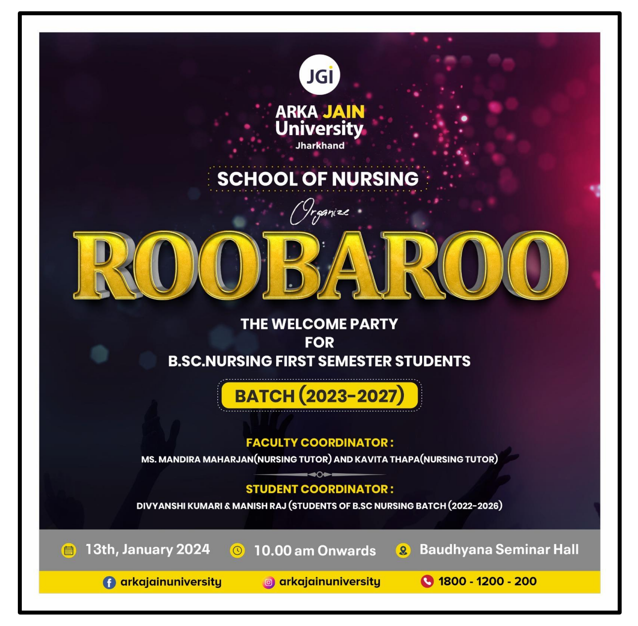
Figure 1: Poster of the Roobaroo