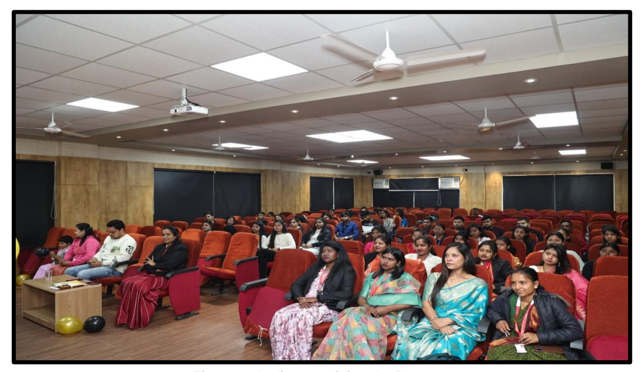
Figure 3: Audience enjoing the Program