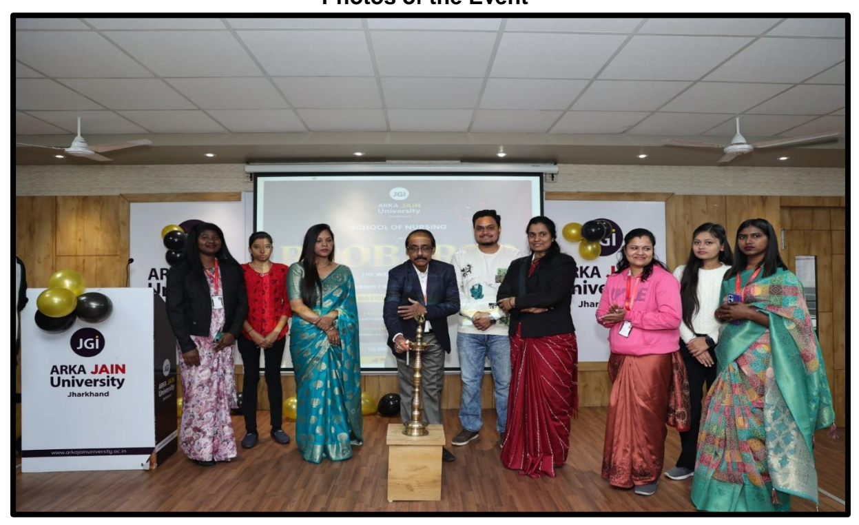
Figure 2: Inaugral of the Program