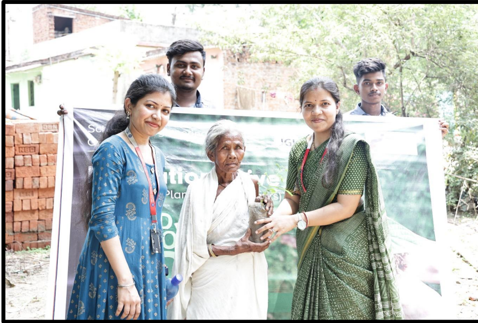
Figure 4: Plantation Drive