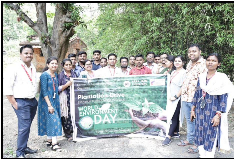
Figure 5: Aimed To Combat Deforestation