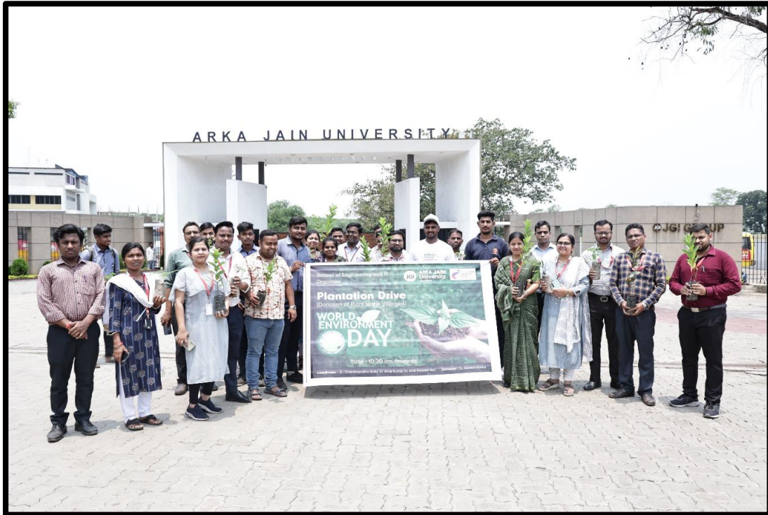
Figure 2: Plantation Drive "Community Service"