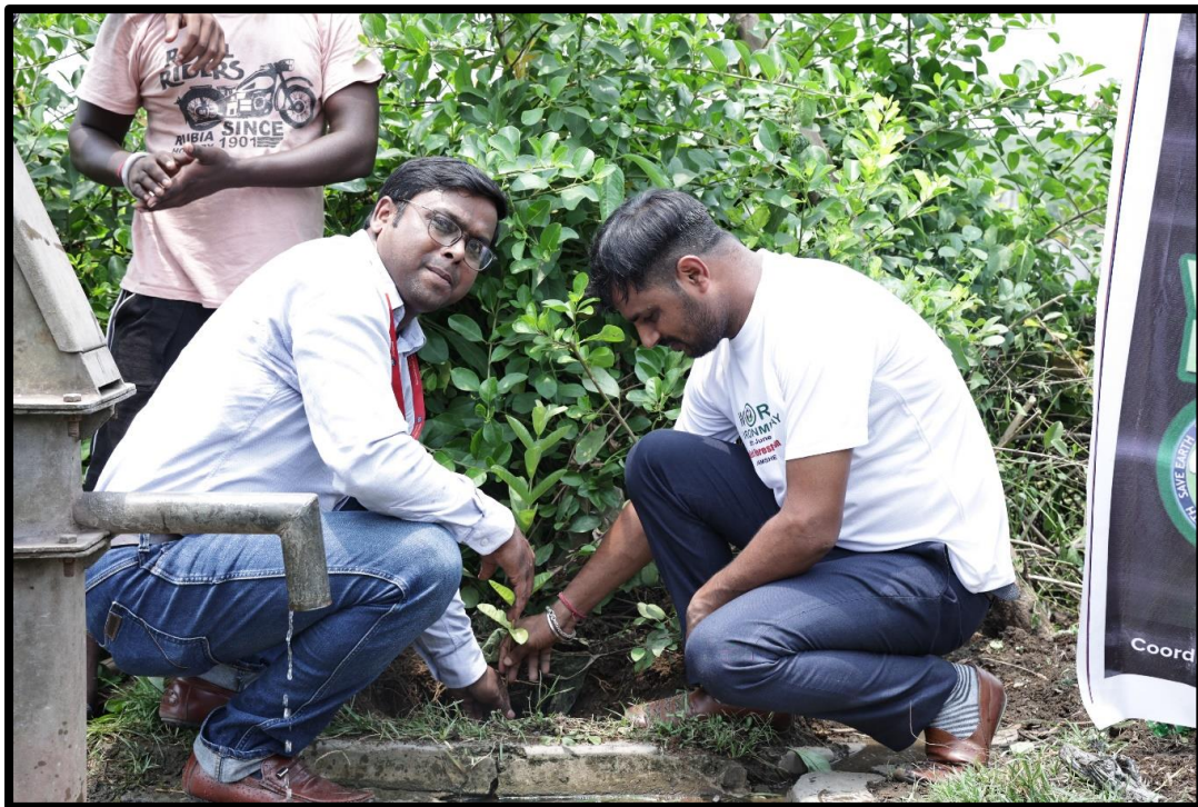
Figure 3: Planting by the Faculty Member