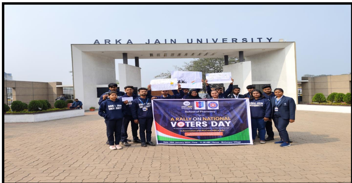
Figure 5: Students along with Faculty member assemble in front of University before the commencement of Rally on NATIONAL VOTERS DAY