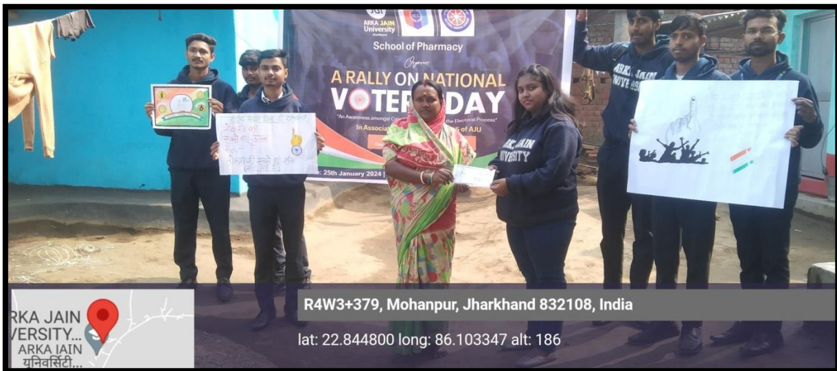
Figure 2: Spreading the message of democracy! Students enlightening villagers on the crucial role of voting in building a brighter future for all