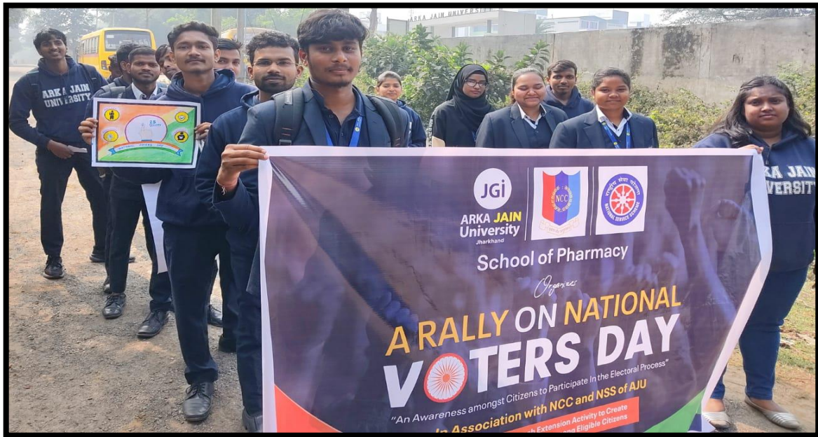
Figure 4: Students passionately spreading the importance of voting