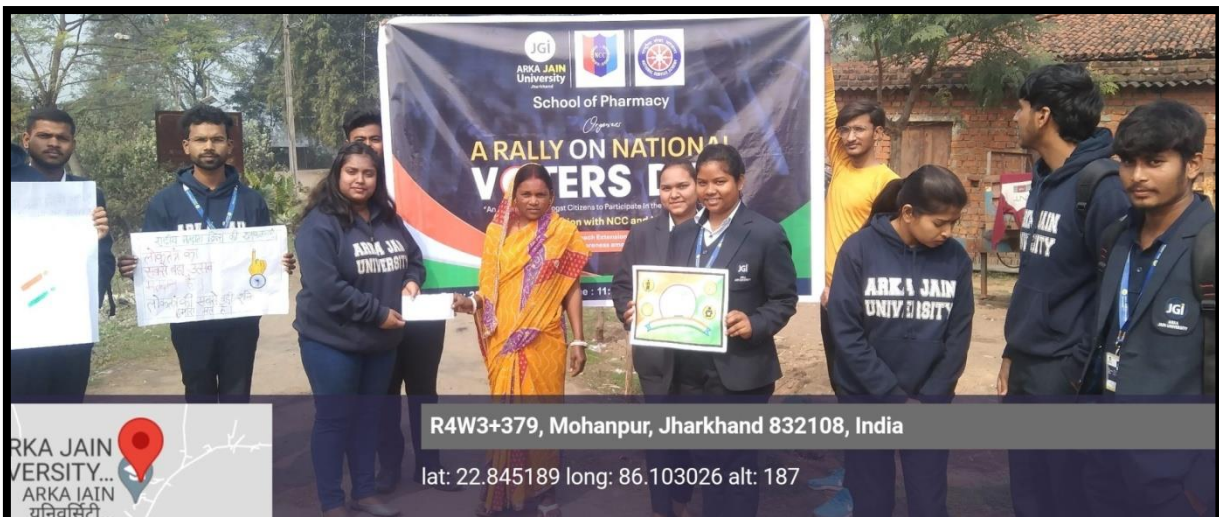
Figure 3: Students take the lead in enlightening villagers about the impact of voting.