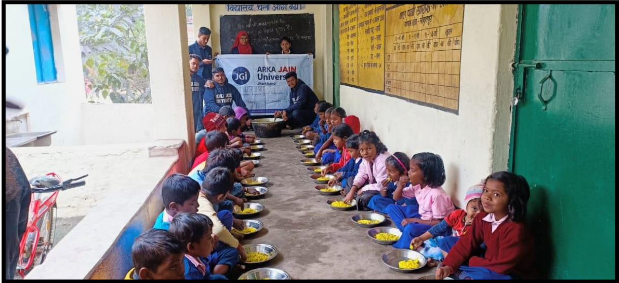
Figure 4: Students come together to distribute free, nutritious food during NUTRICARE.