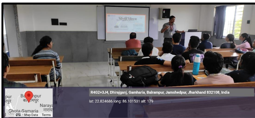
Figure 4: Students paying attention towards speaker