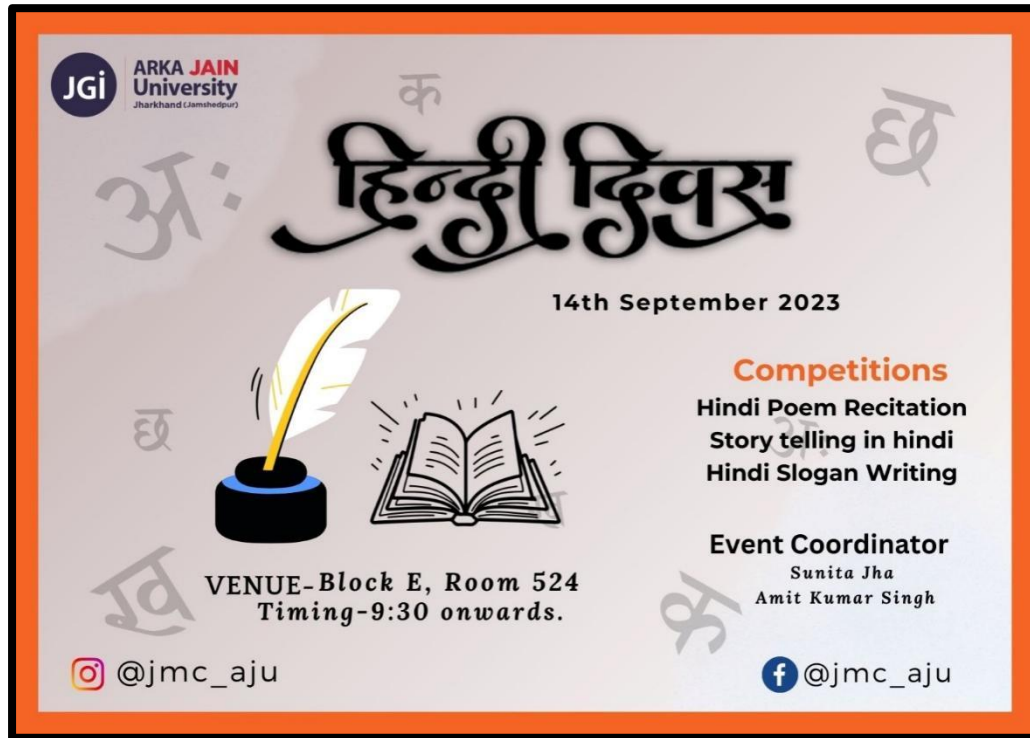
Figure 1: Poster of the Hindi Diwas