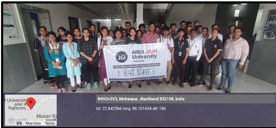
Figure 2: Geo tag photo of the Event Hindi Diwas