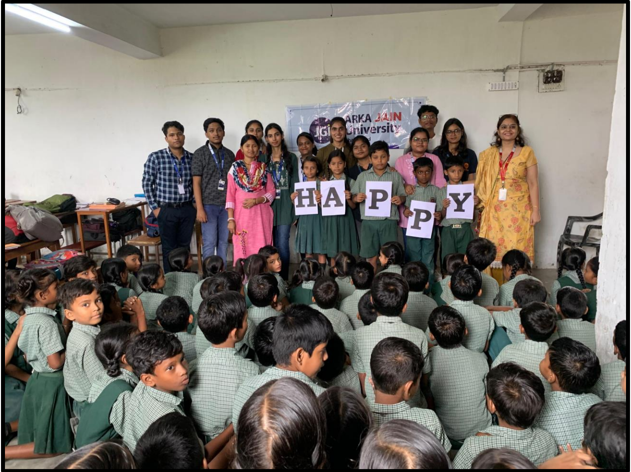
Figure 6: Students getting awareness on Hands Hygiene