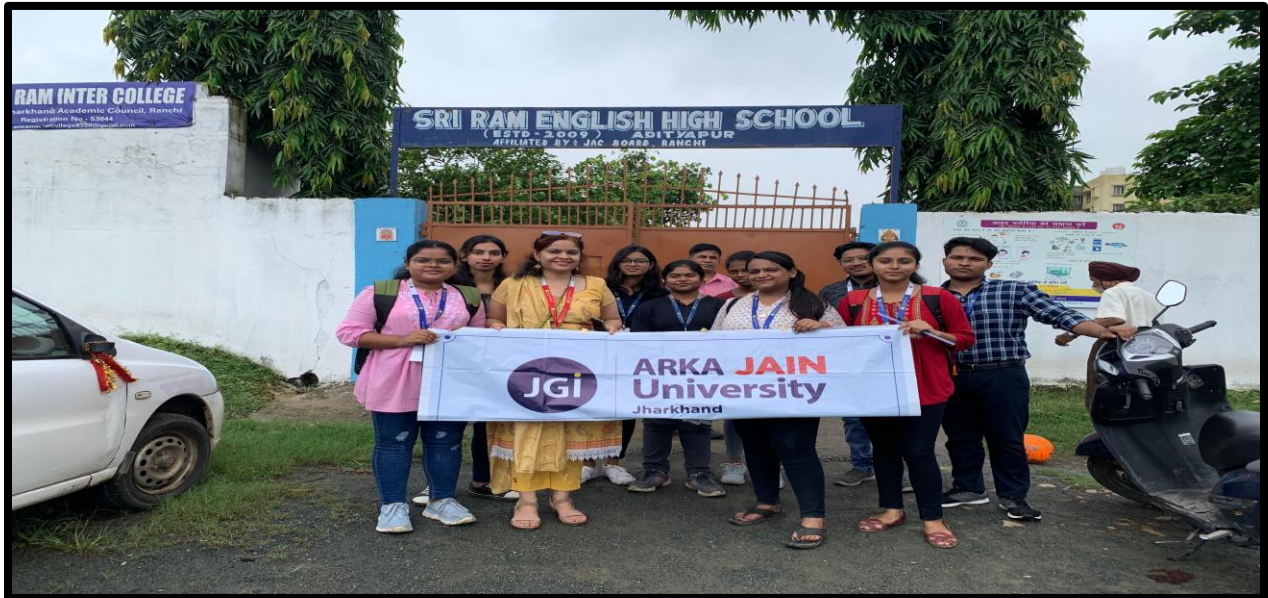
Figure 2: Coordinator and AJU Students arrived at Sri Ram English School