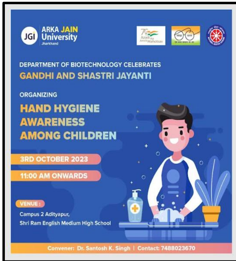
Figure 1: Poster of Hand Hygiene Awareness among Children