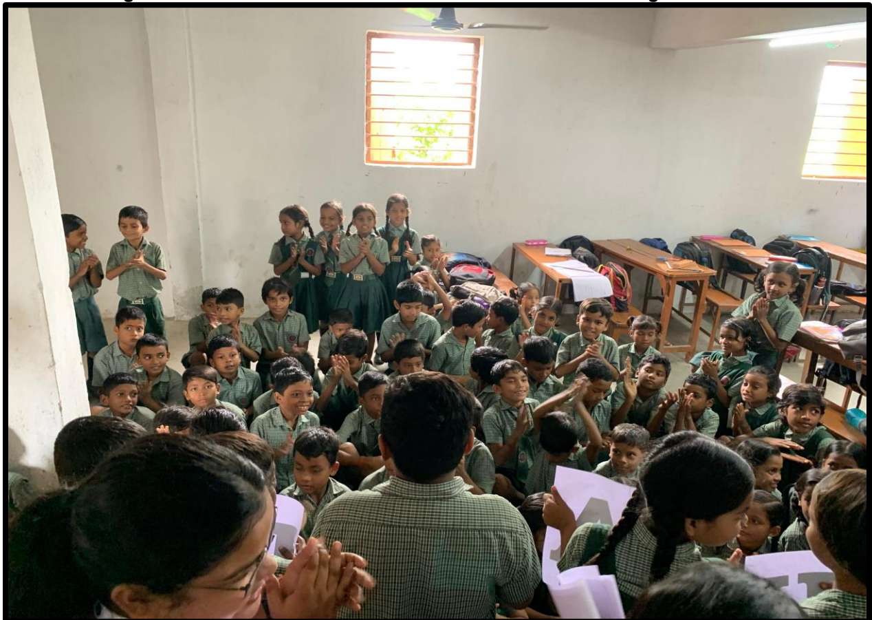
Figure 3: Interaction with Primary school students