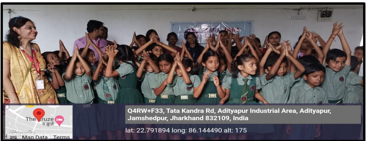
Figure 7: Students learning WHO recommended steps for washing Hands