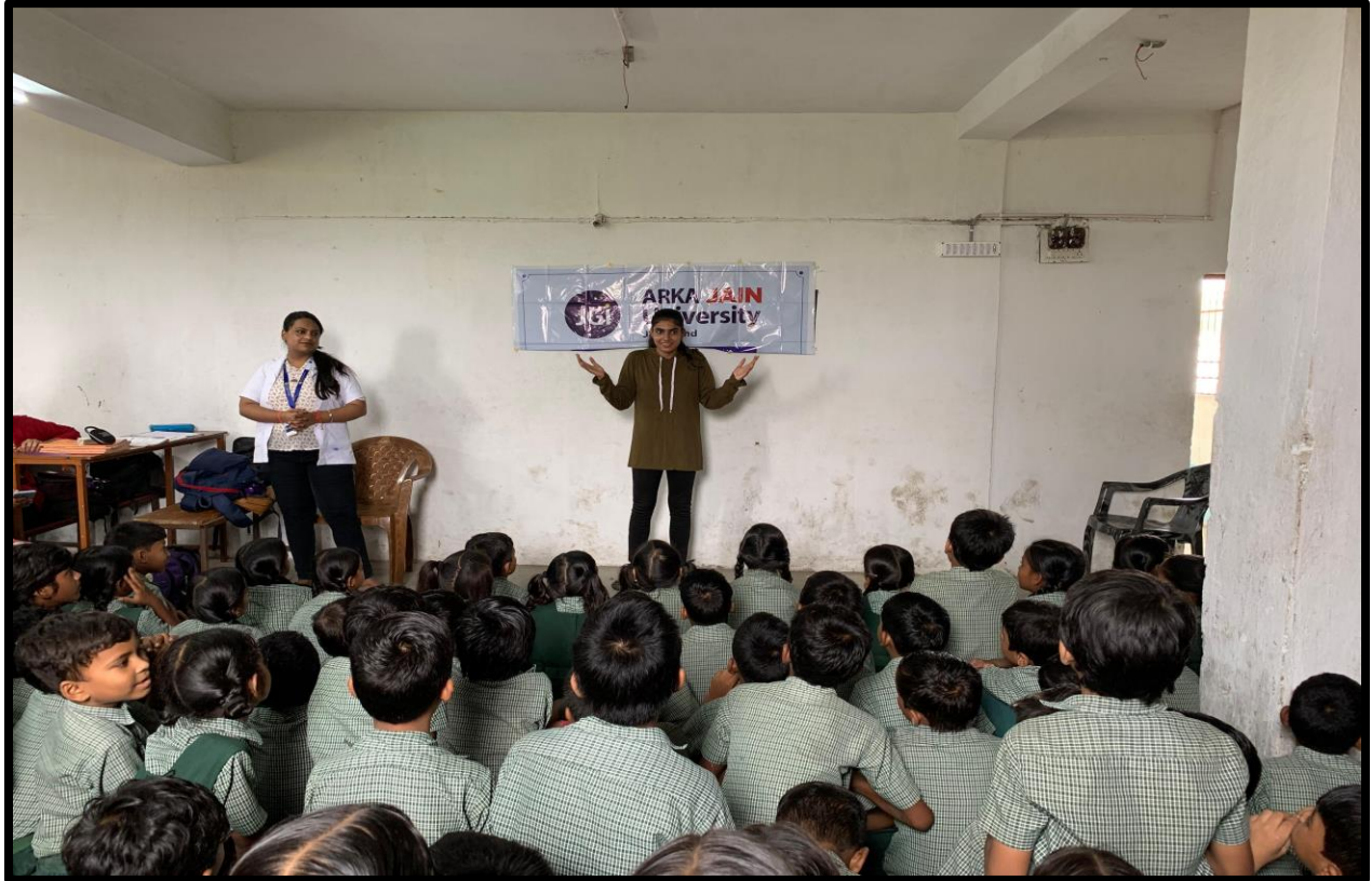
Figure 4: AJU students Interaction with group of primary school students