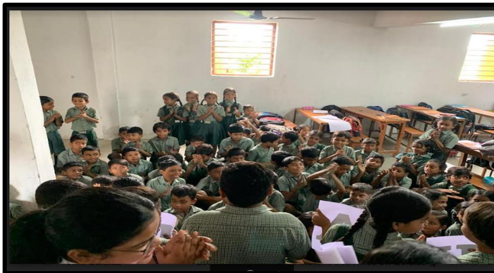
Figure 5: Students learning through activity