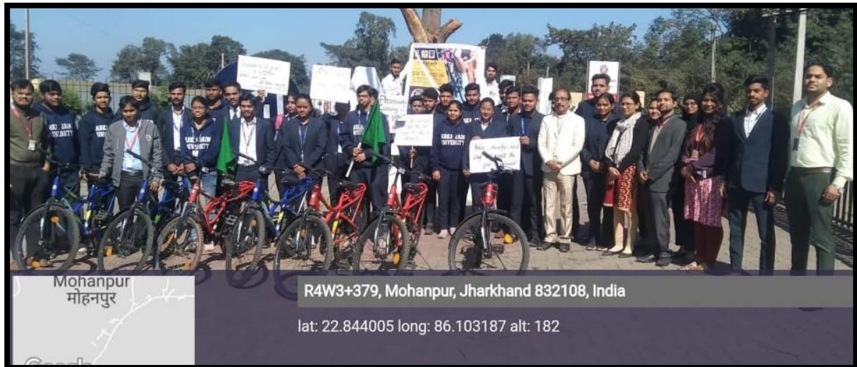
Figure 2: Participants all set for Hum Sikander III, a Mini Cycle Marathon