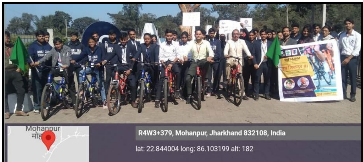
Figure 3: Inauguration of Mini Cycle Marathon