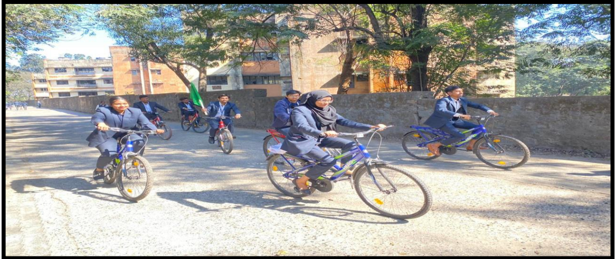
Figure 6: Students actively participating in the Cycle Marathon