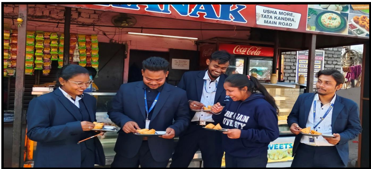
Figure 7: Students relishing the refreshment given after the Mini Marathon