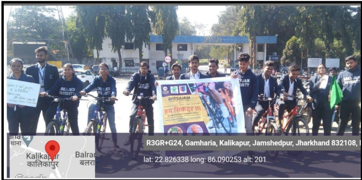
Figure 4: The participants in front of TATA GROWTH SHOP