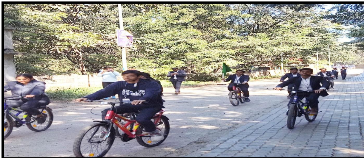
Figure 5: Enthusiastic students actively engaged in the Cycle Marathon