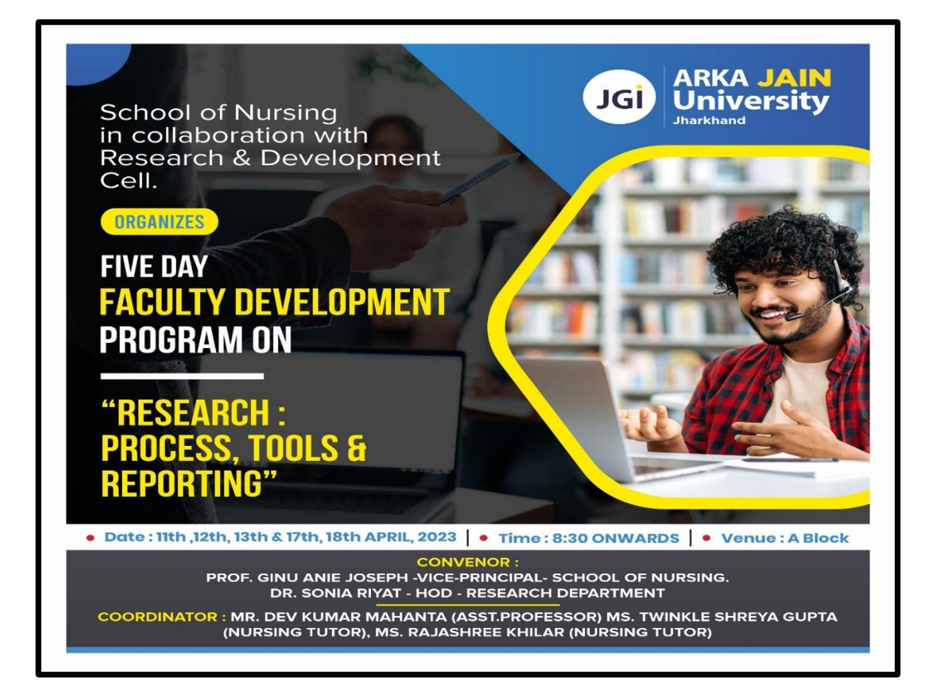
Figure 1: Poster of the Five Day Faculty Development Program on "Research: Process, Tools & Reporting."