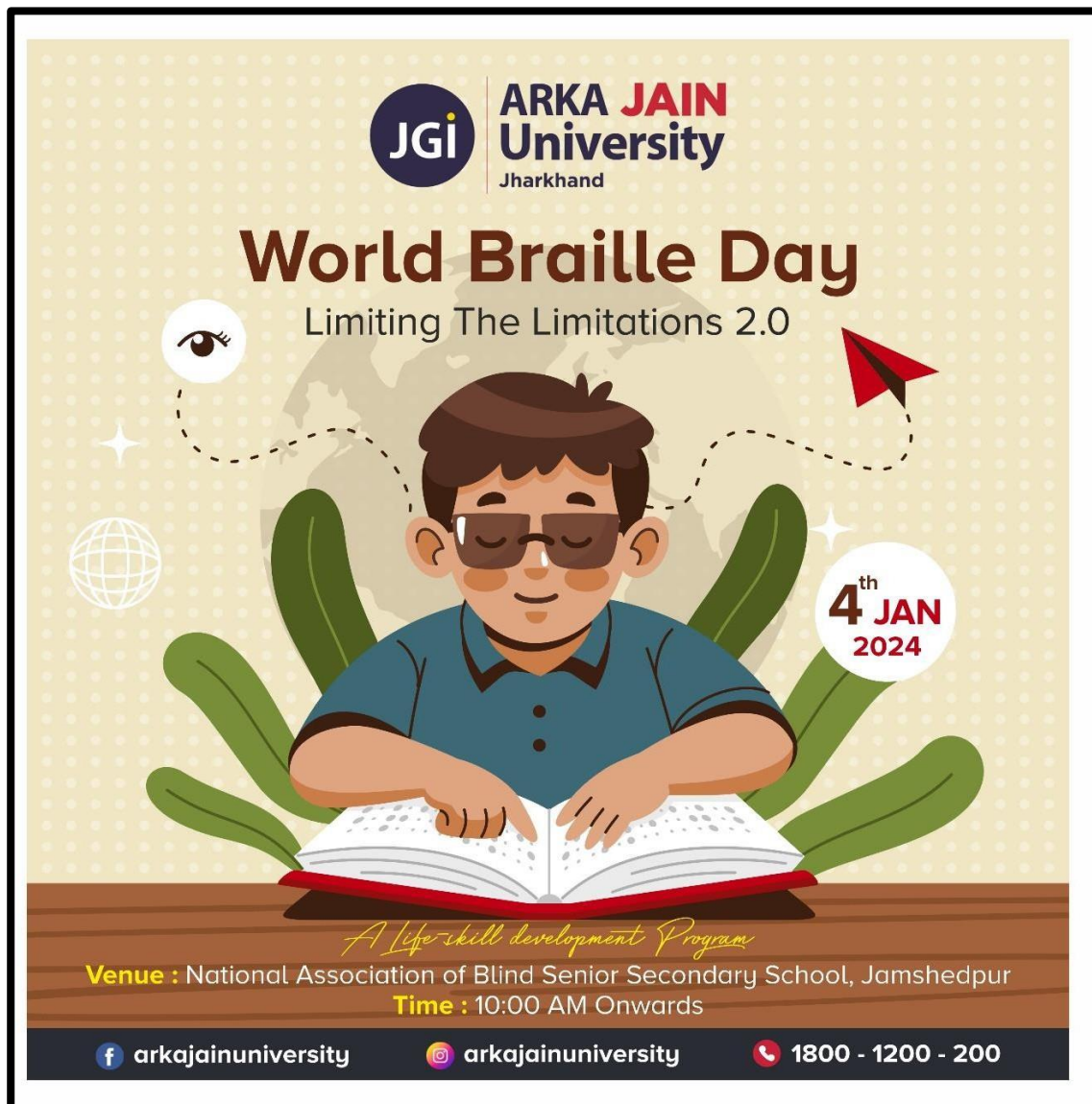
Figure 1: Poster of World Braille Day