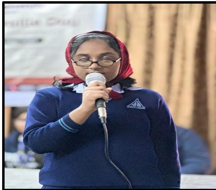
Fig 3. Students Showcasing their talents