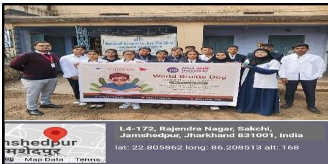
Fig 4. Department visited the National association of blind school sakchi, Jamshedpur