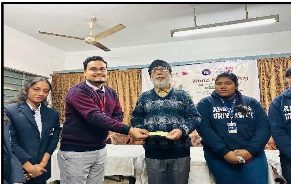
Fig 2. Providing wifi access to the authority