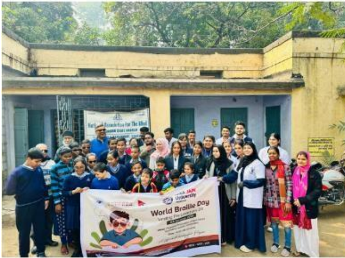
अरका जैन विश्वविद्यालय: ऑटोमेट्री विभाग ने दृष्टिहीनों के साथ ब्रेल दिवस मनाया