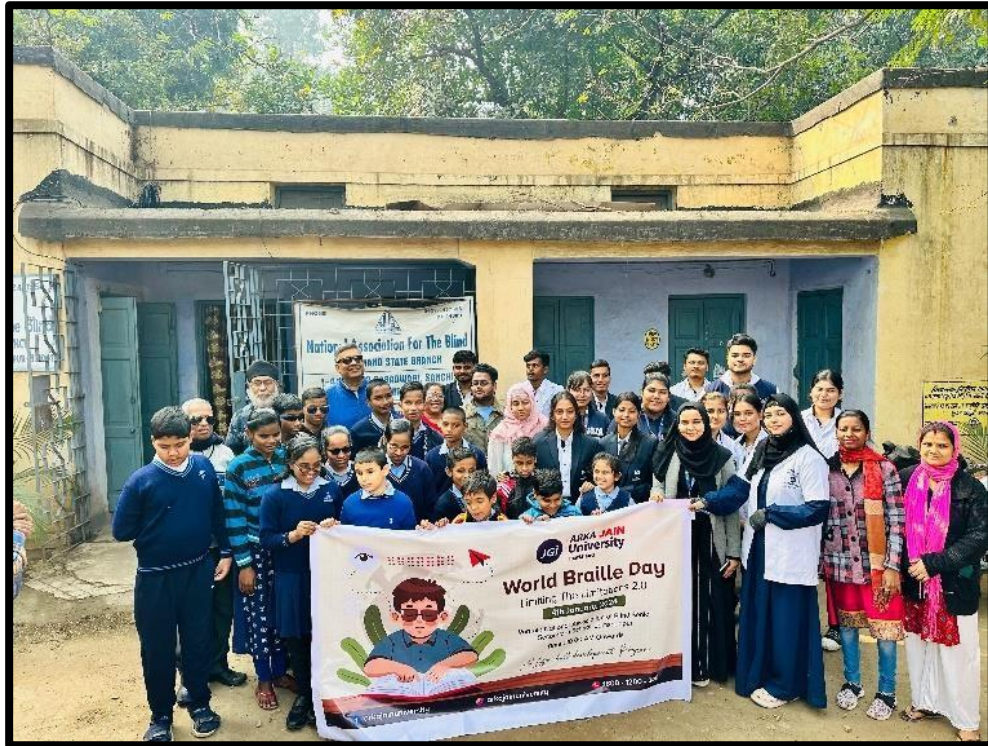
Fig 1. Students assembled in front of blind school