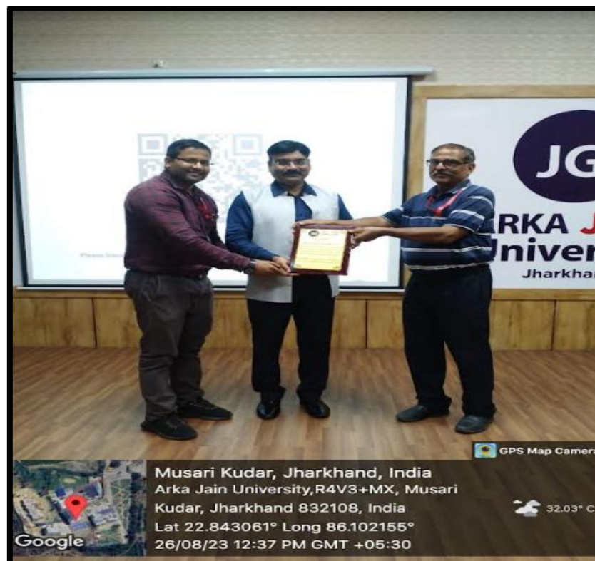
Figure 3: Geo Tag Photo