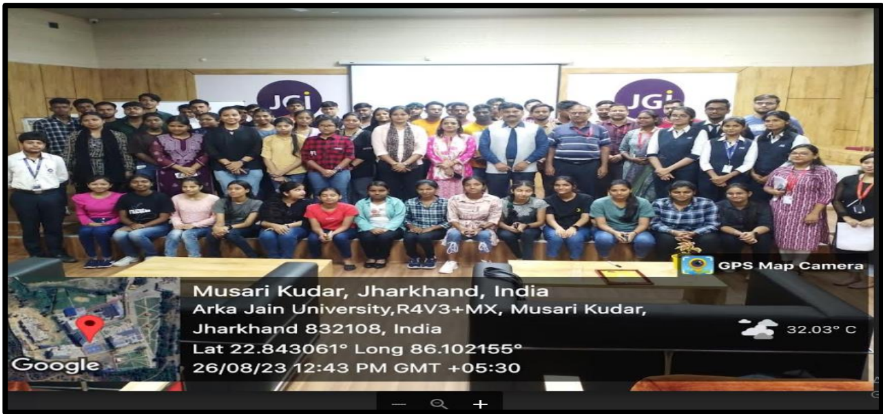
Figure 4: All Participants and Faculty in one frame