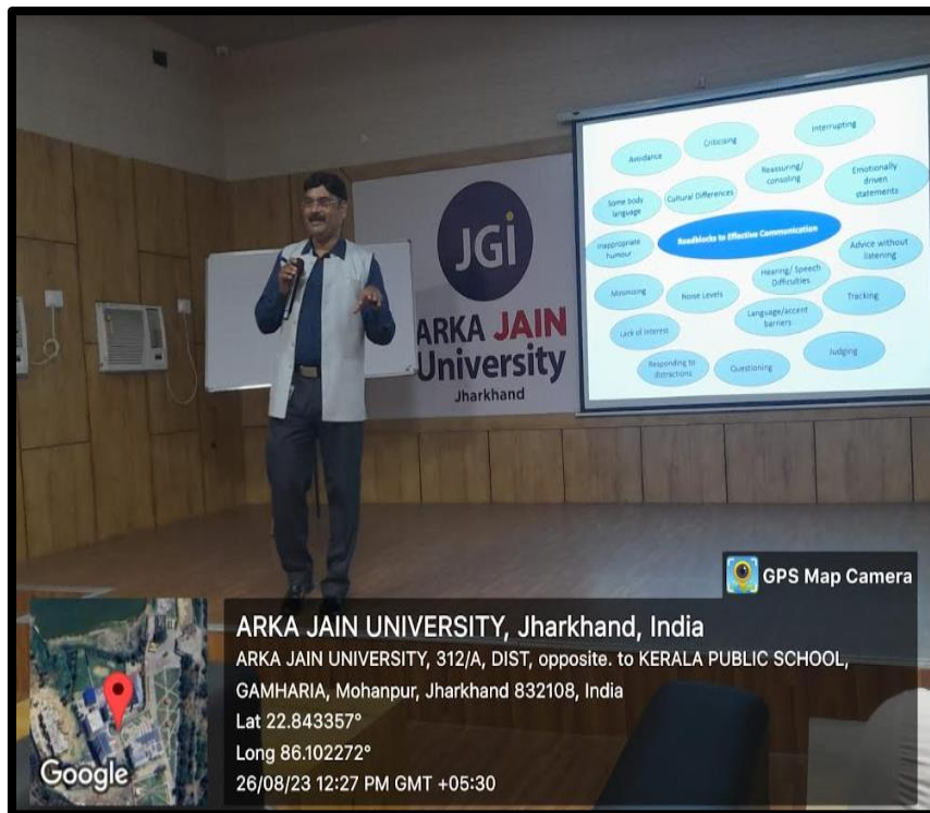
Figure 2: Guest Speaker sharing his knowledge