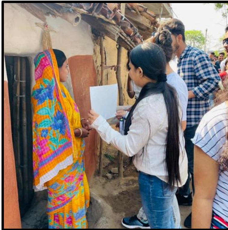
Figure 2: Students Visited to Mohanpur Village