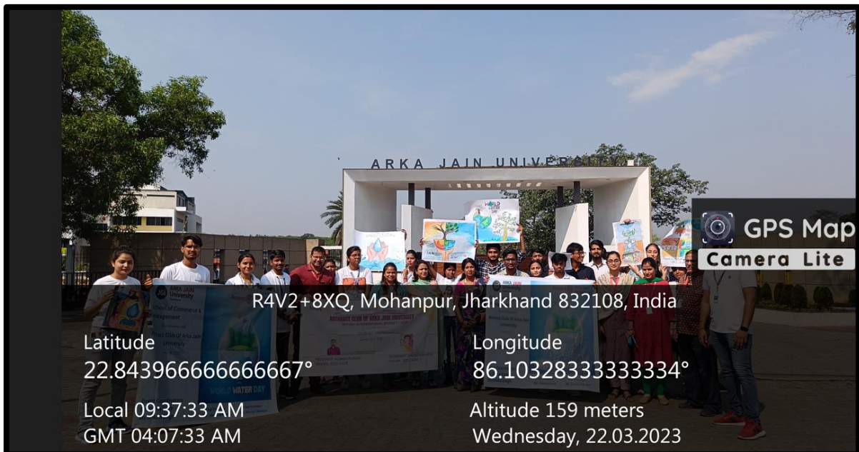
Figure 3: Geo Tag Photo