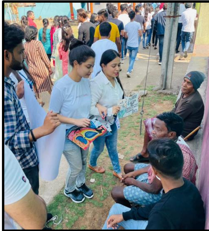
Figure 4: Students educating villagers