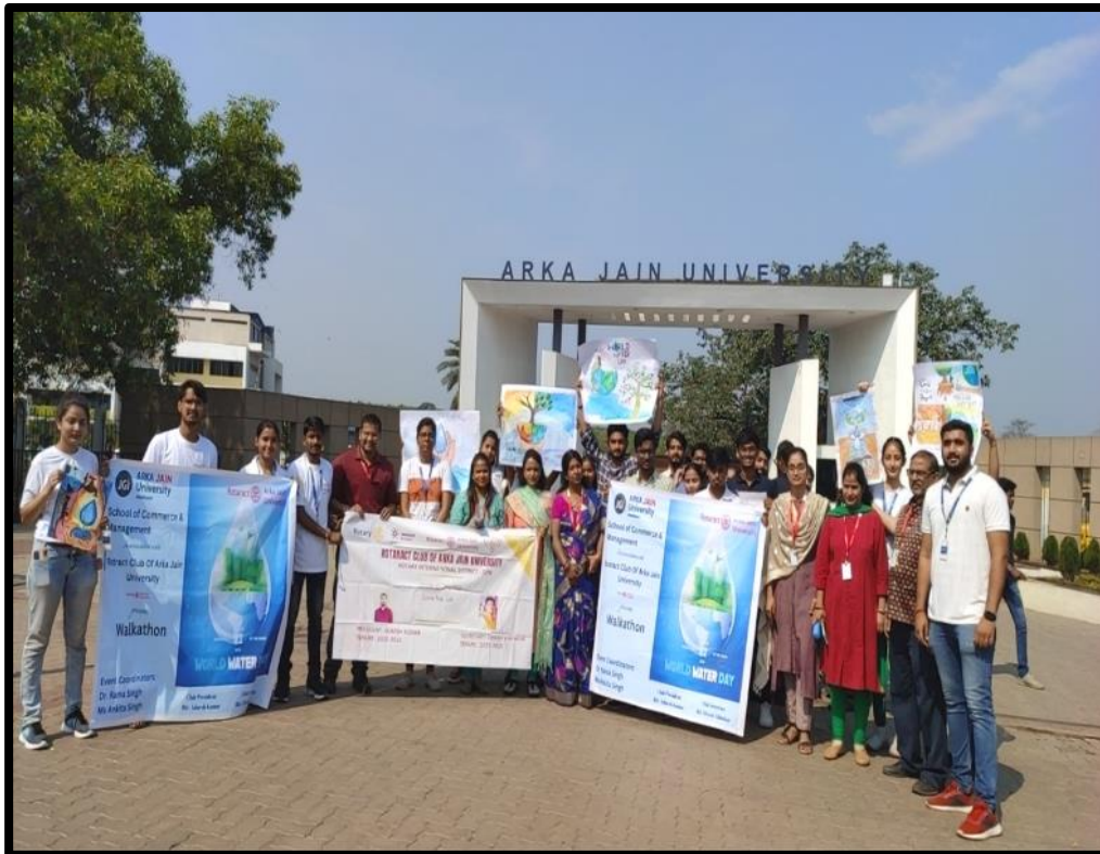
Figure 6: All in one frame