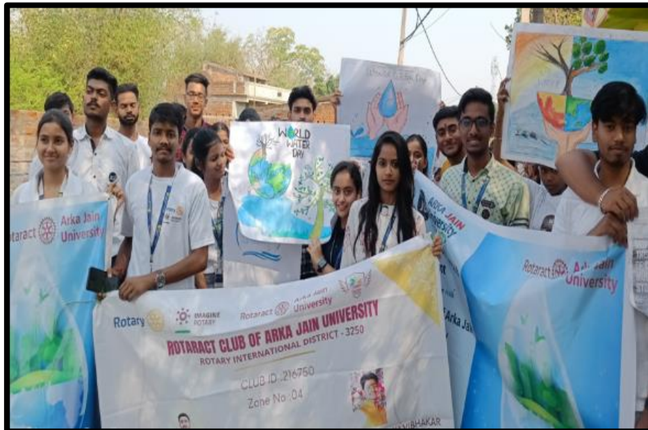
Figure 5: During walkathon