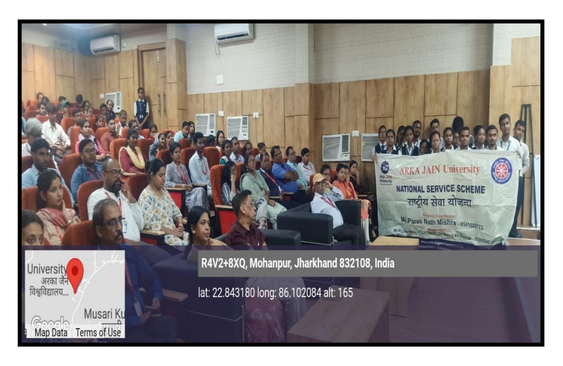
Figure 6: Volunteers and Teachers as audience during Vijay Divas Observance