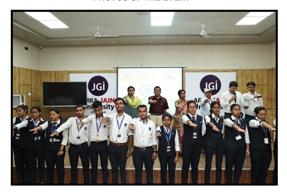
Figure 2: "Panch Pran" Oath Ceremony during Vijay Divas