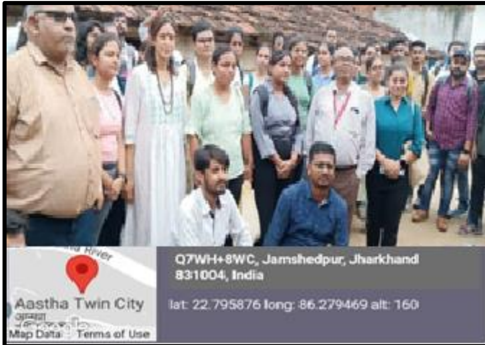
Figure 6: Students along with the founder of NEEV