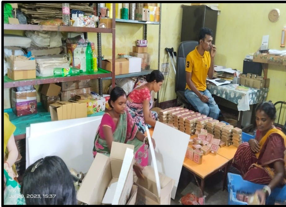
Figure 4: Packaging is being done at the company