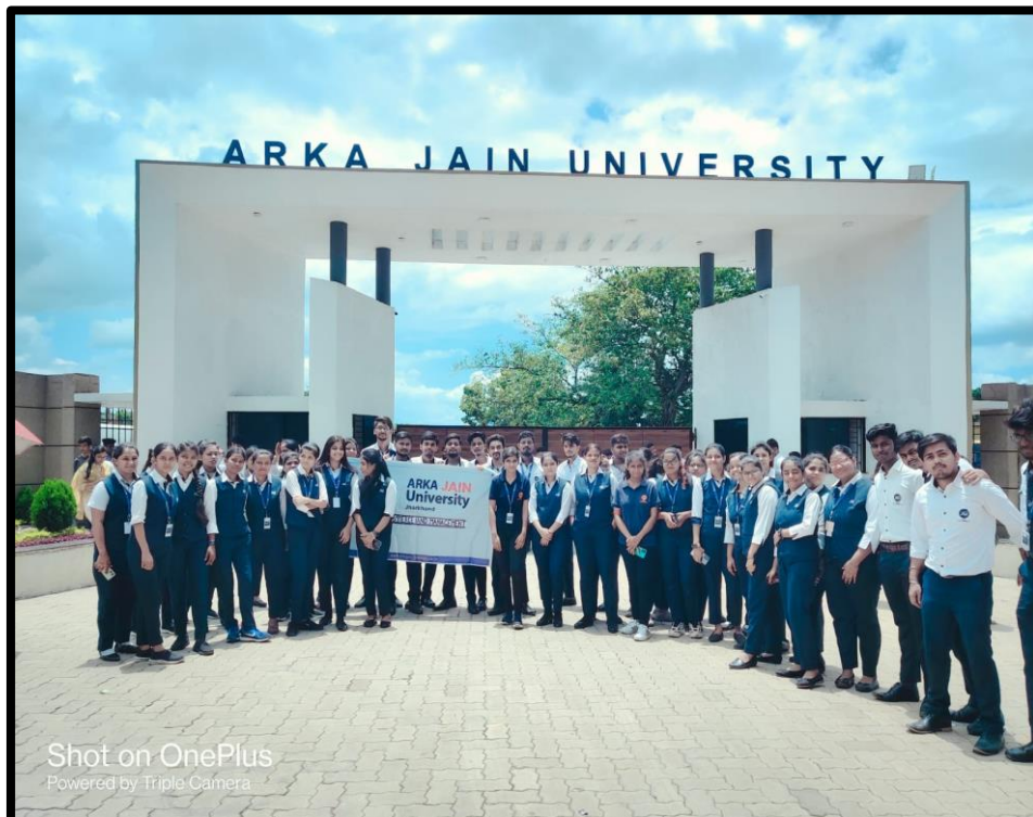
Figure 5: Students leaving the Campus for the Industrial visit