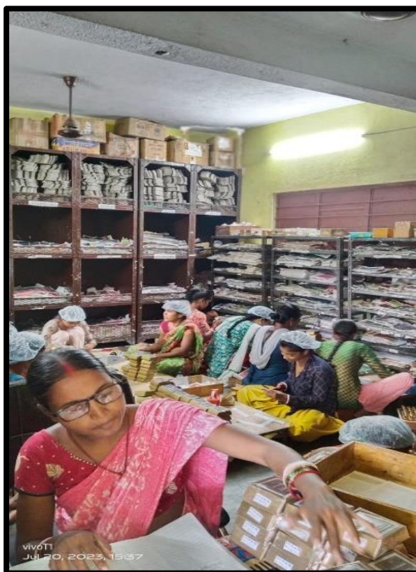
Figure 3: Women's preparing the Soaps