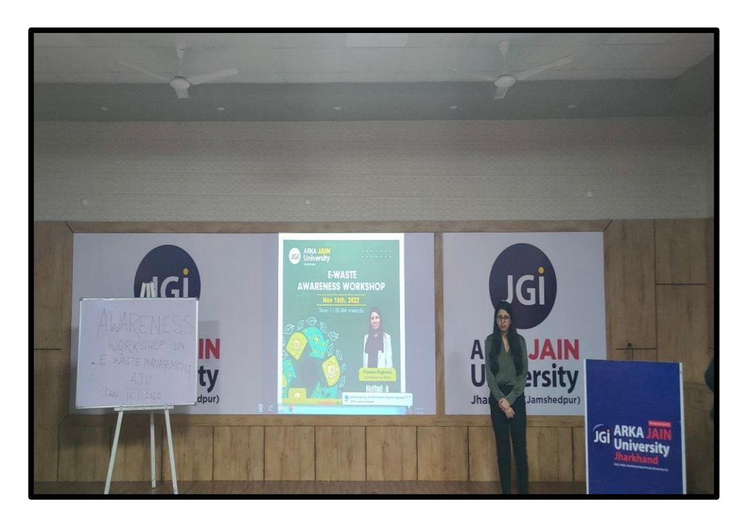
Figure 3: Photo of the E-Waste Management Awareness Workshop