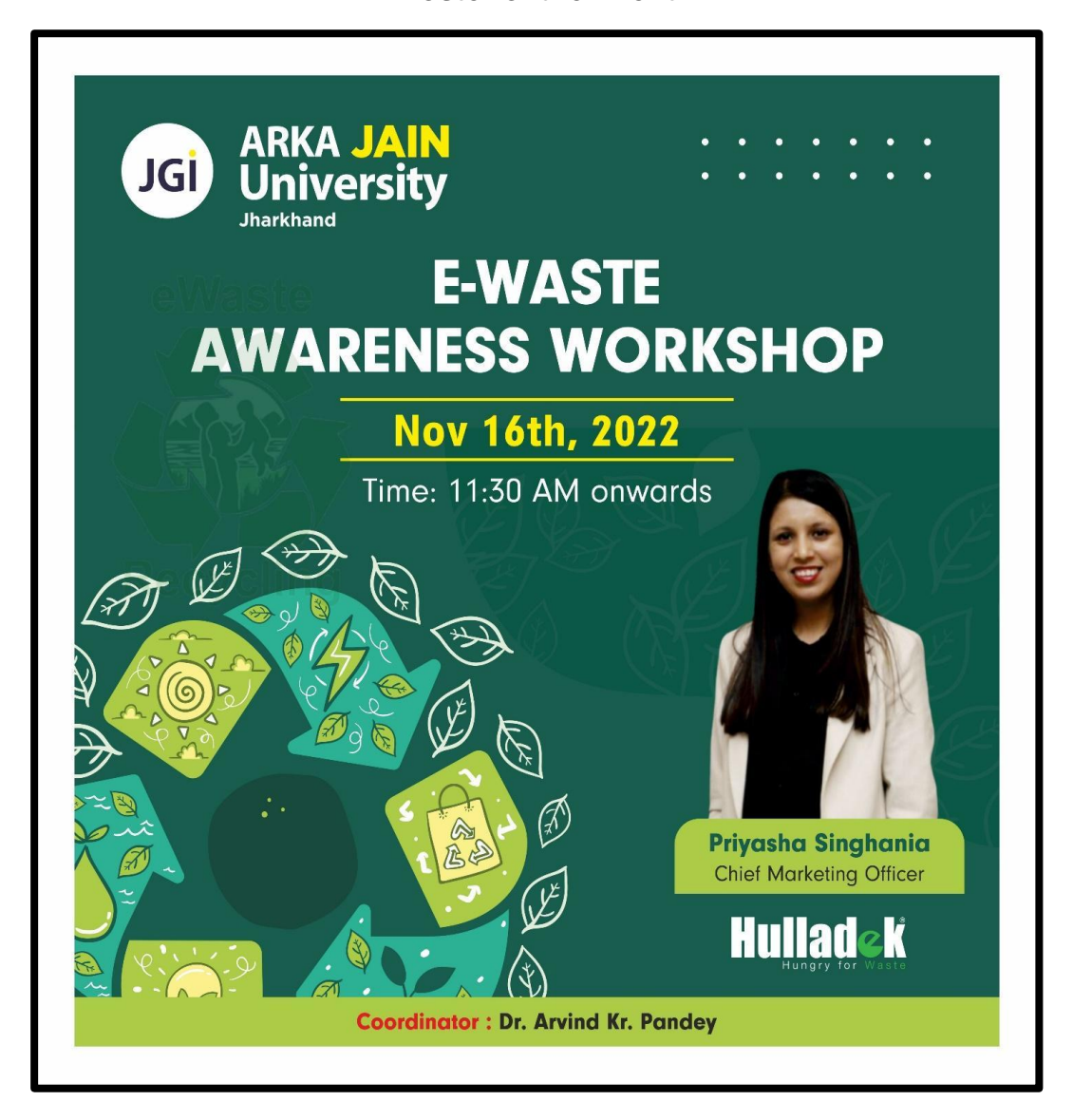
Figure 1: Poster of the E-Waste Management Awareness Workshop