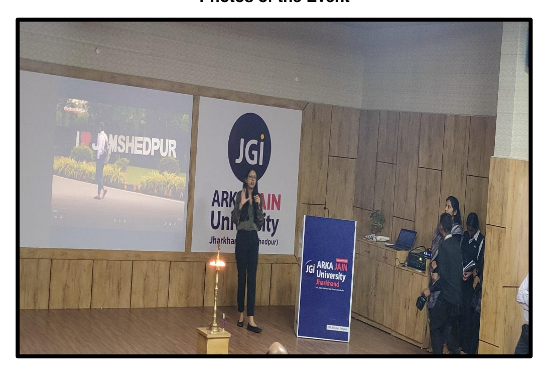
Figure 2: Guest Speaker sharing her Knowledge on E-Waste Management