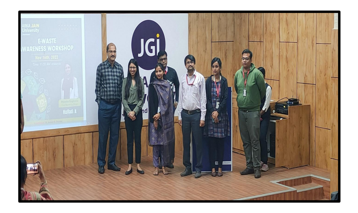
Figure 5: All Dignitaries in one frame