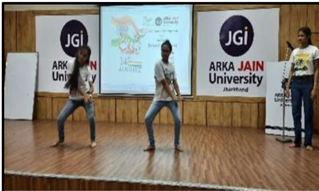
Figure 4: Dance Doubles