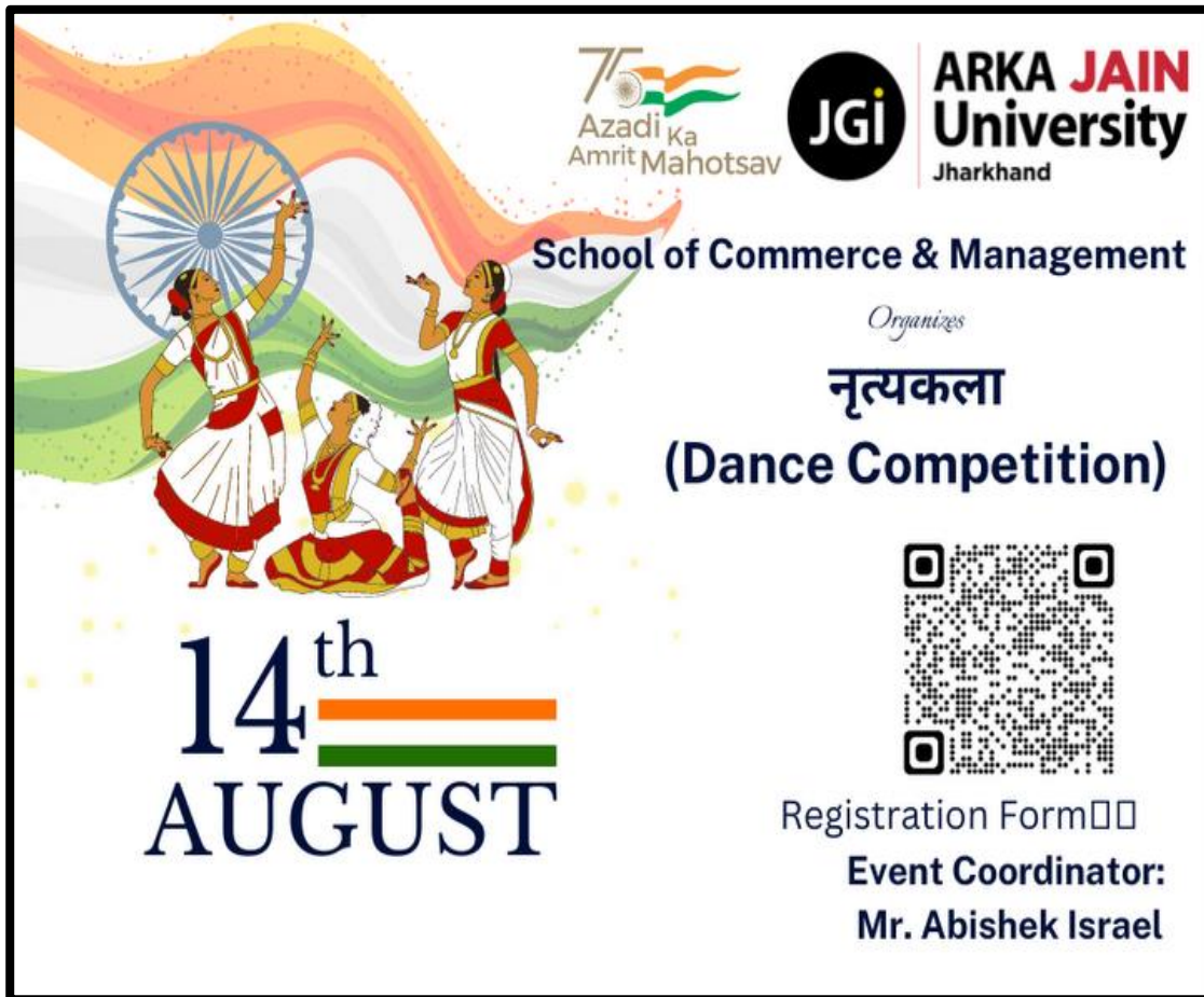
Figure 1: Poster of the event “नृत्यकला (Dance Competition)”