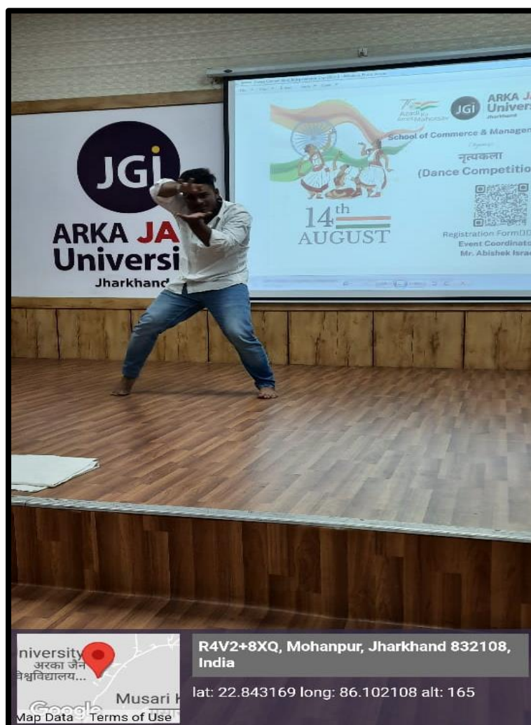
Figure 3: Dance singles