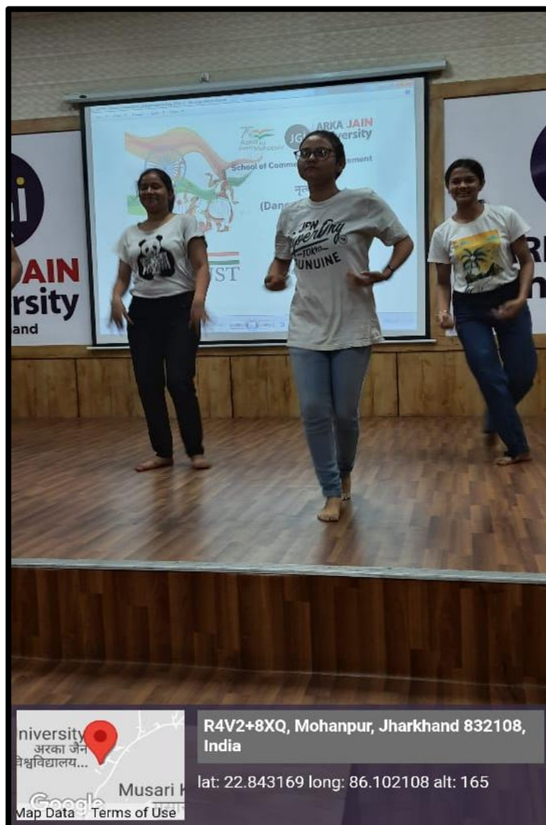
Figure 2: Students performing group dance