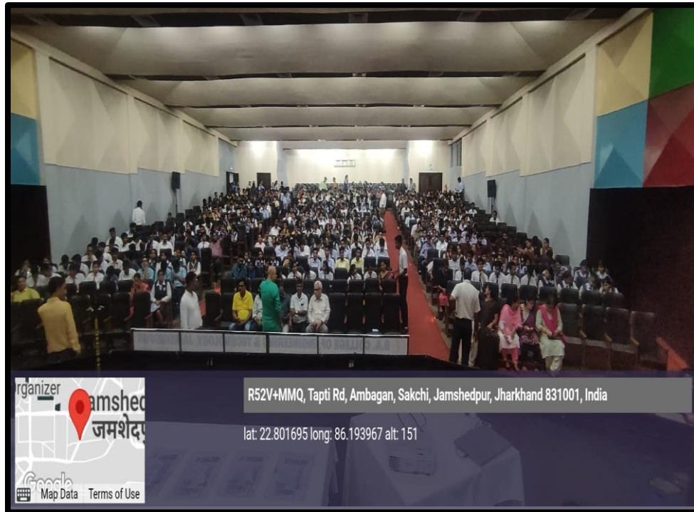
Figure 1: The Auditorium was packed with students to attend the Career Counselling Session