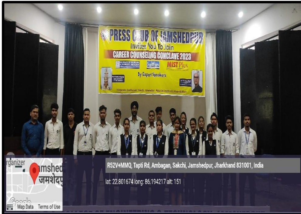
Figure 3: Students of ARKA JAIN UNIVERSITY along with Faculties who attended the whole session