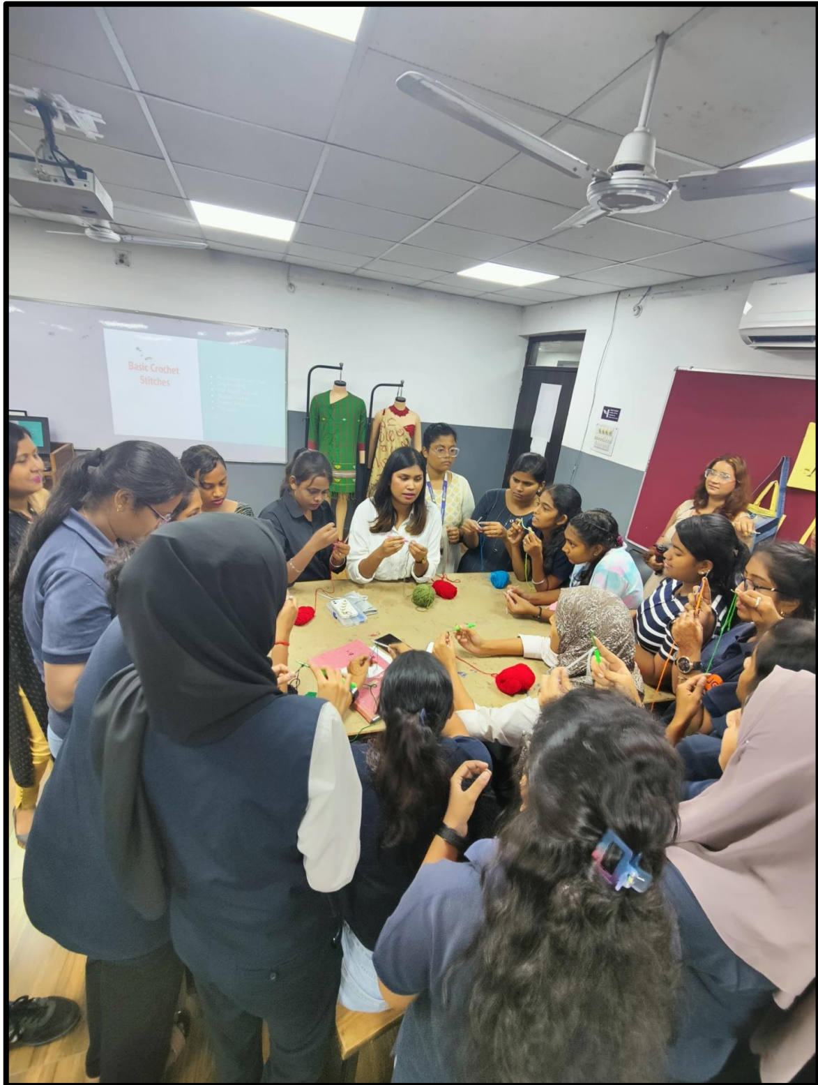
Figure 6-A classroom view of the workshop