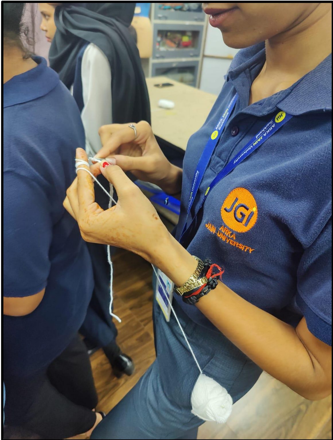
Figure 7- A close-up view of a student practicing crochet