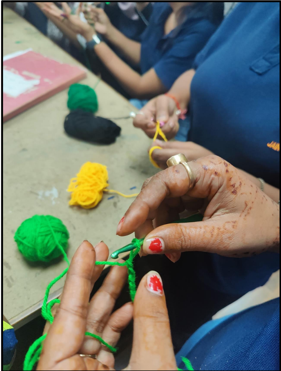
Figure 8- Basic crochet chain stitch being executed by student