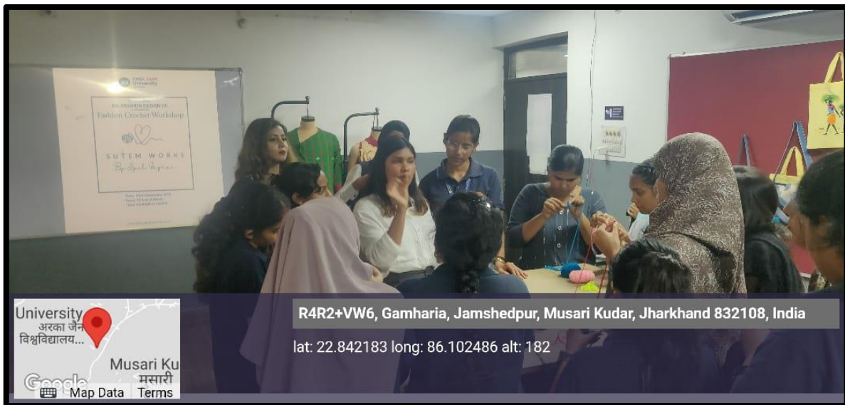
Figure 5- Ms Gagrai instructing the basic concept of amateur level crochet stitches