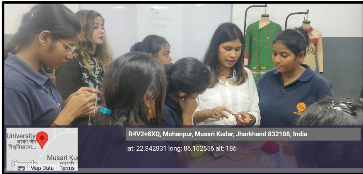
Figure 4- Ms Gagrai meticulously explaining the crochet stitches to the students