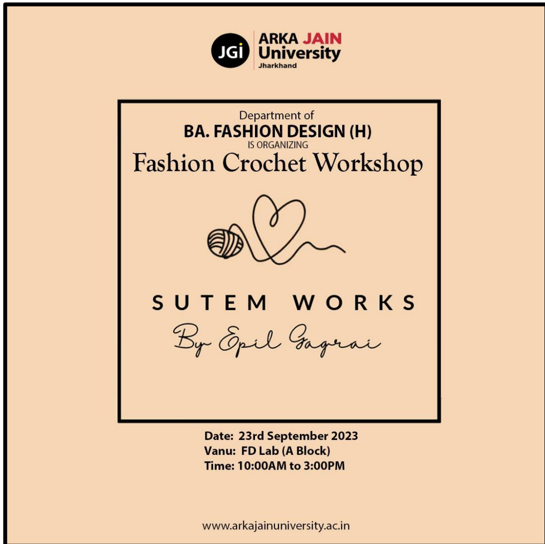
Figure 1: Poster of the Fashion Crochet Workshop