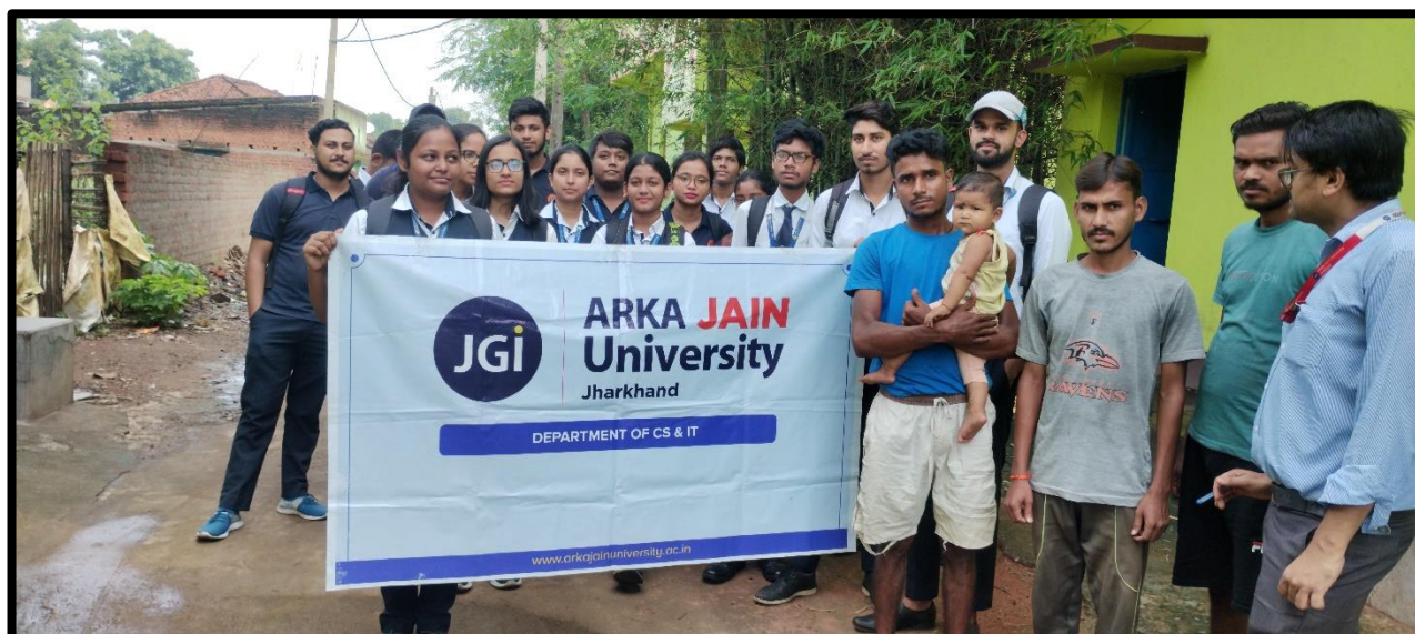
Figure 2: Photo of the Awareness of Education in Rural Areas