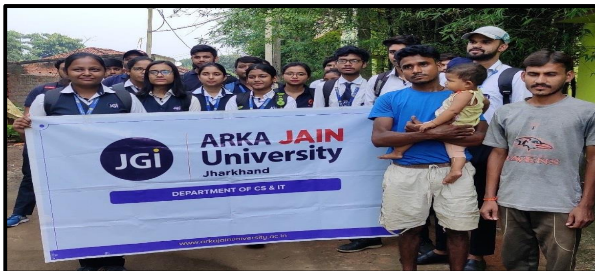
Figure 3: Photo of the Awareness of Education in Rural Areas