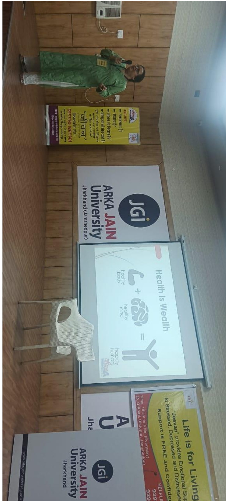
Photo of the Event: Workshop on 'Stress Management and Suicide Prevention'