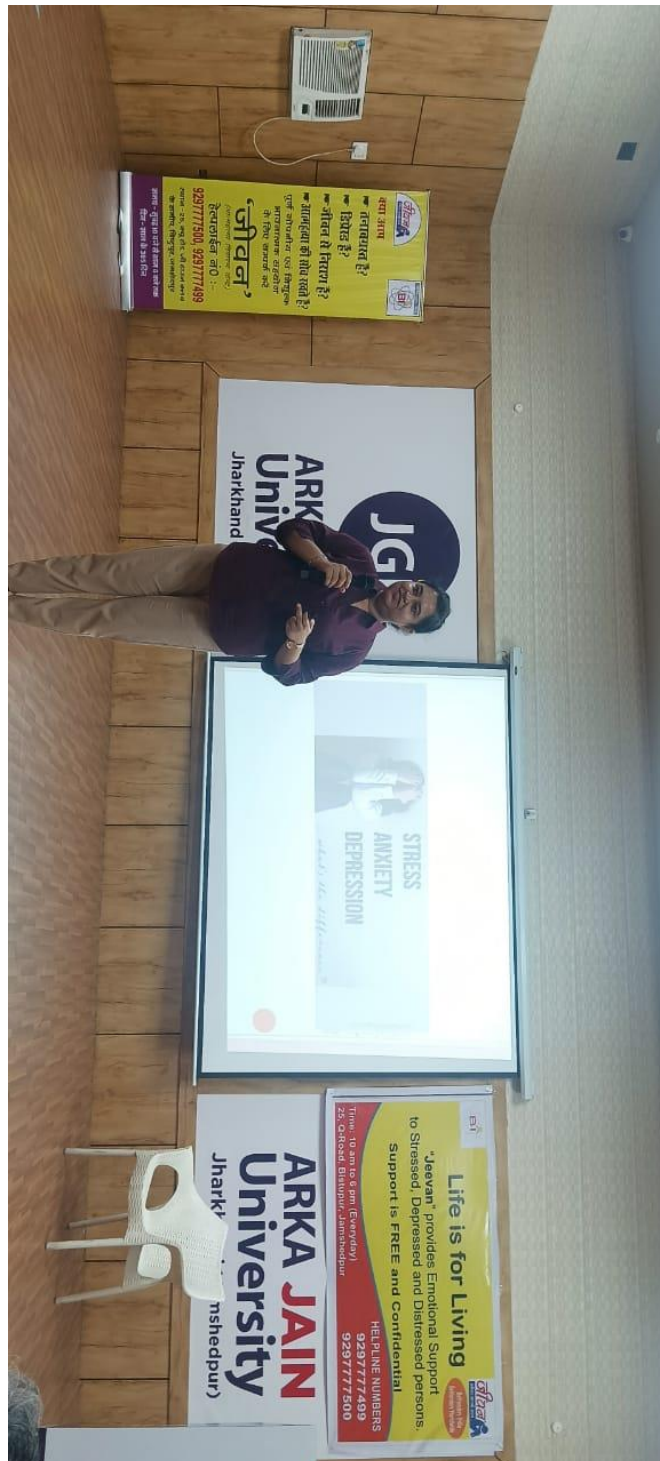
Photo of the Event: Workshop on 'Stress Management and Suicide Prevention'