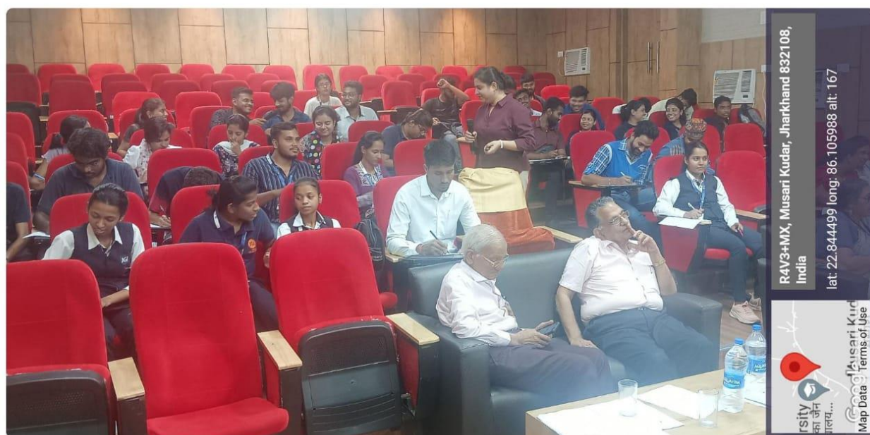
Photo of the Event: Workshop on 'Stress Management and Suicide Prevention'