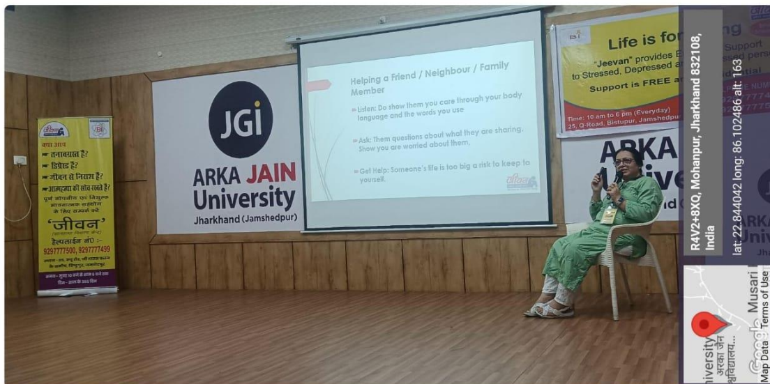
Photo of the Event: Workshop on 'Stress Management and Suicide Prevention'