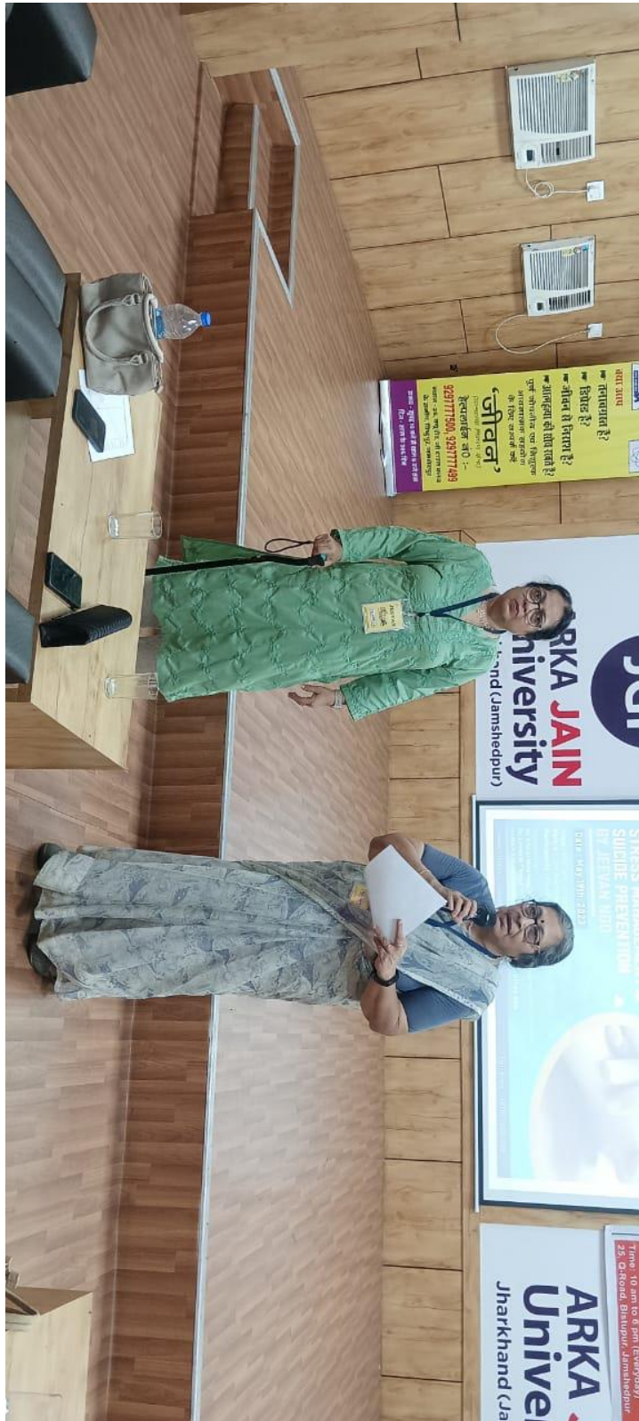
Photo of the Event: Workshop on 'Stress Management and Suicide Prevention'