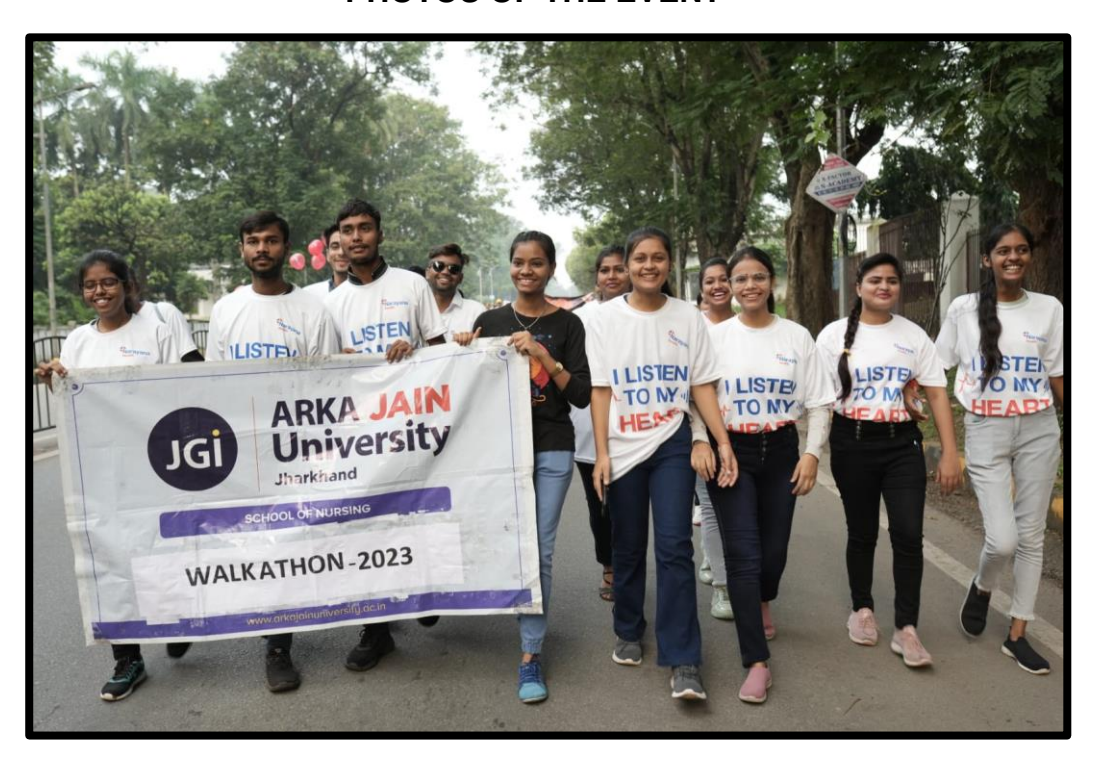
Figure 2: Nursing Students encouraging society regarding the benefits of morning walk