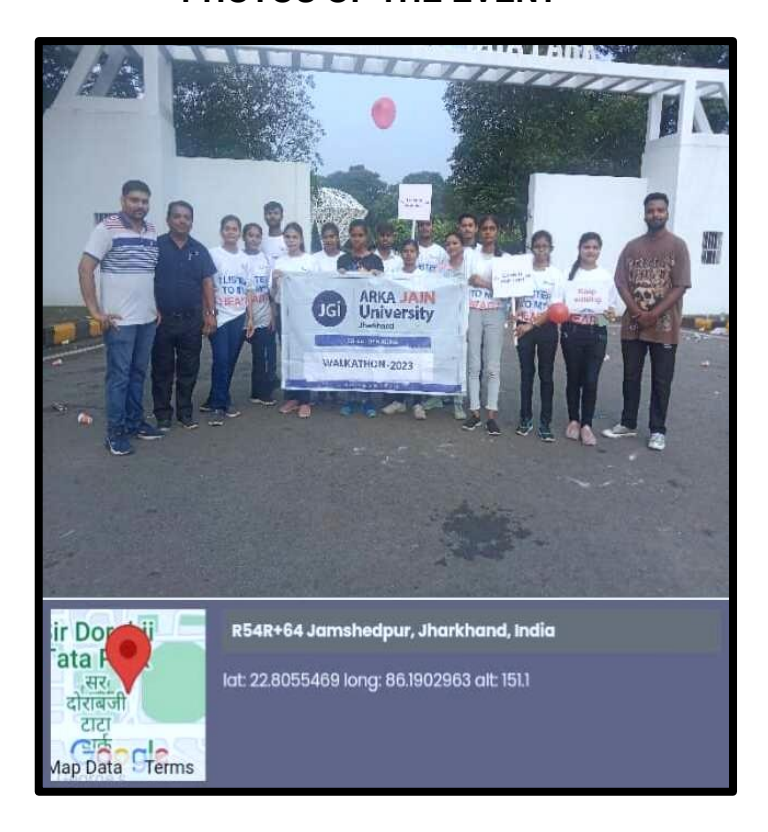
Figure 4: Group Snap of Walkathon- 2023 along with the Nursing faculties and students