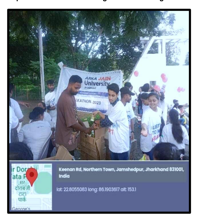
Figure 5: Distribution of Fruit Juice & water Bottle