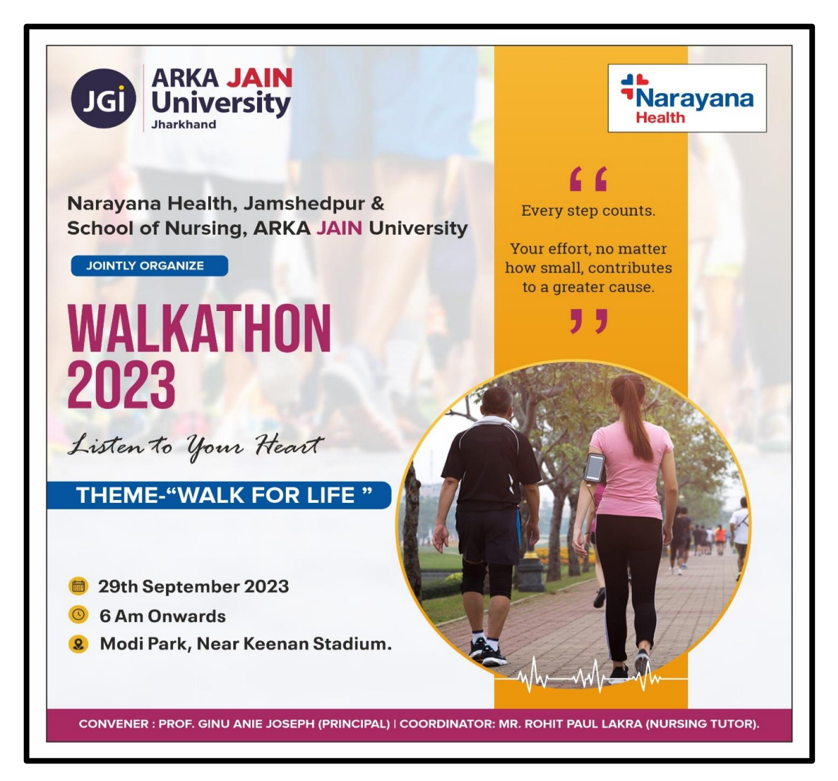
Figure 1: Poster of the Event "WALKATHON- 2023"