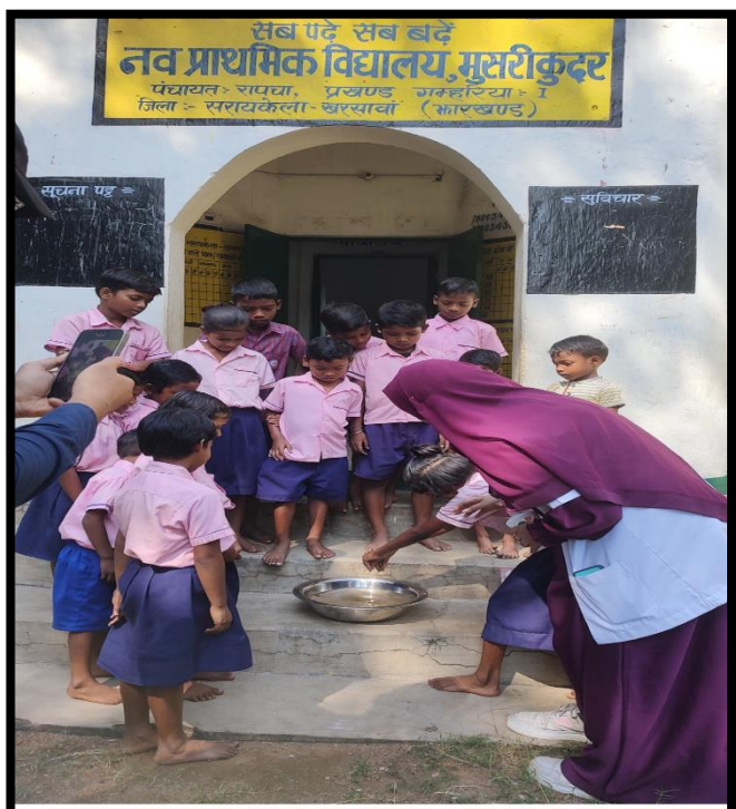
Village-pogrodih, Musari Kudar, Jharkhand 832108, India lat: 22.839953 long: 86.105431 alt: 187 Musari Kud. मुसारी केंद्र Terms