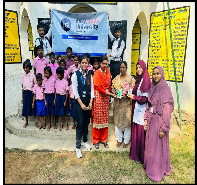
Faculties and students distributing the handwash, hand sanitizer and refill packs