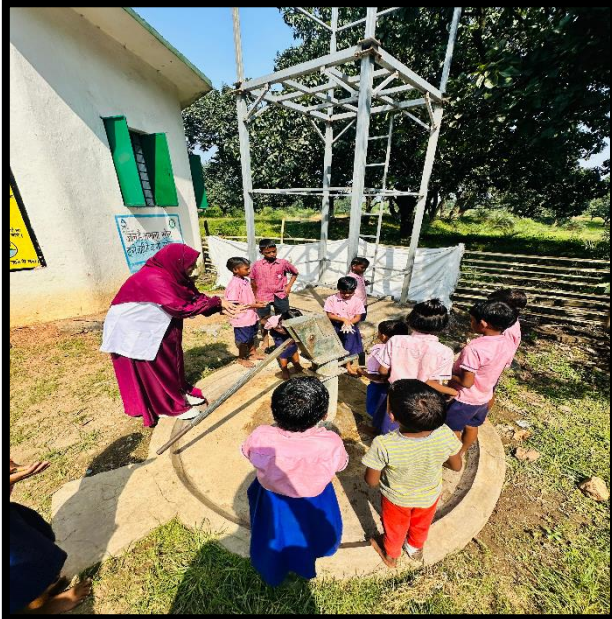
Demonstrating the children appropriate 7 steps of handwashing